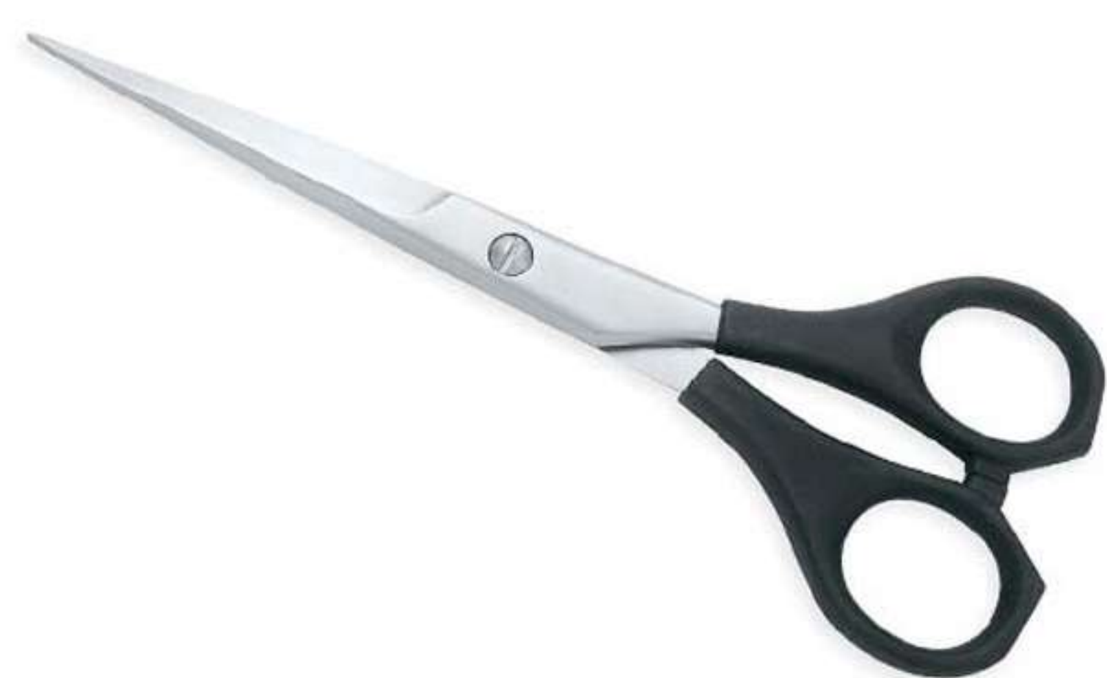
Art no: AS-3-1219

&nbsp;Barber Scissors with Plastic handle one blade micro serrated.