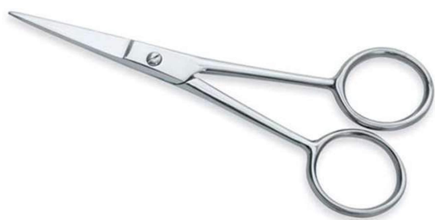
Art no: AS-3-1804

Blades of this utility Scissors are made out of high Carbon Japanese Stainless Steel Sheet and handles with Plastic, One blade micro serrated makes these Scissors perfect to cut anything from paper to heavy cloth or bandage in case of any emergency. Available Options Size 6"