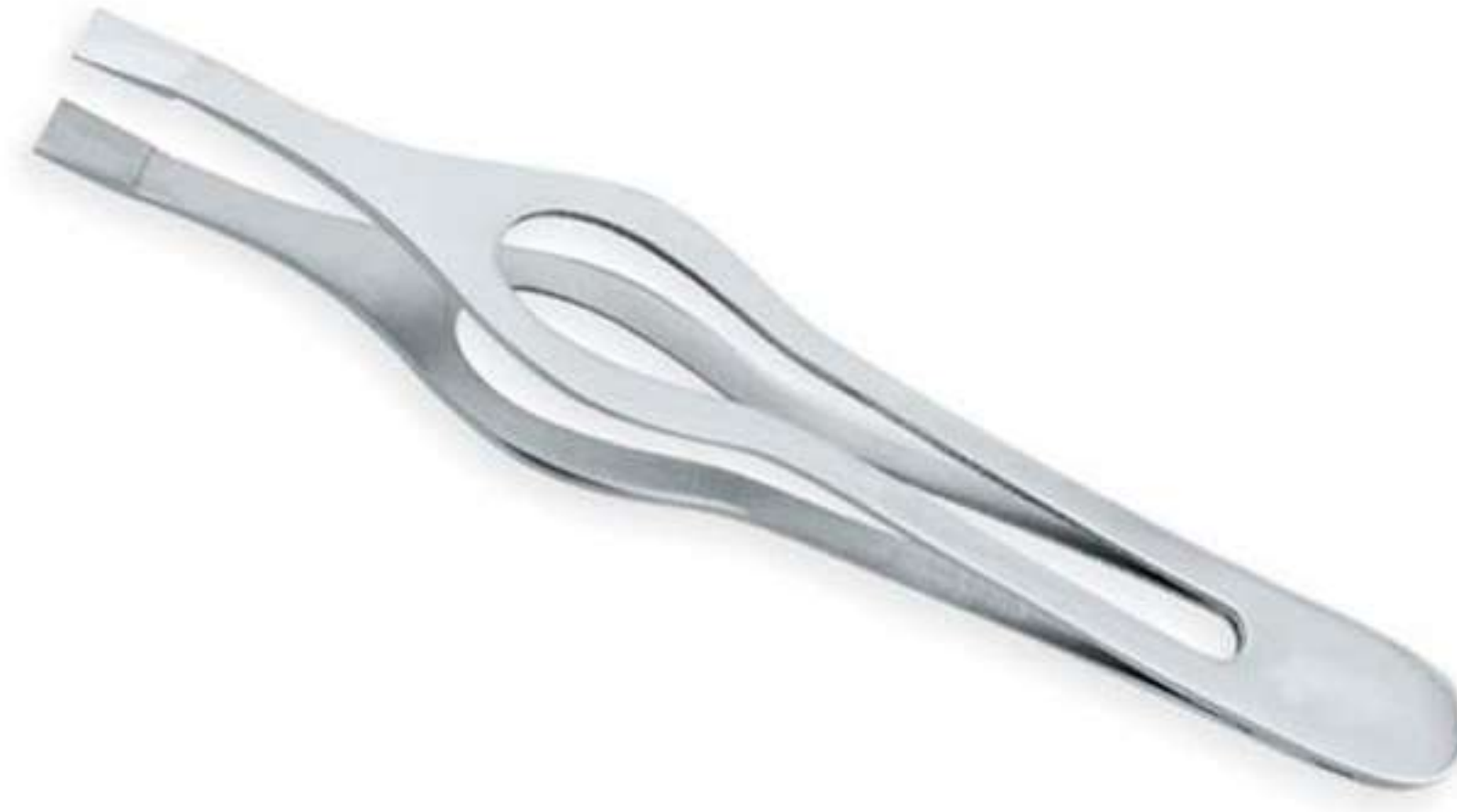
Art no: AS-3-1908

&nbsp;with magnifying glass Available Options Size 3"