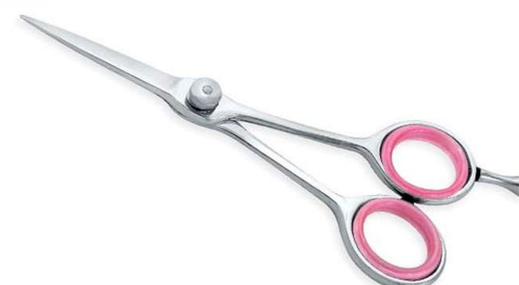
Art no: AS-3-1012

Available in Stainless steel AISI 420 or 440 with hollow ground inner blades and Convex edge, with six holes in blade for very creative cut. Available Options Size 8 1/2"