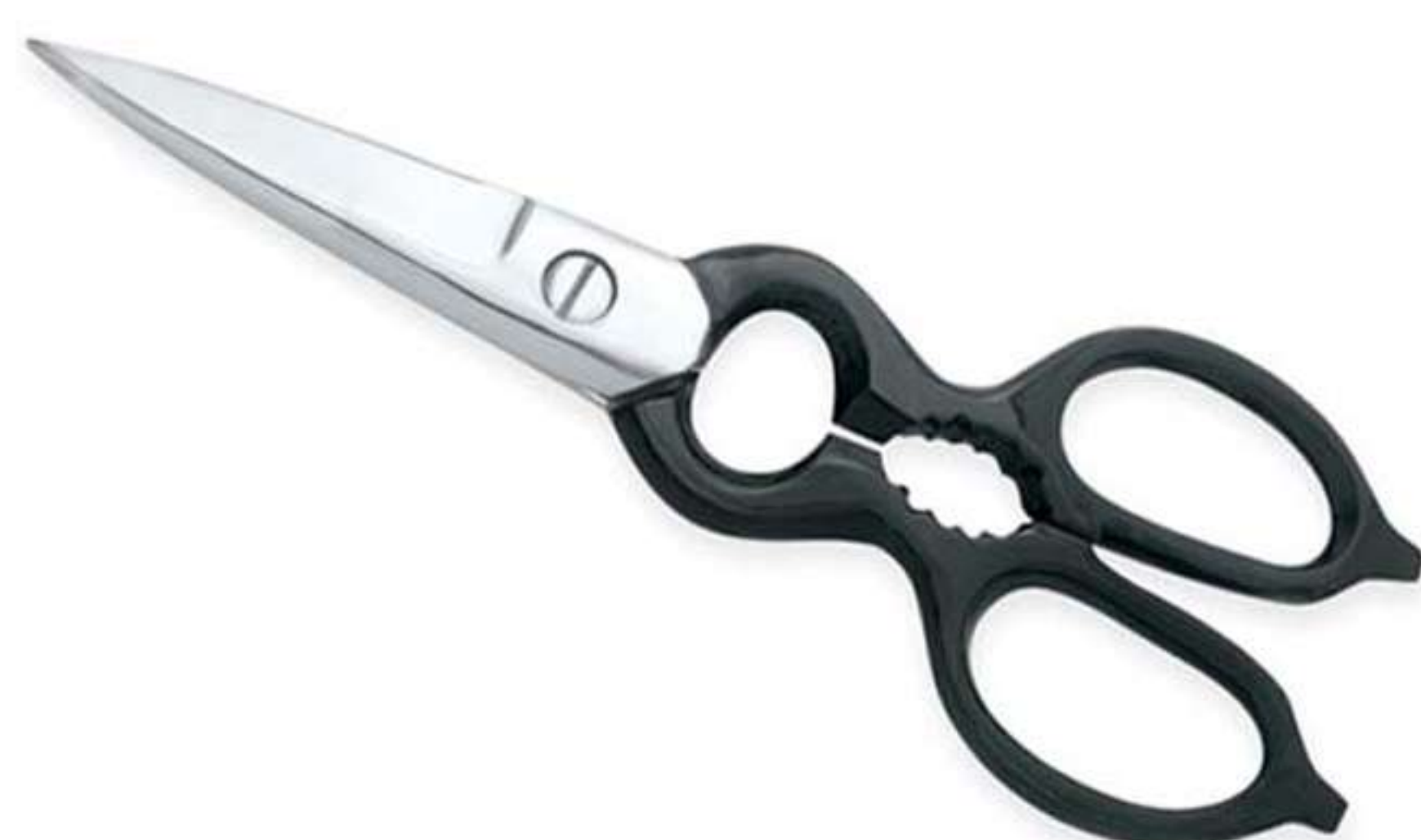
Art no: AS-3-1710

&nbsp;Sewing Scissors with plastic handle is rather lighter and cheaper option for the household scissors yet it provides excellent cutting ability and long lasting sharpness Available Options Size 7" 8"