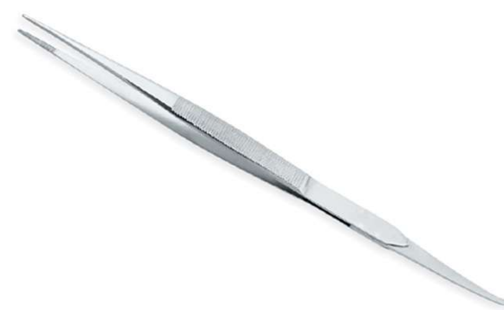
Art no: AS-3-2006

This classic model with serrated Sharp tips is used for various purposes from surgical to assembly line and it's available in magnetic and non magnetic steel type.