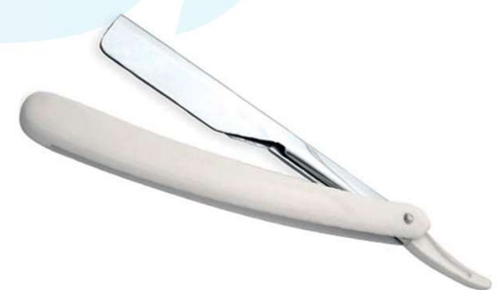
Art no: AS-3-1506

Professional Corn Cutter is made of surgical grade stainless steel so its safe to sterilize after every use in hot water.