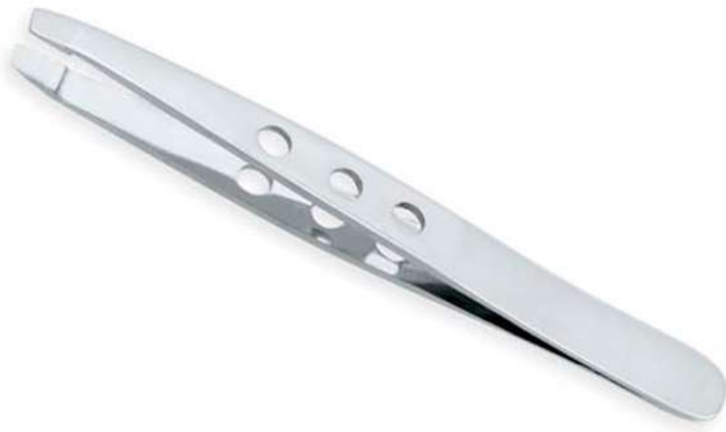
Art no: AS-3-1901

&nbsp;Tweezers, Perforated Available Options Size 3" 3.5" 4"