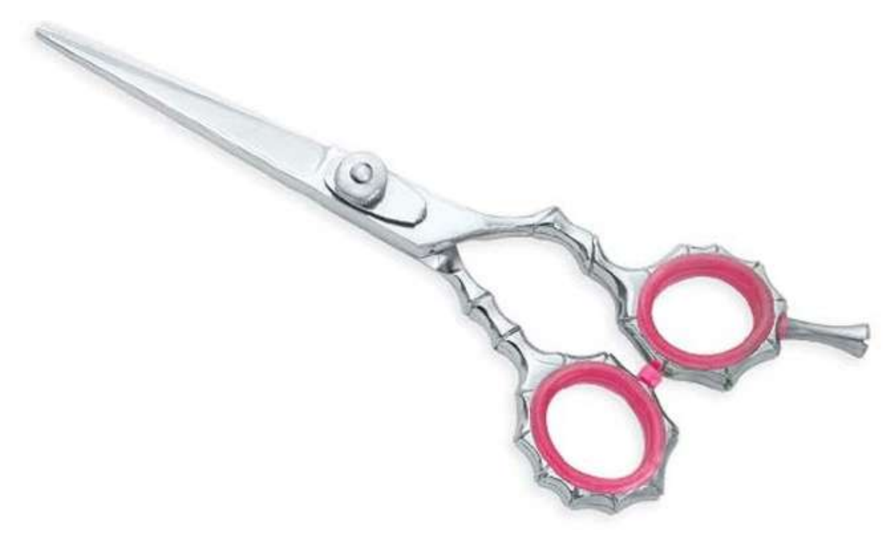
Art no: AS-3-1024

Available in Stainless steel AISI 420 or 440 with hollow ground inner blades and Convex edge, It's a very new model and is already a hit, Really a nice balanced pair of scissors.