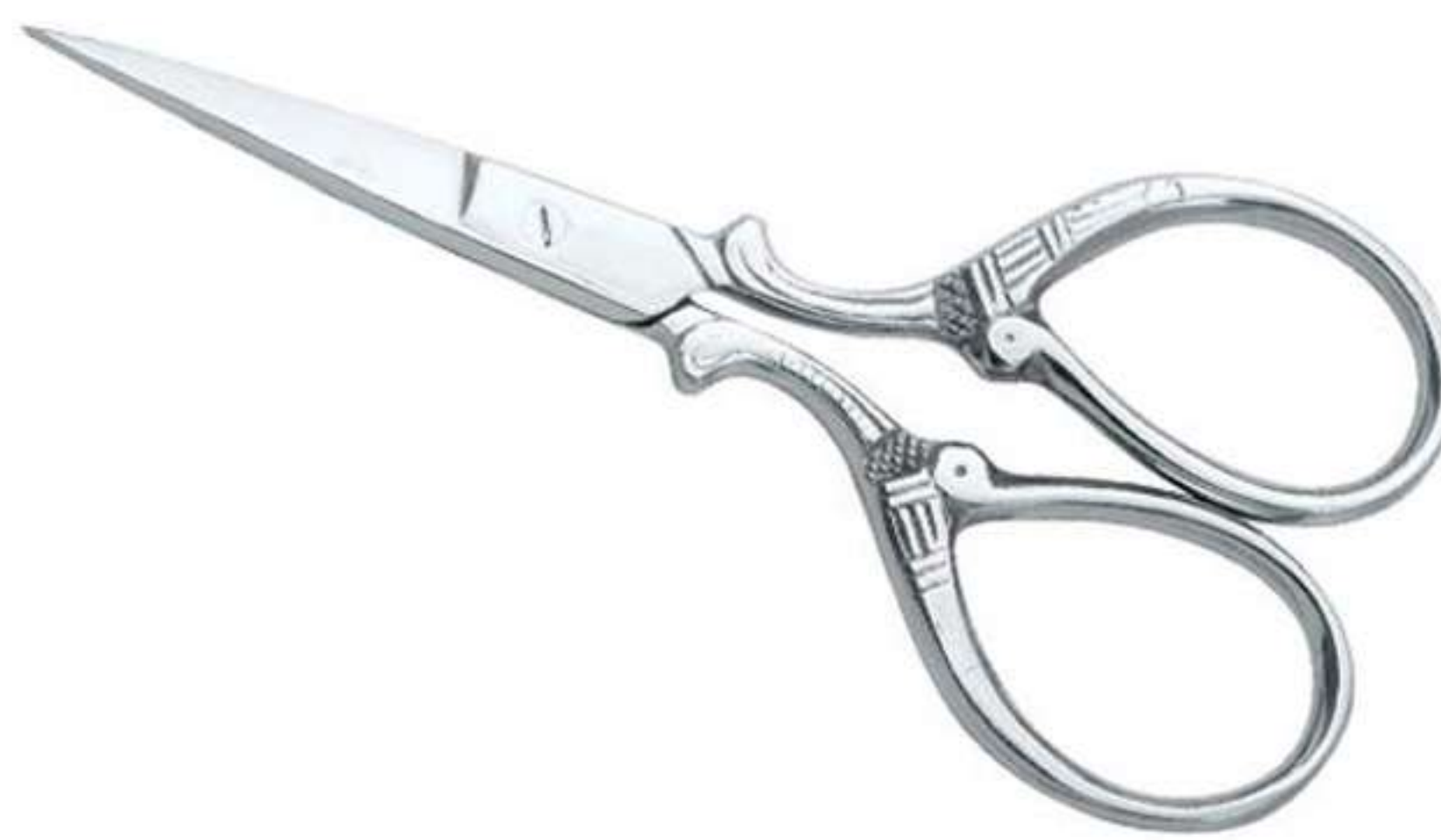
Art no: AS-3-1614

Beautiful design and excellent working ability is one of the features of our range of Fancy Scissors which are made out of Special Steel for long lasting cutting ability