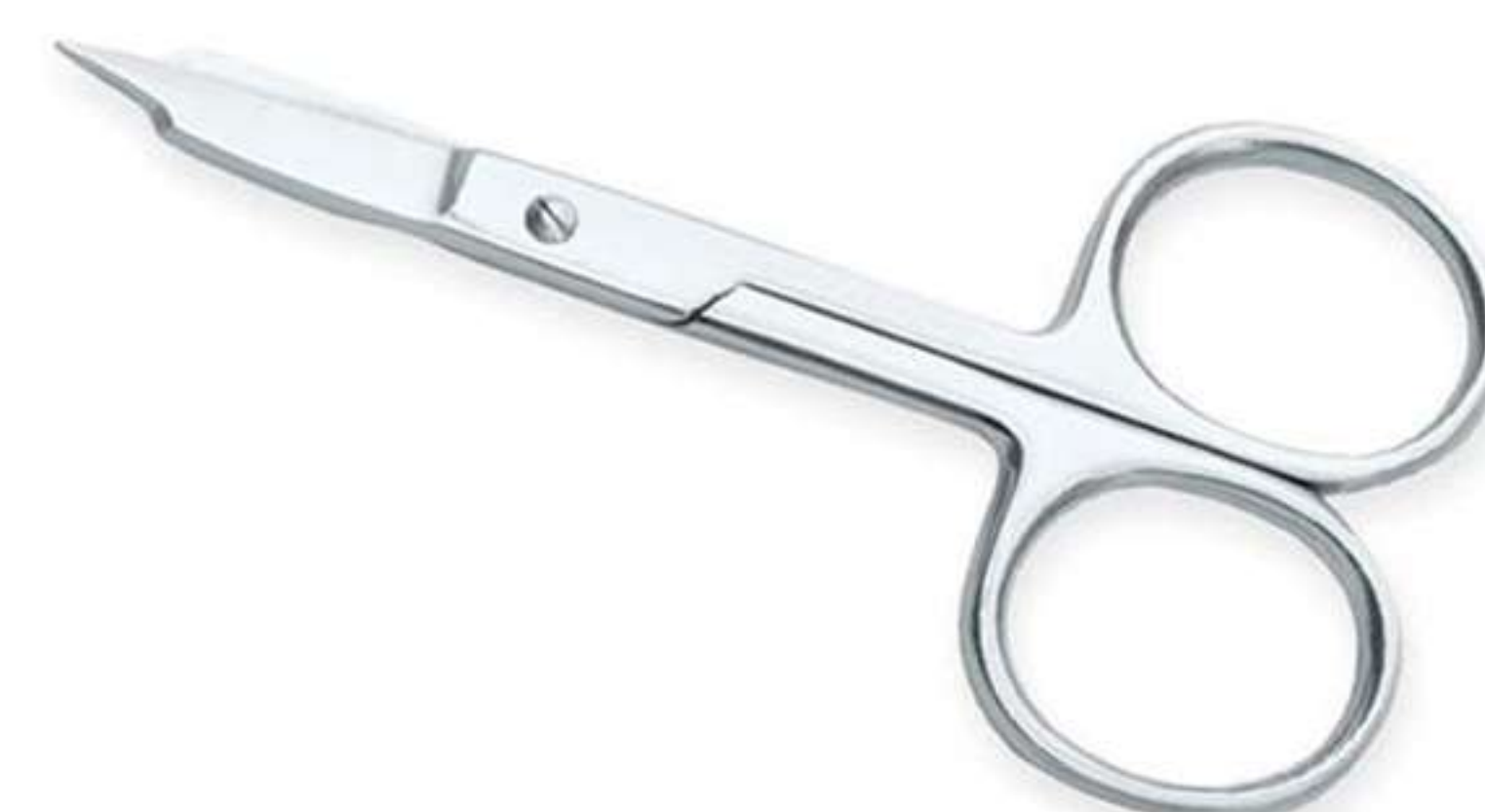
Art no: AS-3-1819

&nbsp;Nail Scissors Tower point is designed to cut your normal hairs with perfection as well as to cut your ingrown nails with it sharply grinded tip.