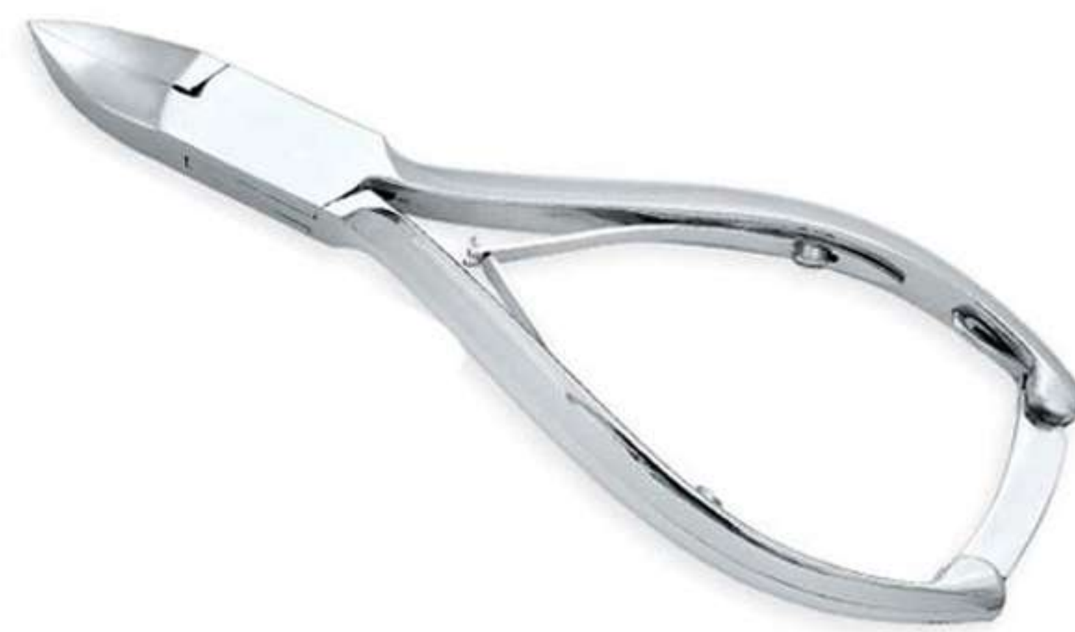
Art no: AS-3-2114

Forged from Surgical Grade Stainless Steel with Box Joint, Double Sheet Springs and lock back handles for professional work.<br />