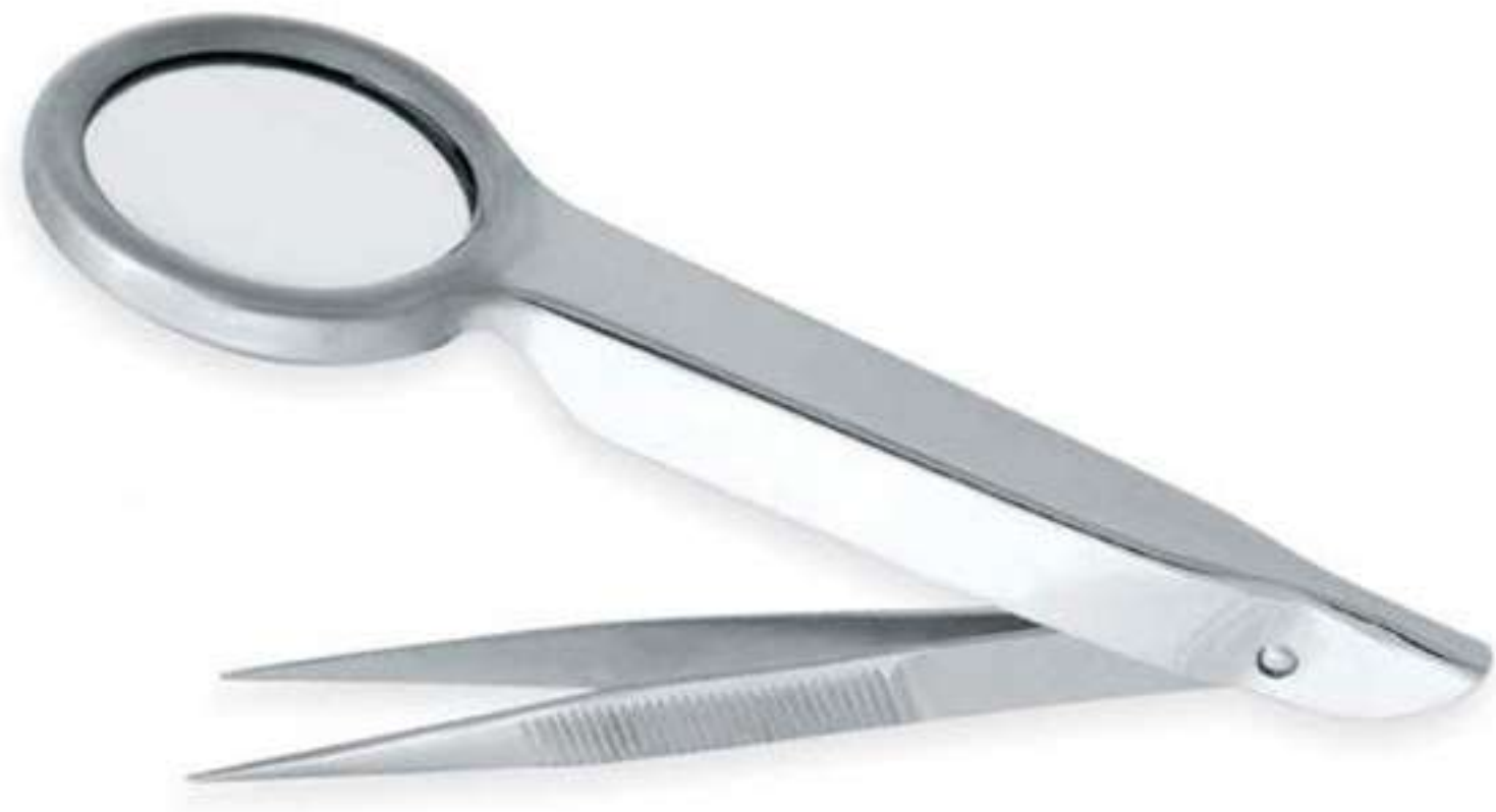
Art no: AS-3-1907

&nbsp;with magnifying glass Available Options Size 3"