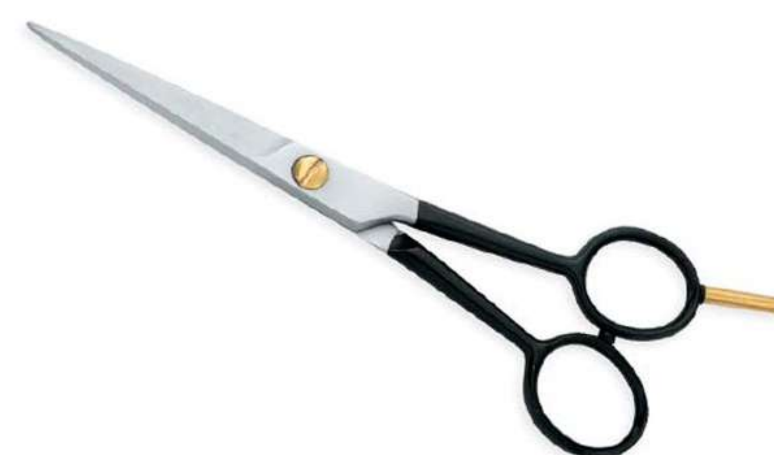
Art no: AS-3-1215

&nbsp;Made from selected steel and crafted to perfection for smooth operation and sharpness with one blade micro serrated, No finger rest, This is ideal model for people looking for Economic Scissors with smaller blades. Available Options Size 6.5"