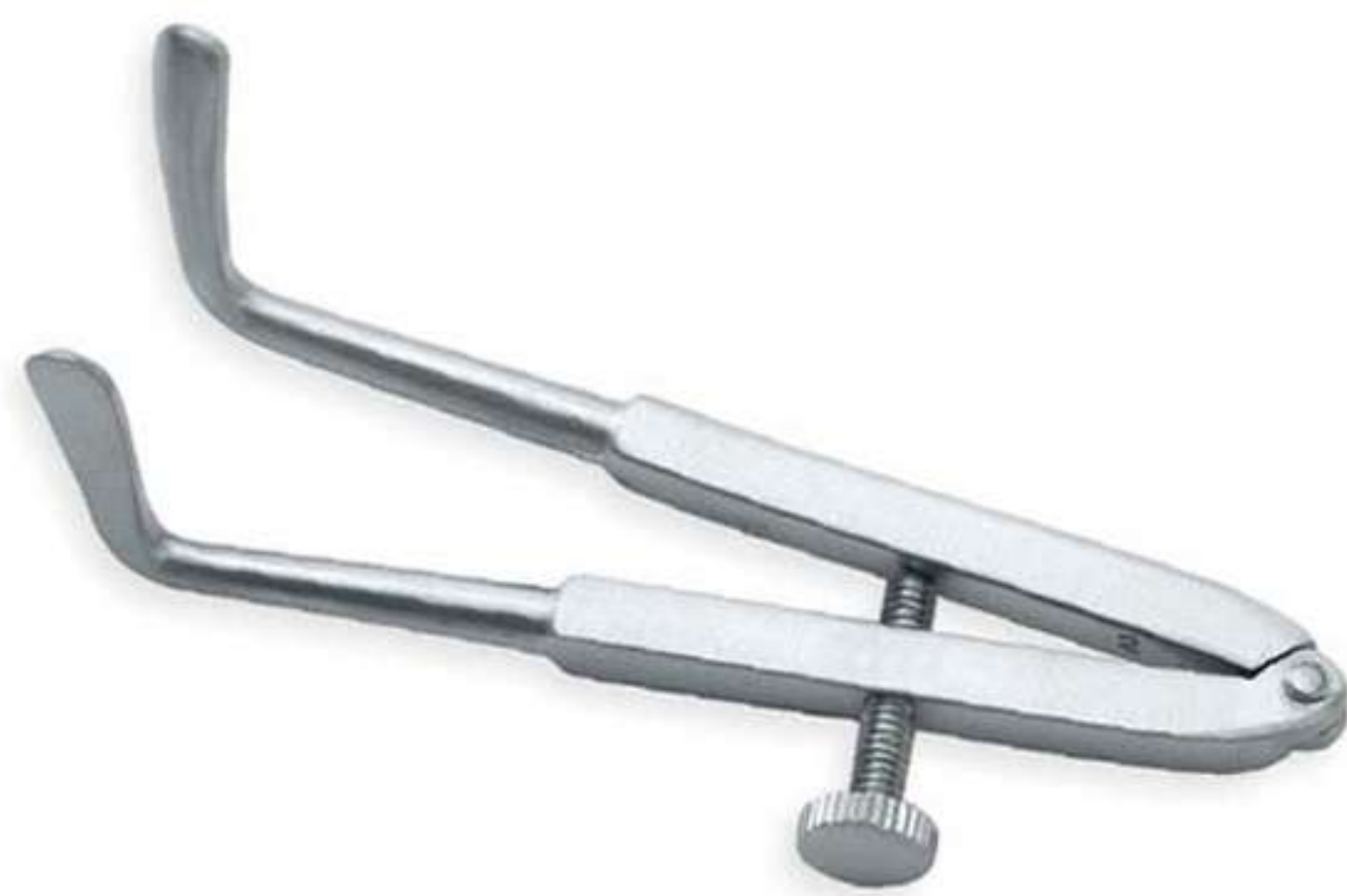
Art no: AS-3-1501

An essential tool for pedicurists to open the fingers so they can easily work. Made of surgical grade stainless steel so it's safe to sterilize in Hot water.