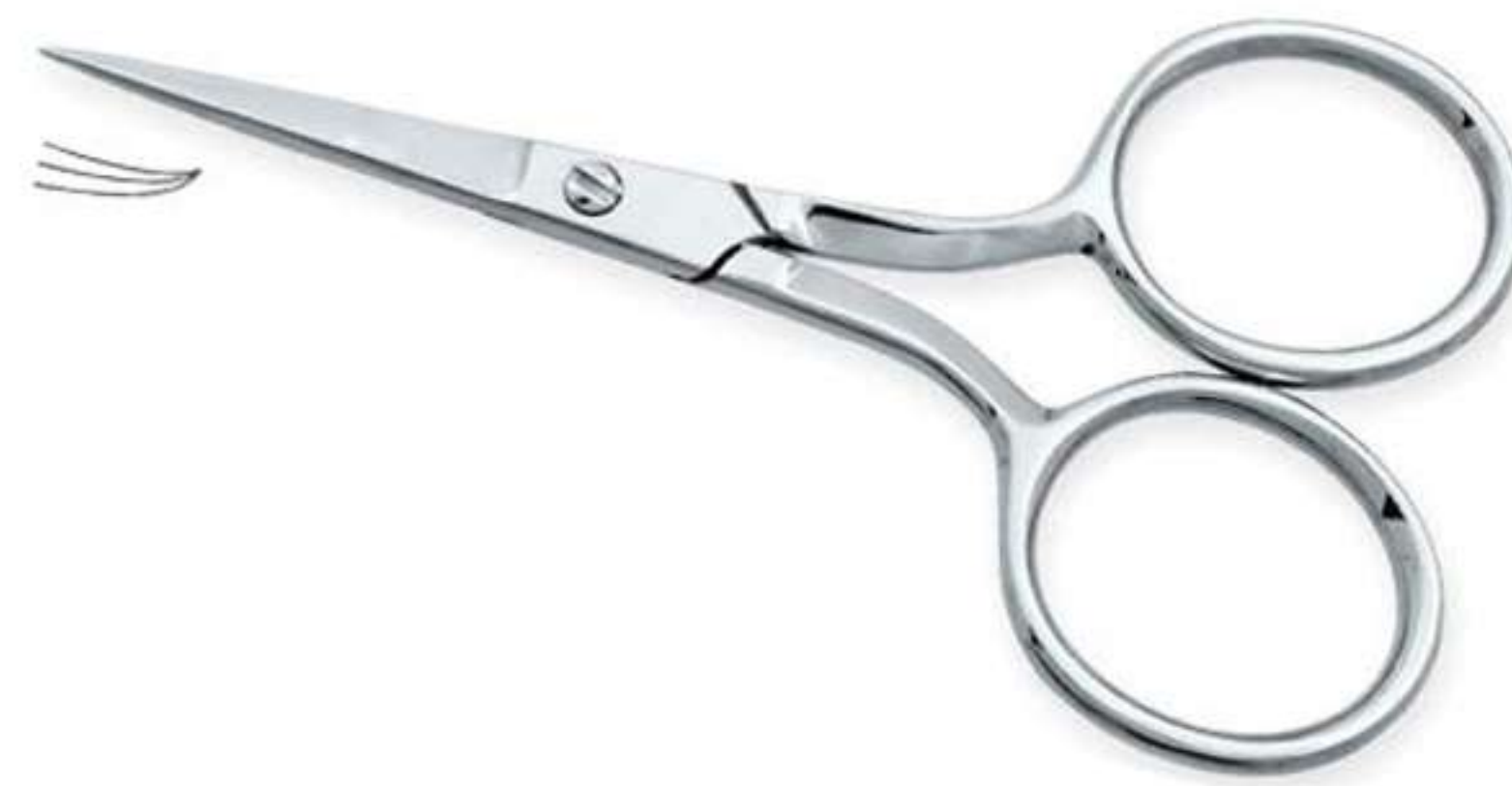
Art no: AS-3-1623

Beautiful design and excellent working ability is one of the features of our range of Fancy Scissors which are made out of Special Steel for long lasting cutting ability.