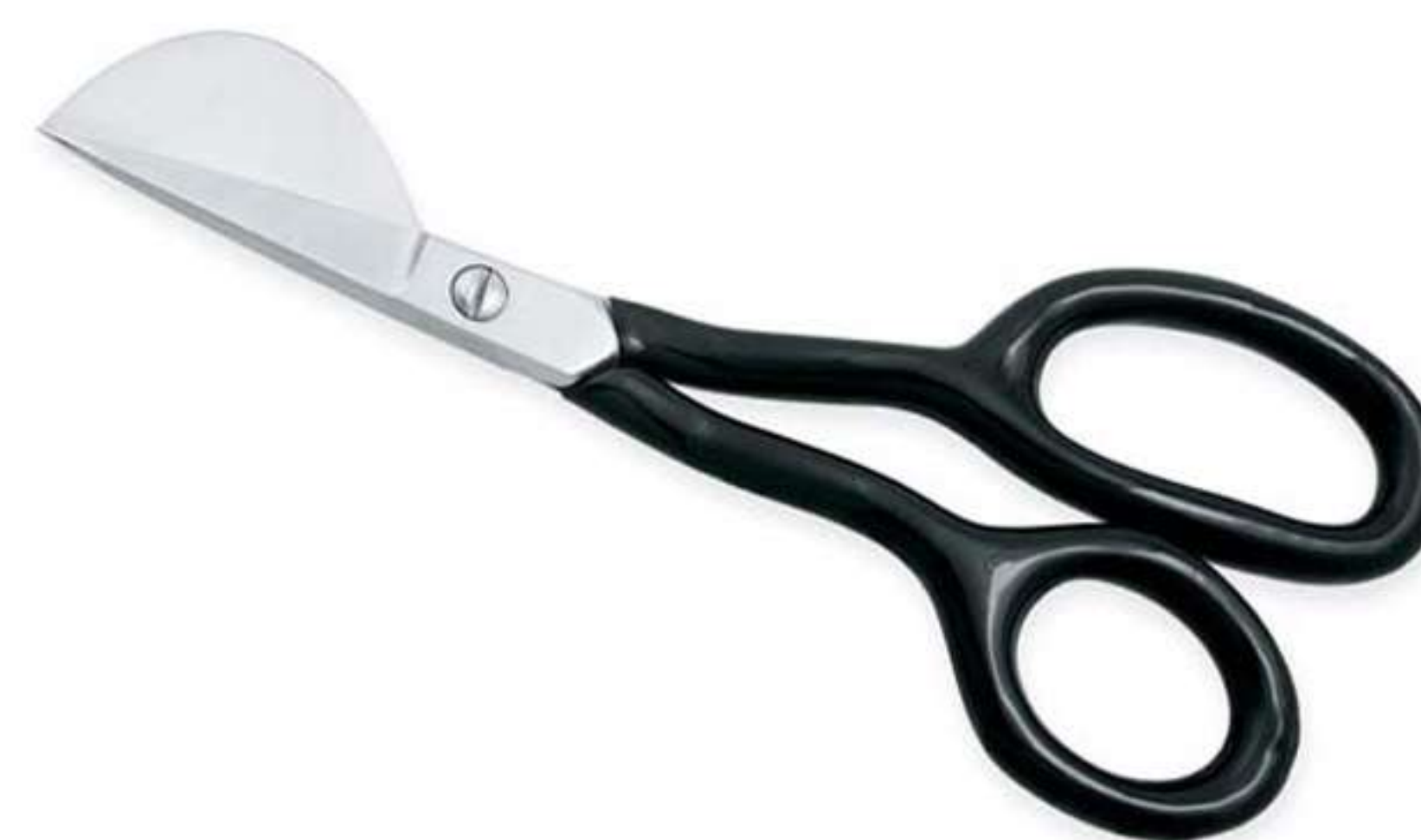
Art no: AS-3-1809

Its ergo design and made out of special steel with handles dipped in rubber comes with excellent craftsmanship, this scissors is a must for any line of utility Scissors. This is heavier version and we also have a lighter version of the same.