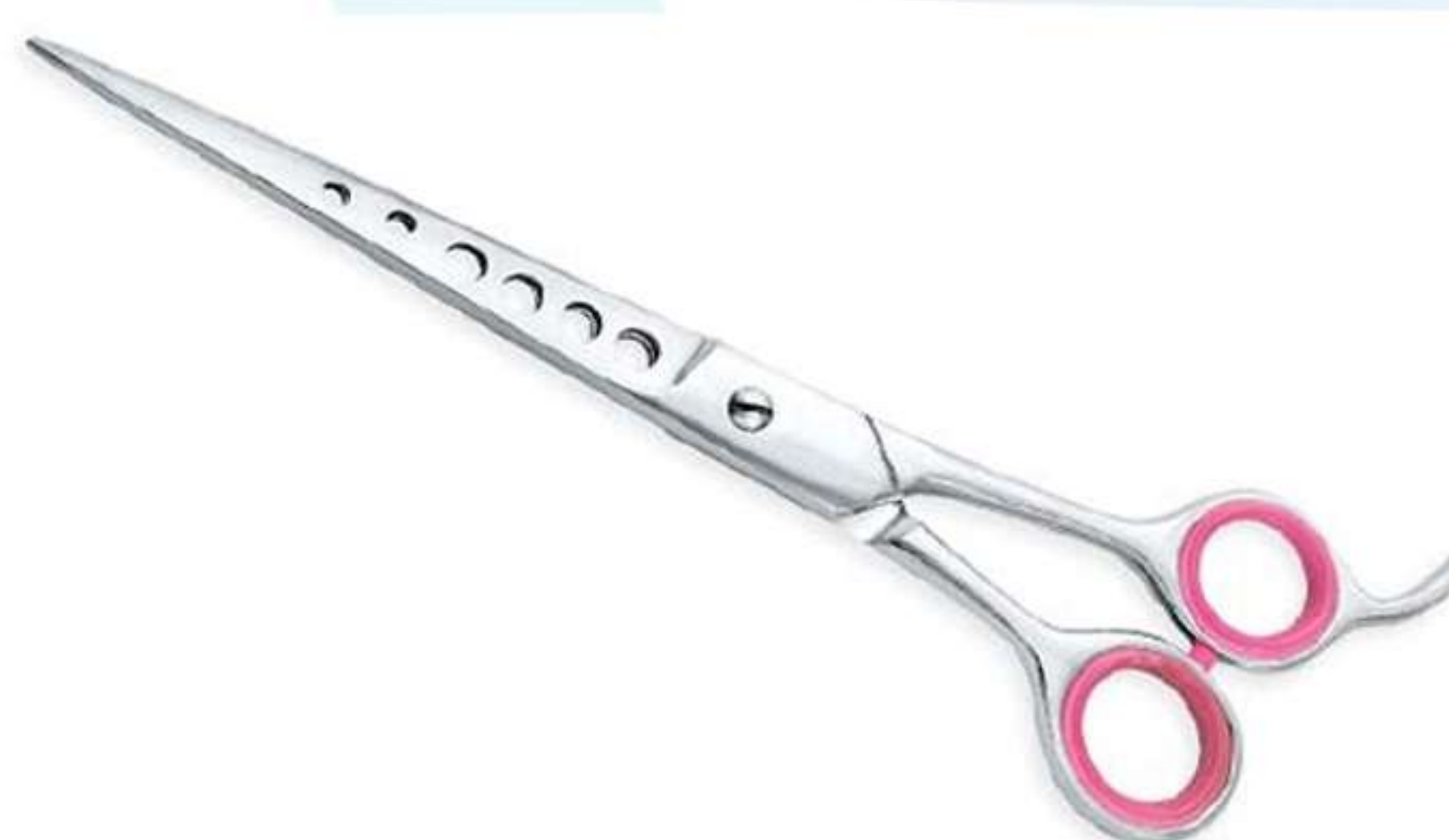
Art no: AS-3-1011

Available in Stainless steel AISI 420 or 440 with hollow ground inner blades and Convex edge, with Swirl thumb for free movement of scissors for very creative and stylish looking cut. Available Options Size 5 1/2" 6"