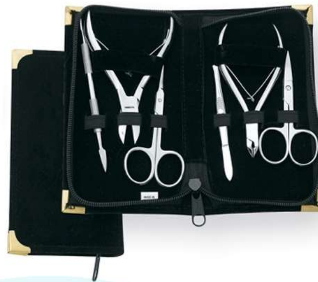
Art no: AS-3-2208

Essential for every manicure & pedicure professional, packing available in different colors of velvet and leather pouches