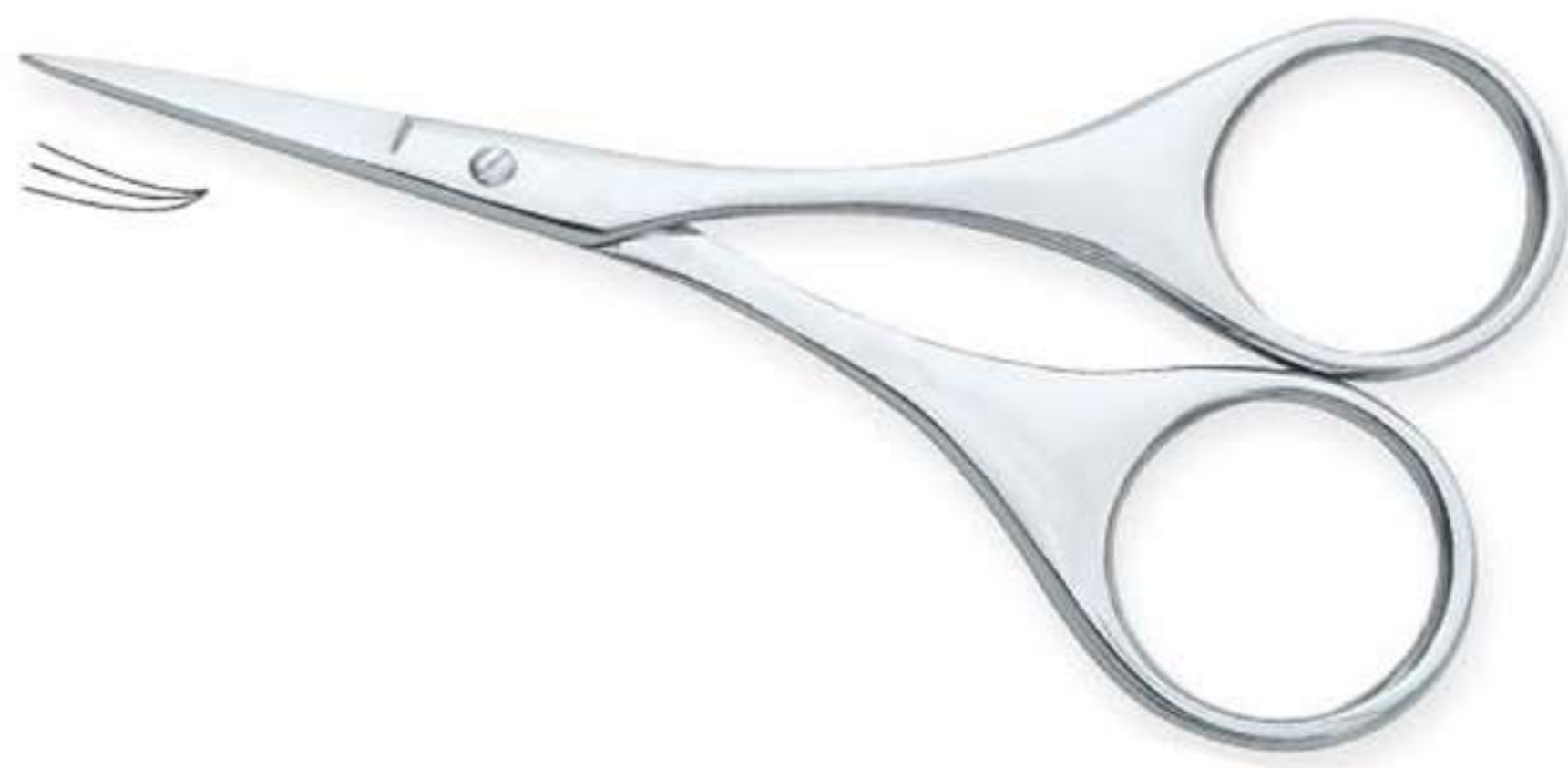
Art no: AS-3-1619

Beautiful design and excellent working ability is one of the features of our range of Fancy Scissors which are made out of Special Steel for long lasting cutting ability.