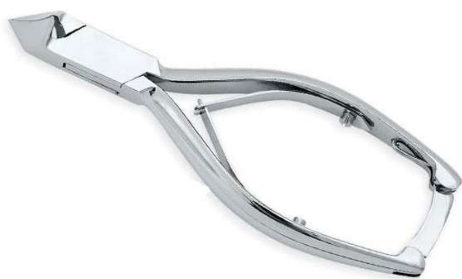
Art no: AS-3-2116

Forged from Surgical Grade Stainless Steel with Box&nbsp;Joint, Double Sheet Spring and lock back handles for professional work.<br />