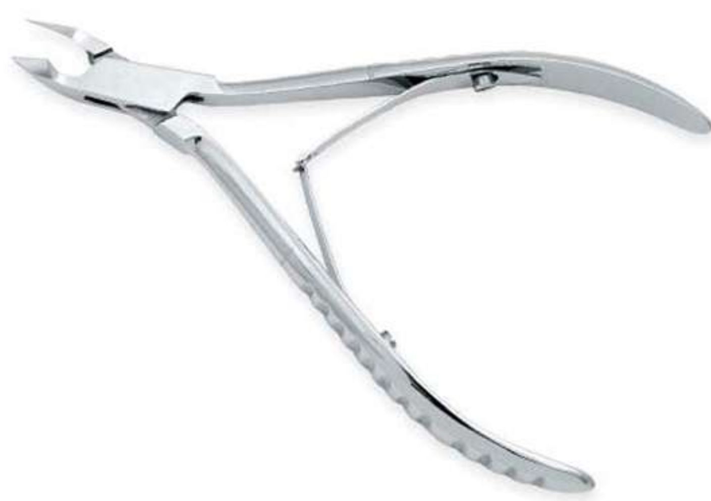
Art no: AS-3-2122

Forged from Surgical Grade Stainless Steel with Box Joint, Single Sheet Spring and with rounded smooth shape Available Options Size 4"