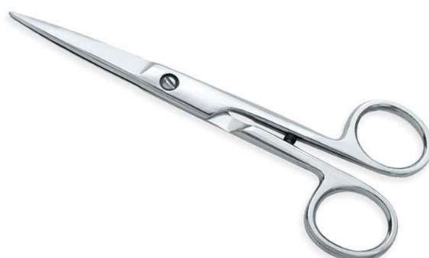
Art no: AS-3-1305

Made from Selected steel and machined to perfection for smooth texturing operation with 8 teeth single blade texturing Scissors: Available Options Size 6"