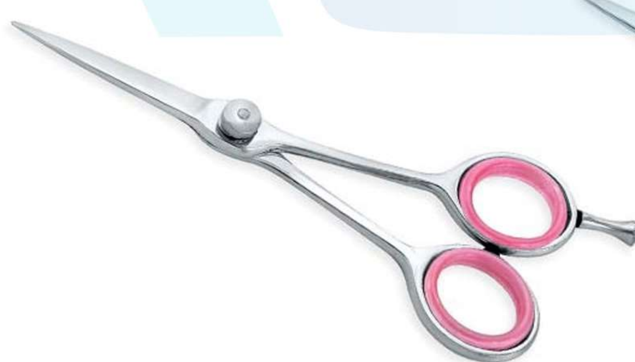
Art no: AS-3-1011

Available in Stainless steel AISI 420 or 440 with hollow ground inner blades and Convex edge, with six holes in blade for very creative cut. Available Options Size 8 1/2"