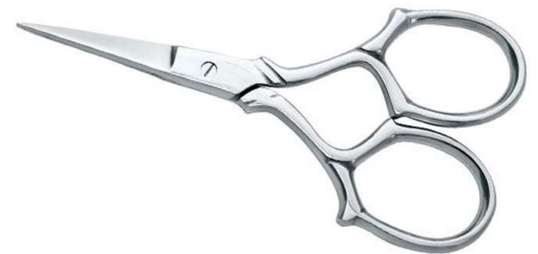
Art no: AS-3-1615

Beautiful design and excellent working ability is one of the features of our range of Fancy Scissors which are made out of Special Steel for long lasting cutting ability