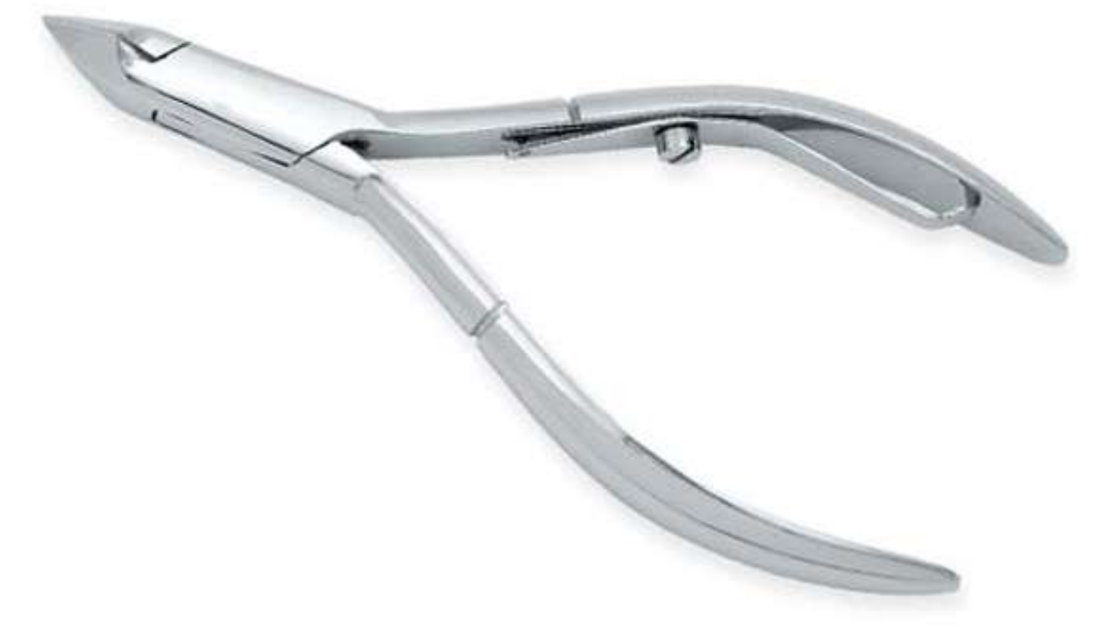
Art no: AS-3-2121

Forged from Surgical Grade Stainless Steel with Box Joint, Double Sheet Springs and with texture on handles for grip Available Options Size 4"