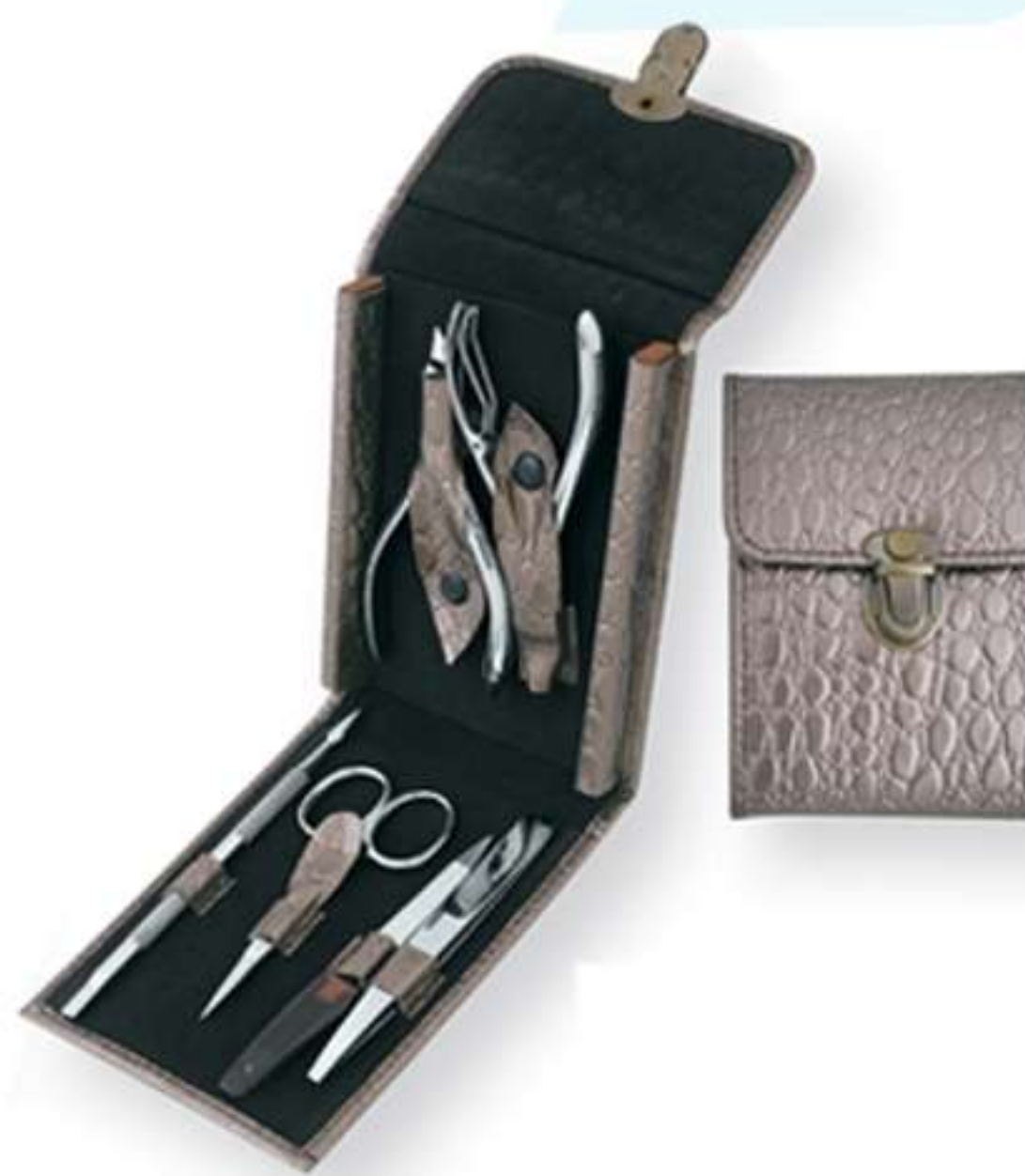
Art no: AS-3-2216

Professional Manicure Set Contains:<br /> Cuticle Nippers # 979<br /> Nail Scissors # 858<br /> Nail File # 105<br />