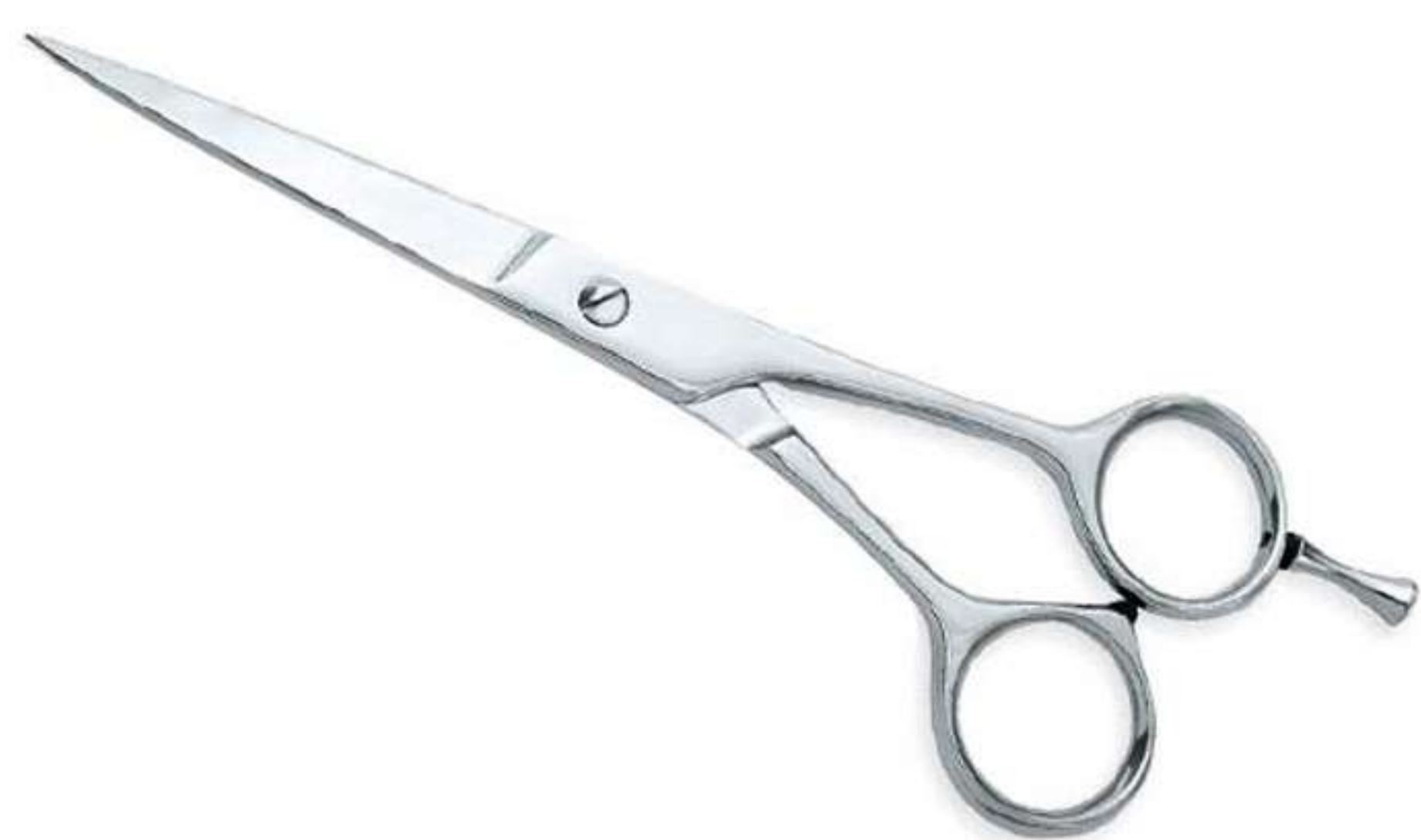
Art no: AS-3-1213

&nbsp;Made from selected steel and crafted to perfection for smooth operation and sharpness with one blade micro serrated, No finger rest, This is ideal model for people looking for Economic Scissors with classic models. Available Options Size 6.5"