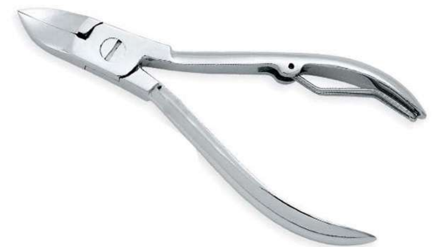
Art no: AS-3-2103

Forged from Surgical Grade Stainless Steel with Box Joint, Single Sheet Spring and finished to perfection Available Options Size 3.5" 4"