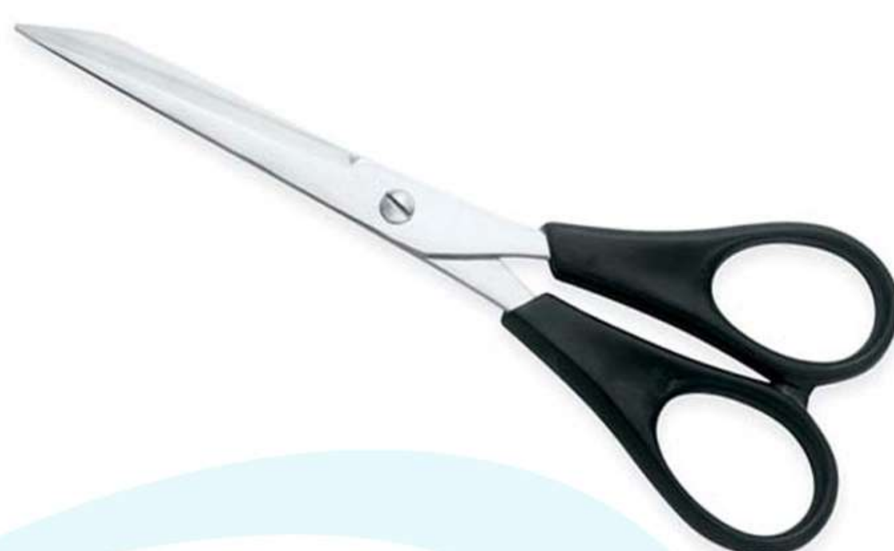
Art no: AS-3-1708

&nbsp;Sewing Scissors is available in assorted sizes for the varied operations for the household as well as for the industrial purposes. Excellent craftsmanship makes these scissors a special one to be used for comfort and ease..... Available Options Size 6" 7" 8"