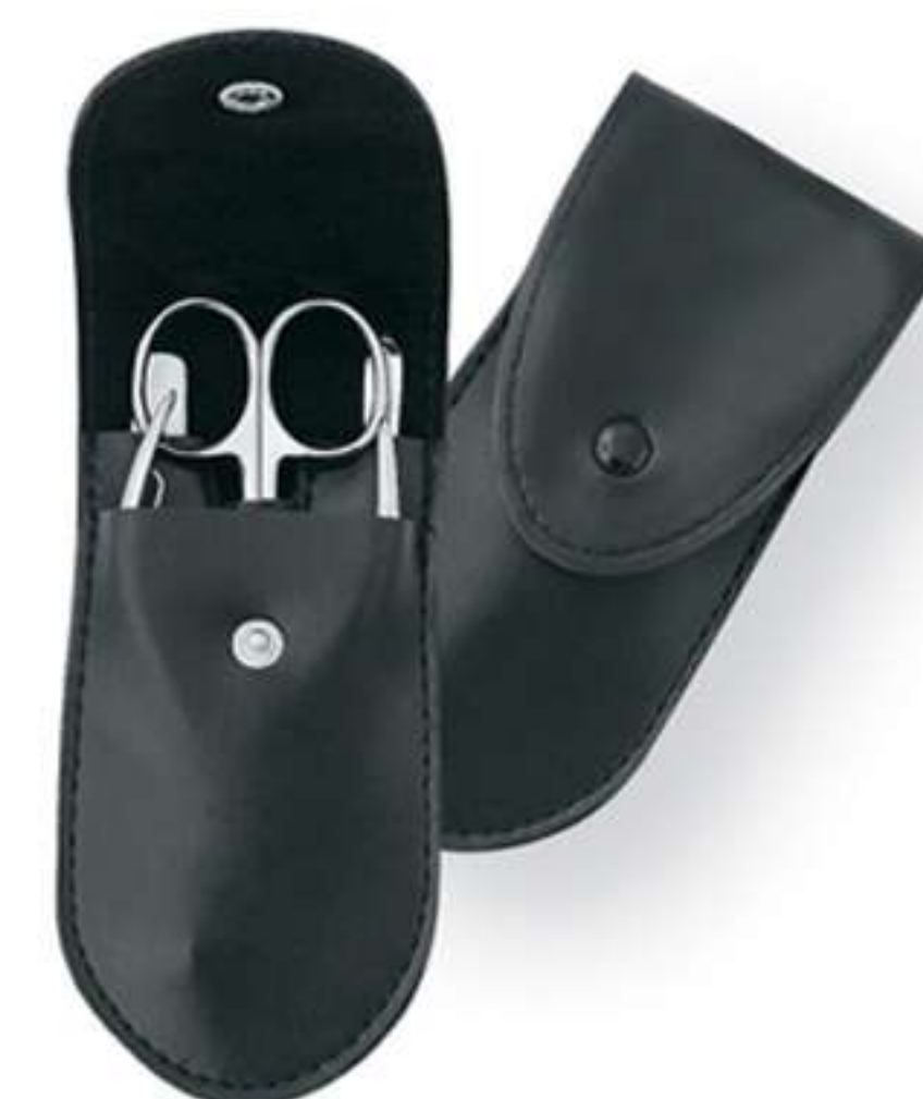
Art no: AS-3-2203

Manicure Set Contains:<br /> Nail Nipper # 914<br /> Tweezers # 081<br /> Cuticle Nippers # 911<br /> Pushers # 146<br /> Nail Scissors # 856<br />