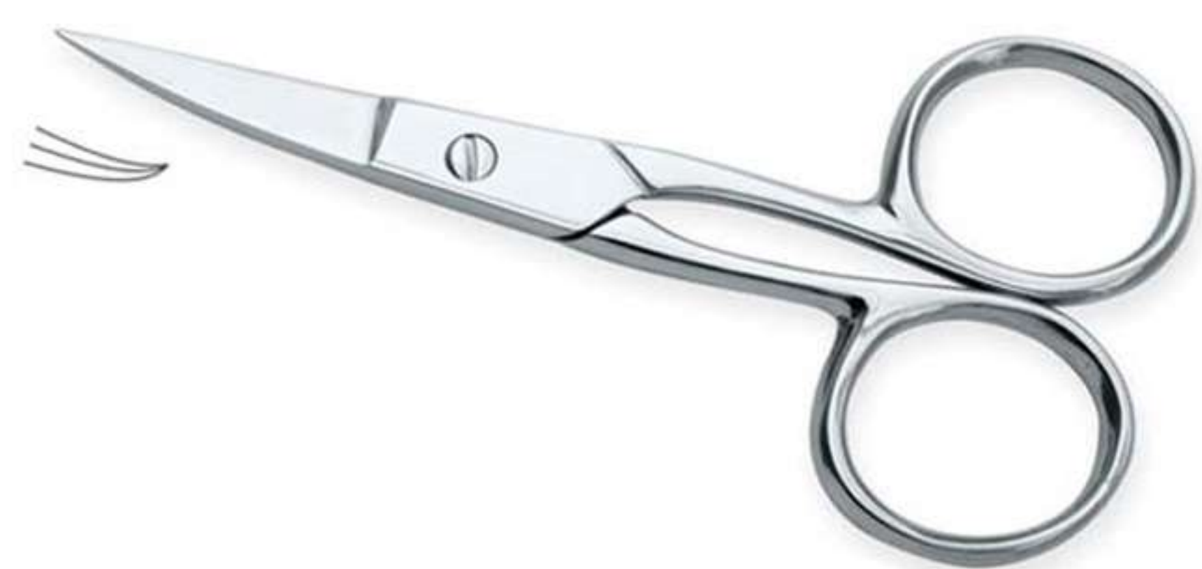
Art no: AS-3-1801

&nbsp;Heavy Duty Nails Scissors are designed for the perfect cut even for the thick and strong nails and this model is also very well received in Embroidery line. Made from Special Stainless steel gives it long lasting cutting ability.