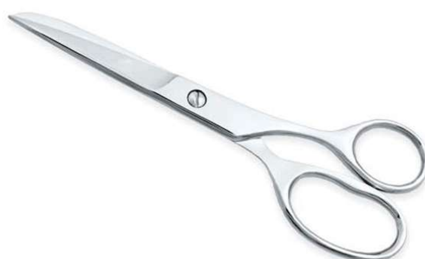
Art no: AS-3-1702

Sewing Scissors with one pointed and one round blade is available in Size 6", 7", 8"; for various uses at home or for the industrial purpose. This Scissors is made out of high carbon Stainless Steel alloy which gives it long lasting sharpness