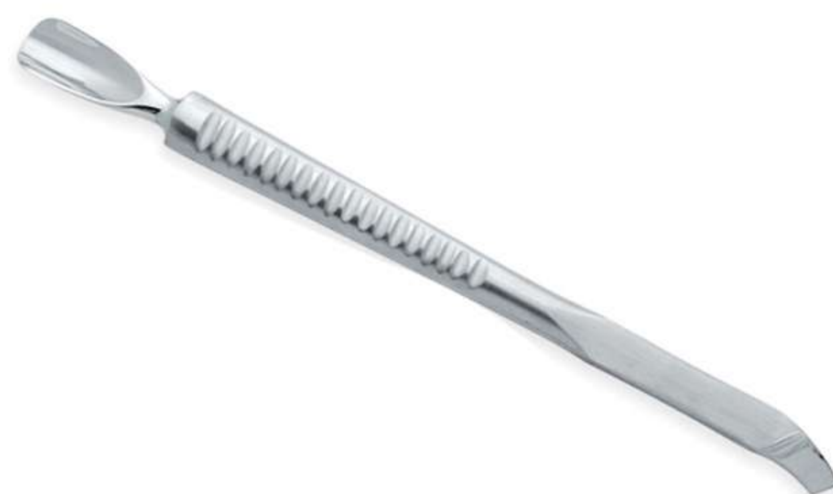
Art no: AS-3-2302

Cuticle Pushers Single Ended made of surgical grade stainless steel of Japanese origin makes these tools truly professional and surgical grade allows you to sterilize these after every use.