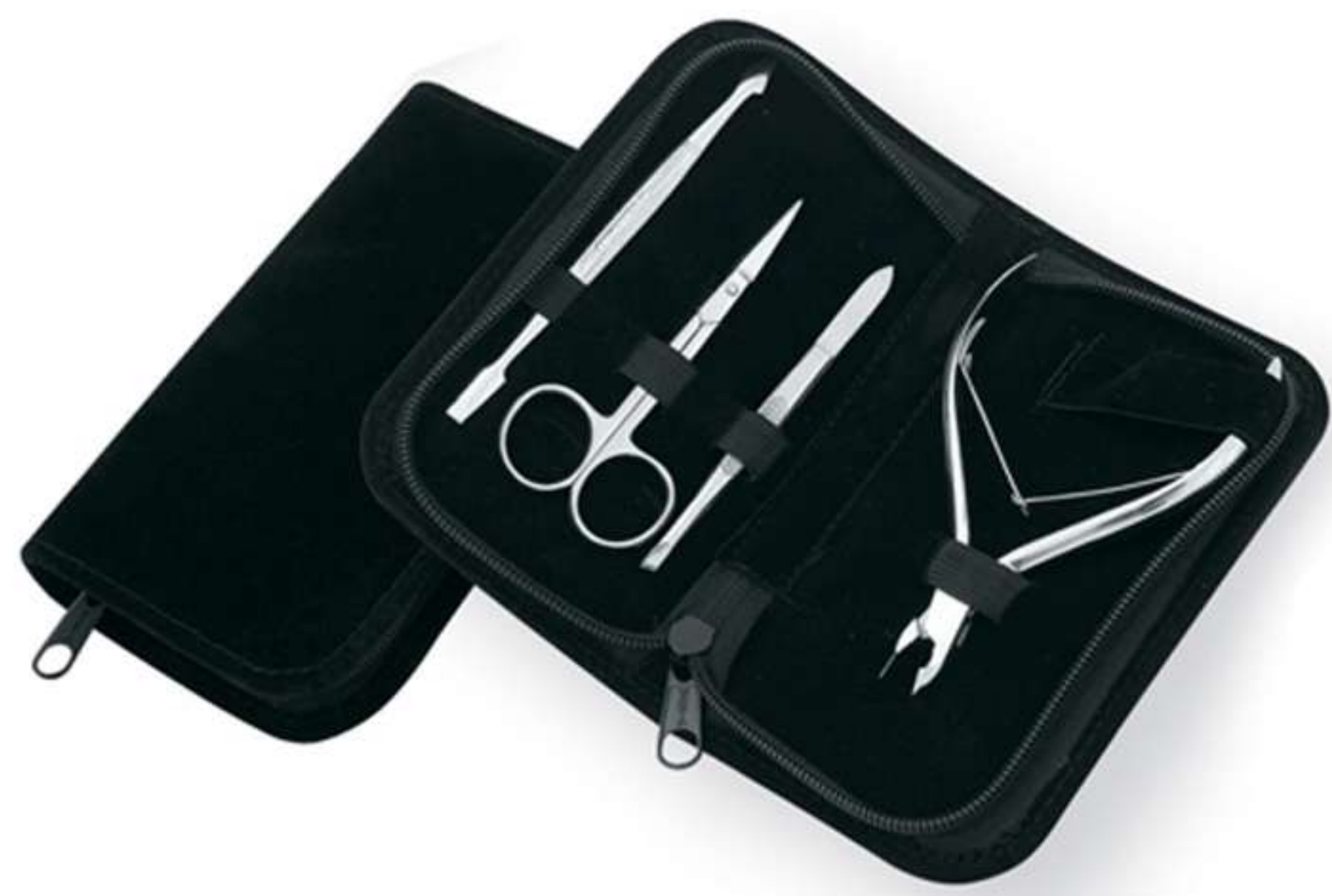
Art no: AS-3-2210

Contains: Nail Pusher # 124, 116, 133, 144, 119, 139, 128, 135. Choose any 8 Different modles From our large range of Quality Pushers & Cleaners.