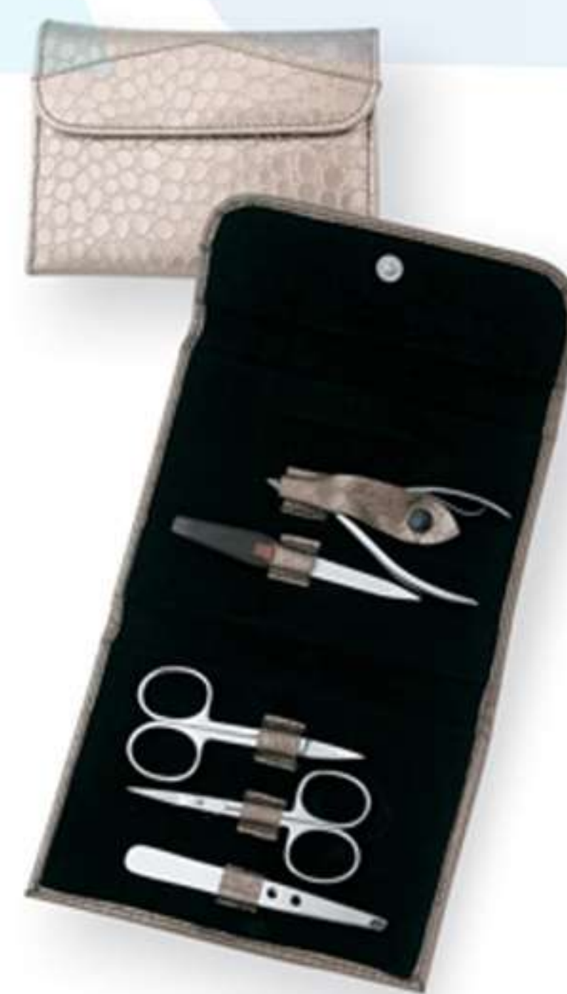
Art no: AS-3-2217

Manicure Set Contains:<br /> Nail Nippers # 914<br /> Cuticle Nippers # 911<br /> Tweezers # 081<br />