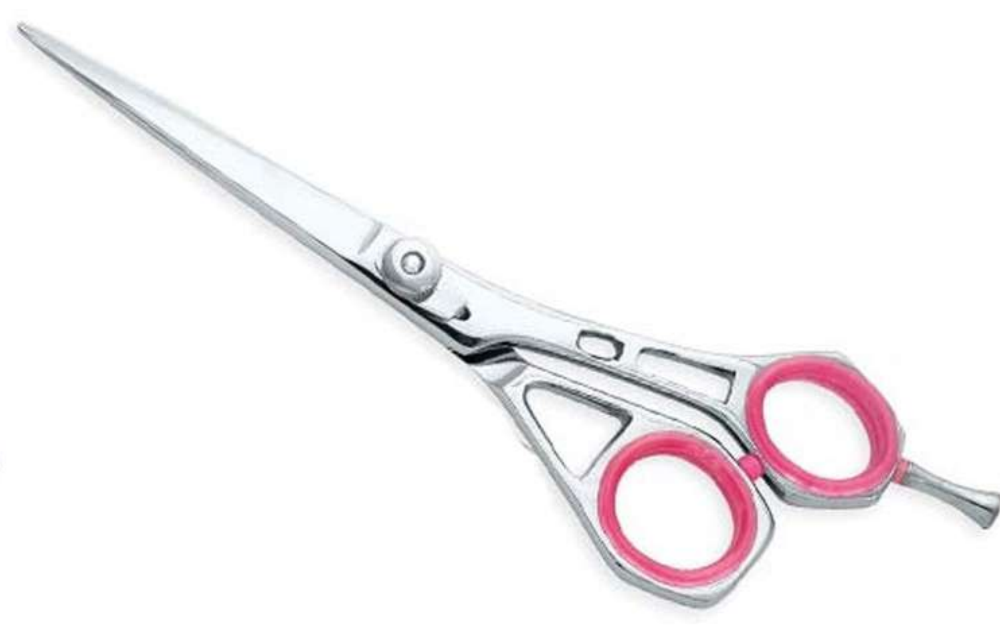
Art no: AS-3-1008

Available in Stainless steel AISI 420 or 440 with hollow ground inner blades and Convex edge, Samurai Sword Type blade shape for smooth creative cut. Available Options Size 6 1/2"