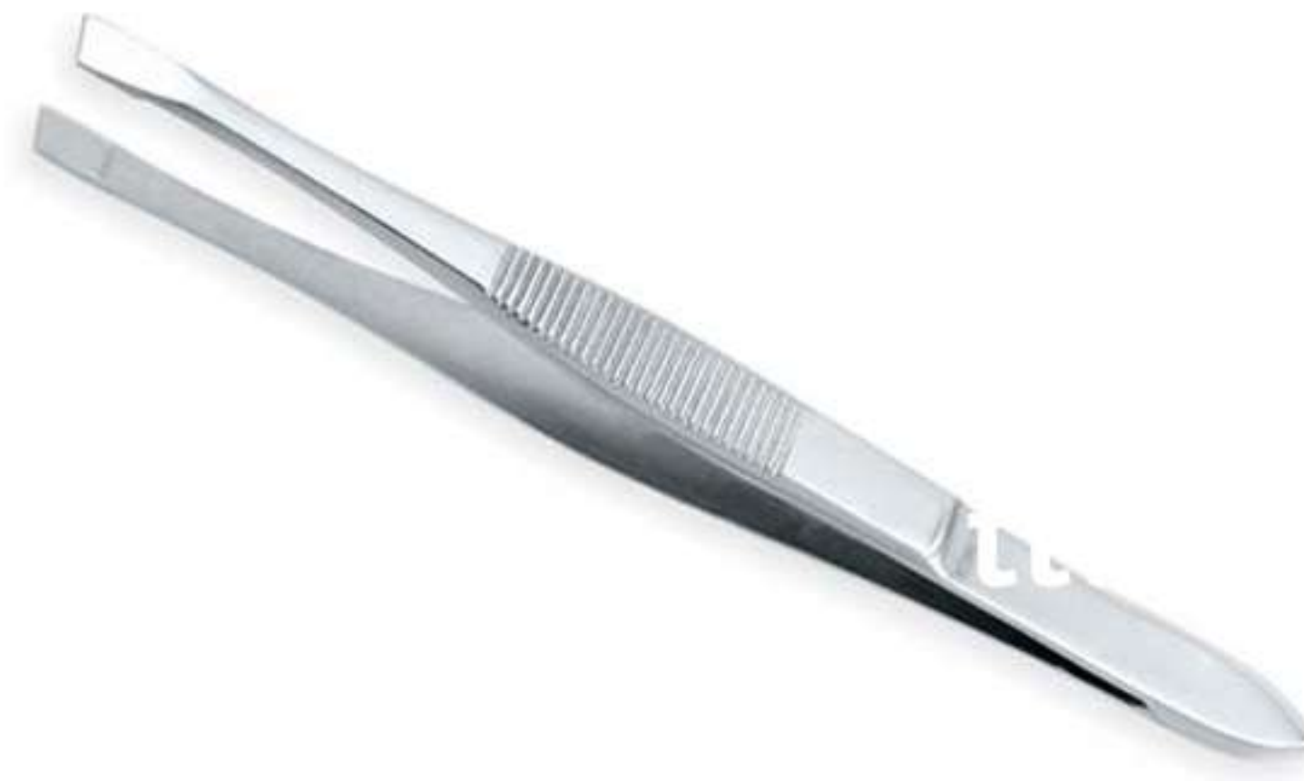
Art no: AS-3-1902

&nbsp;Tweezers, Perforated Available Options Size 3" 3.5" 4"