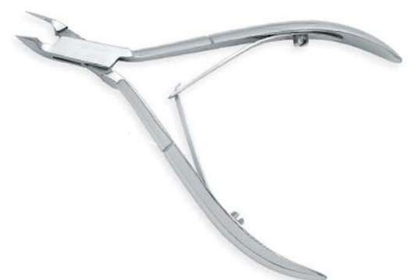
Art no: AS-3-2124

Forged from Surgical Grade Stainless Steel with Lap Joint, Double Sheet Spring and finished to perfection Available Options Size 4.5"