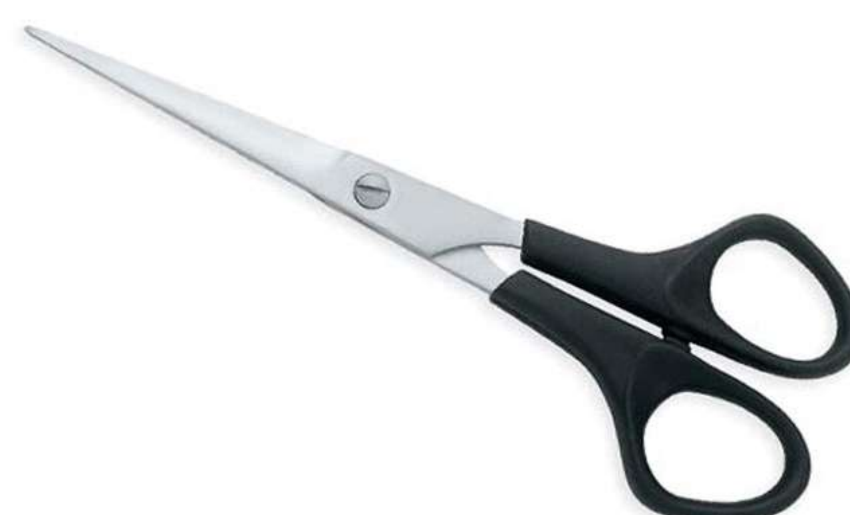
Art no: AS-3-1303

Made from Selected steel and machined to perfection for smooth thinning operation with 22 teeth double blade thinning Scissors Available Options Size 6"