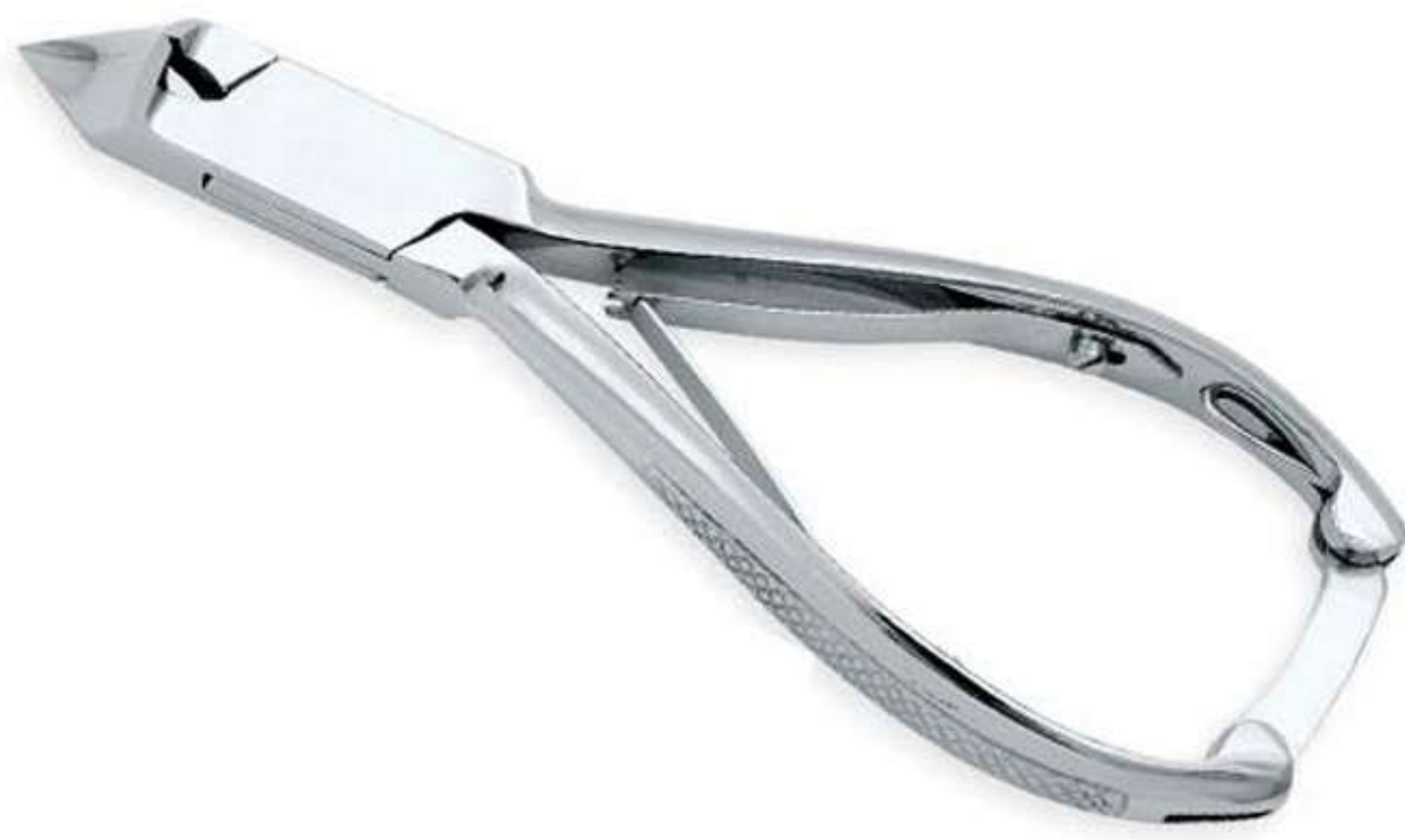
Art no: AS-3-2107

Forged from Surgical Grade Stainless Steel with Box Joint, Double Sheet Springs and serrations on handles for strong grip, Ideal for professional pedicure work.