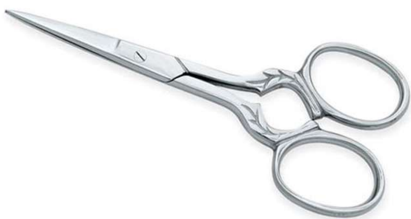
Art no: AS-3-1616

Beautiful design and excellent working ability is one of the features of our range of Fancy Scissors which are made out of Special Steel for long lasting cutting ability