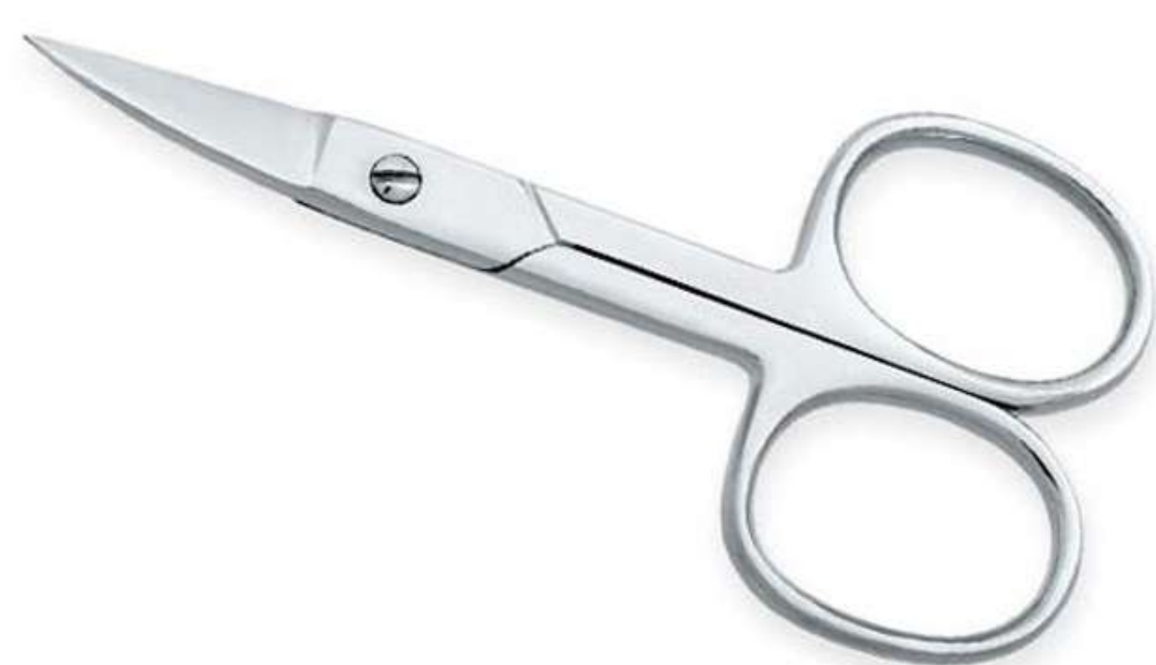
Art no: AS-3-1816

&nbsp;Nail Scissors Tower point is designed to cut your normal hairs with perfection as well as to cut your ingrown nails with it sharply grinded tip. Available Options Size 3.5"