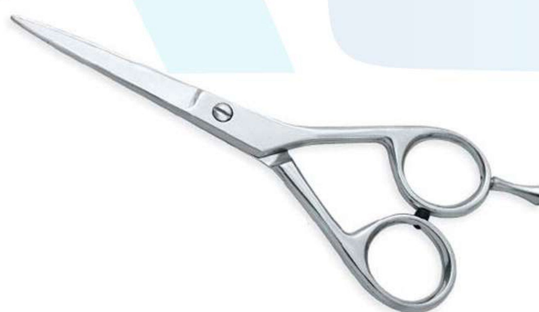
Art no: AS-3-1211

• Made from selected steel and crafted to perfection for smooth operation and sharpness with one blade micro serrated, with removable finger rest, This is ideal model for people looking for Economic Scissors with modern designs.