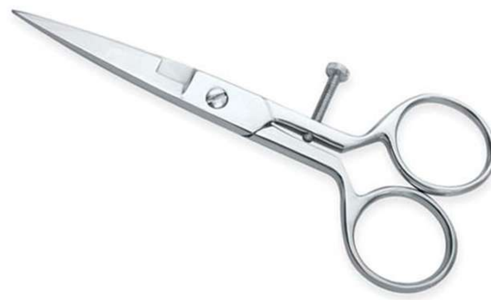
Art no: AS-3-1608

&nbsp;Beautiful design and excellent working ability is one of the features of our range of Fancy Scissors which are made out of Special Steel for long lasting cutting ability.