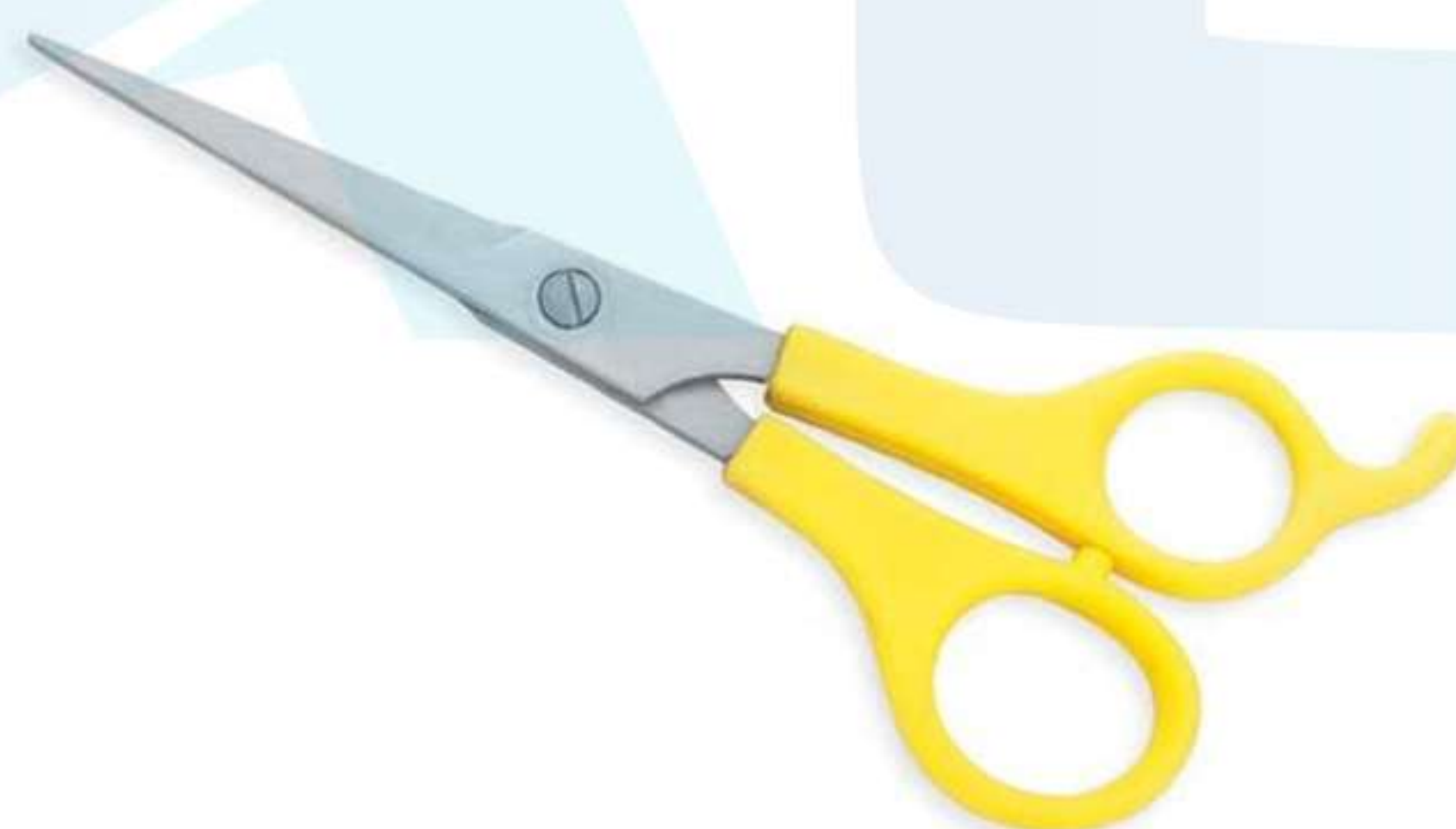
Art no: AS-3-1217

&nbsp;Barber Scissors with Plastic handle one blade micro serrated. Available Options Size 5" 6"