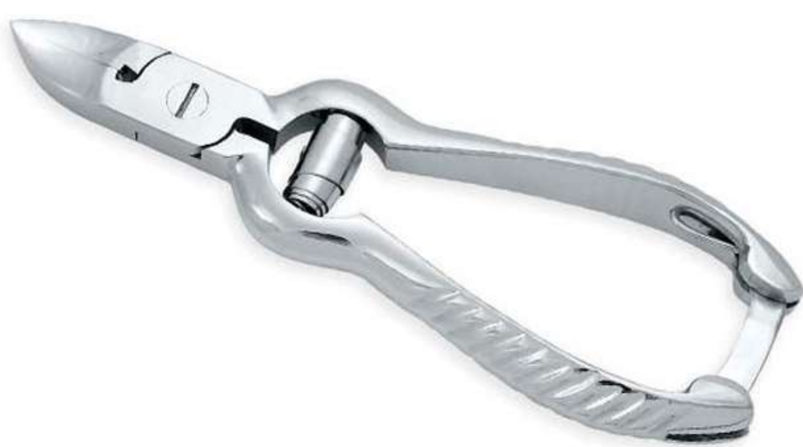
Art no: AS-3-2104

Forged from Surgical Grade Stainless Steel with Lap Joint, Single Wire Spring and finished to perfection. Available Options Size 4" 4.5" 4.75"