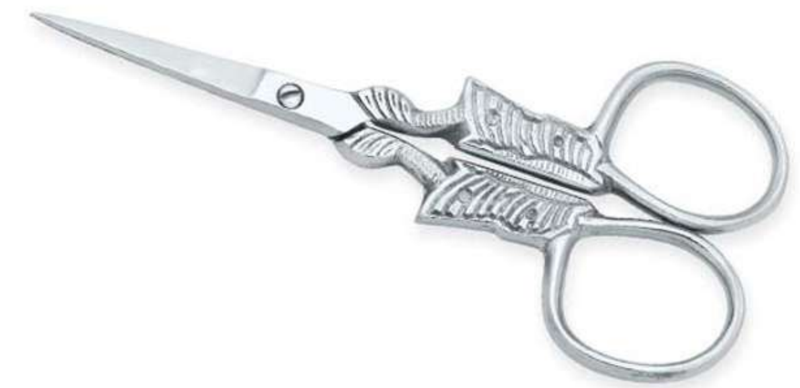
Art no: AS-3-1621

Beautiful design and excellent working ability is one of the features of our range of Fancy Scissors which are made out of Special Steel for long lasting cutting ability.