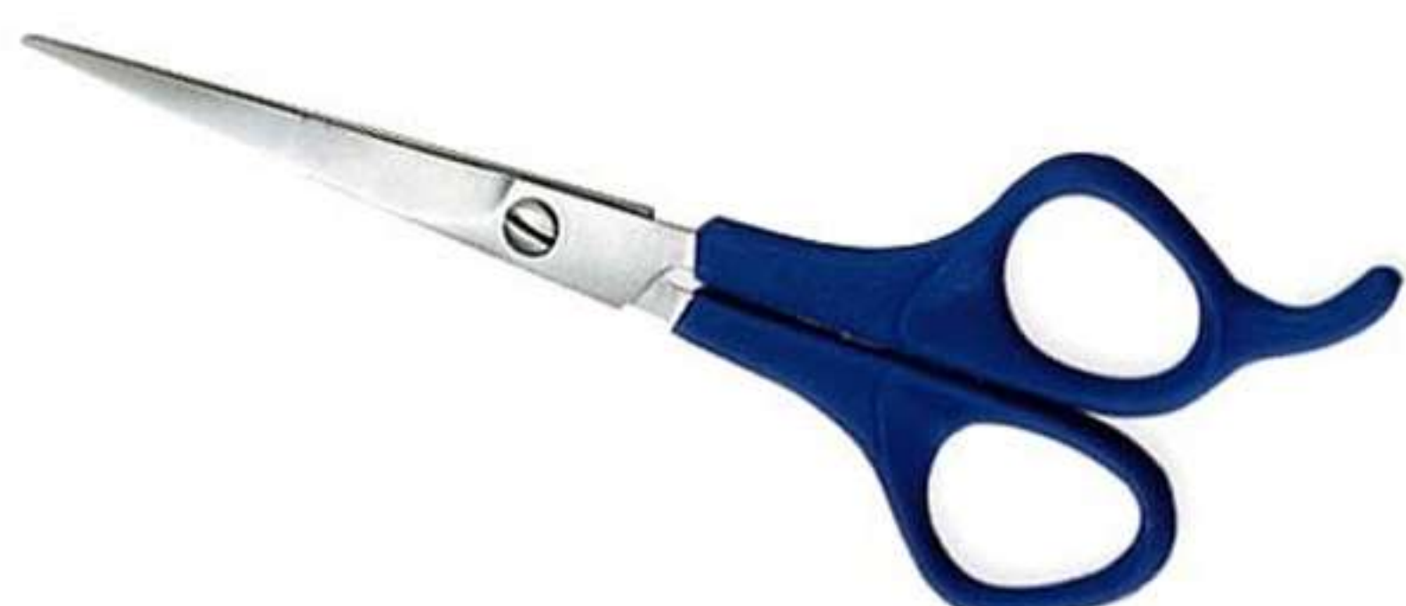
Art no: AS-3-1401

&nbsp;This Classic model of Barber Scissors passed the test of time and is still one of the best selling Scissors. Made out of Japanese Steel sheet this scissors gives perfect cut. Available Options Size 5" 6"