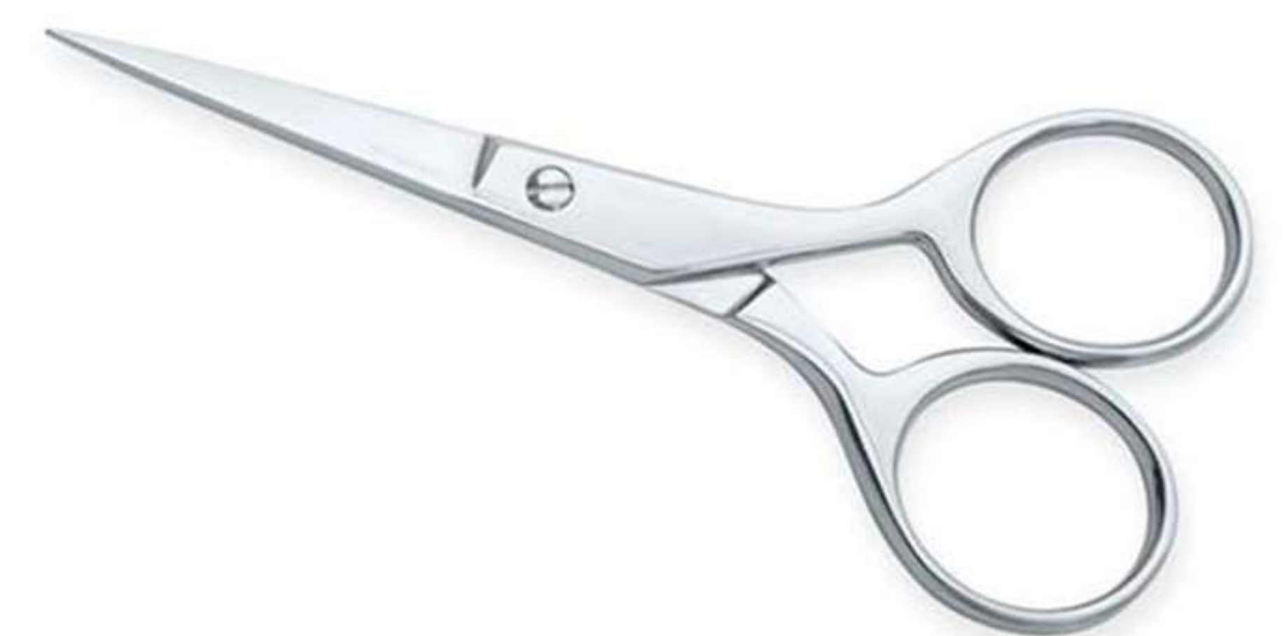
Art no: AS-3-1606

Pocket Scissors are designed with round points in a way that these can be carried without any problem. These Scissors are also used in School for the kids.