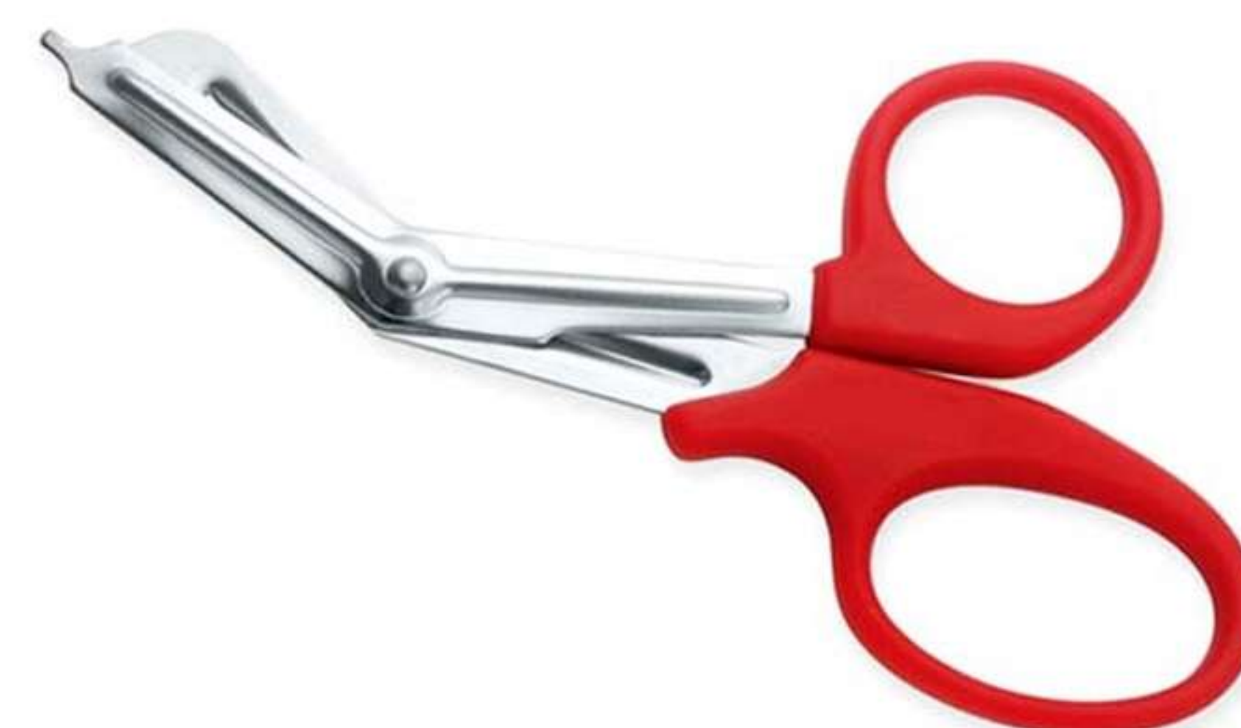
Art no: AS-3-1803

Blades of this utility Scissors are made out of high Carbon Japanese Stainless Steel Sheet and handles with Plastic, One blade micro serrated makes these Scissors perfect to cut anything from paper to heavy cloth or bandage in case of any emergency. Available Options Size 6"