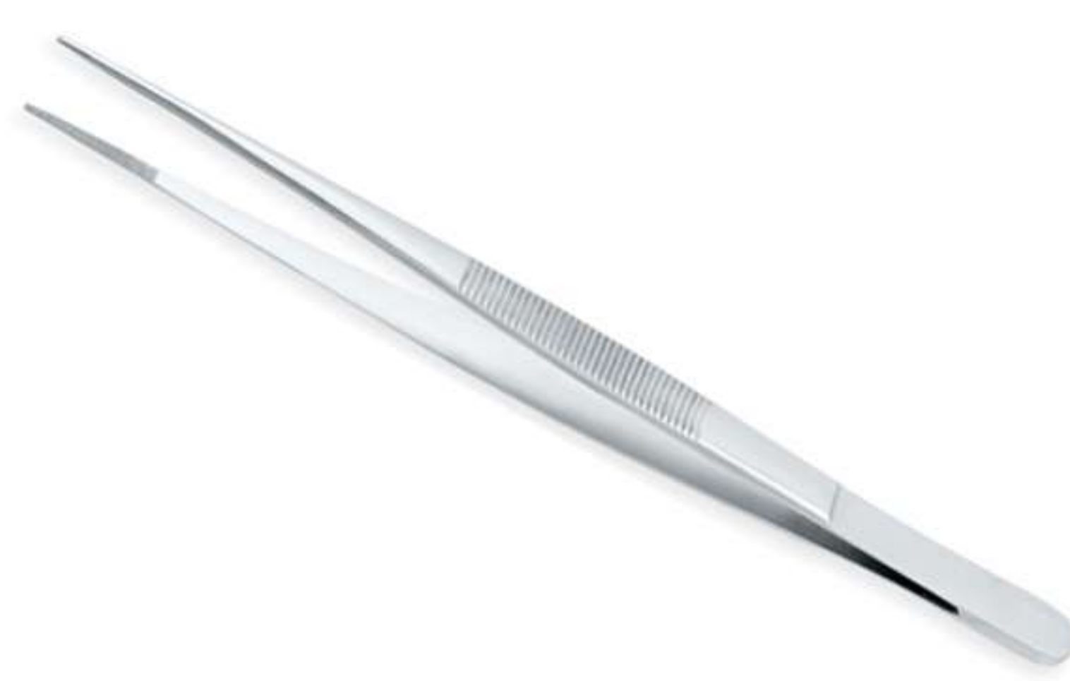
Art no: AS-3-2002

This classic model with serrated Sharp tips is used for various purposes from surgical to assembly line and it's available in magnetic and non magnetic steel type.