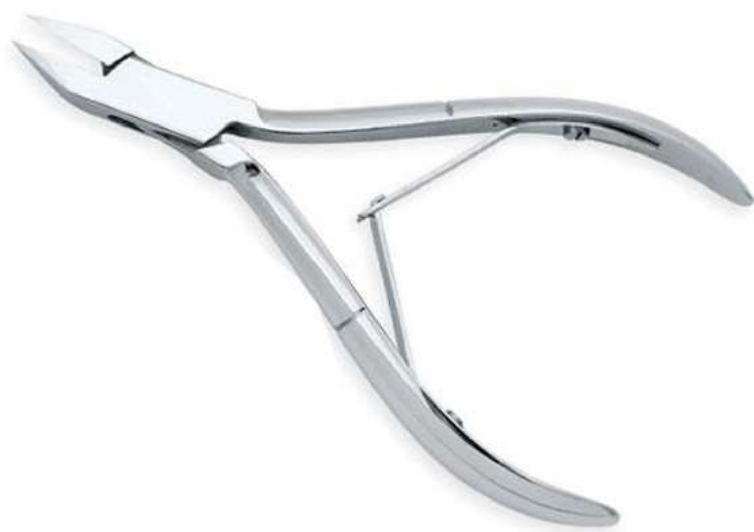
Art no: AS-3-2110

Forged from Surgical Grade Stainless Steel with Box Joint, Double Sheet Springs and very sharp pointed cutting blades for ingrown nails.