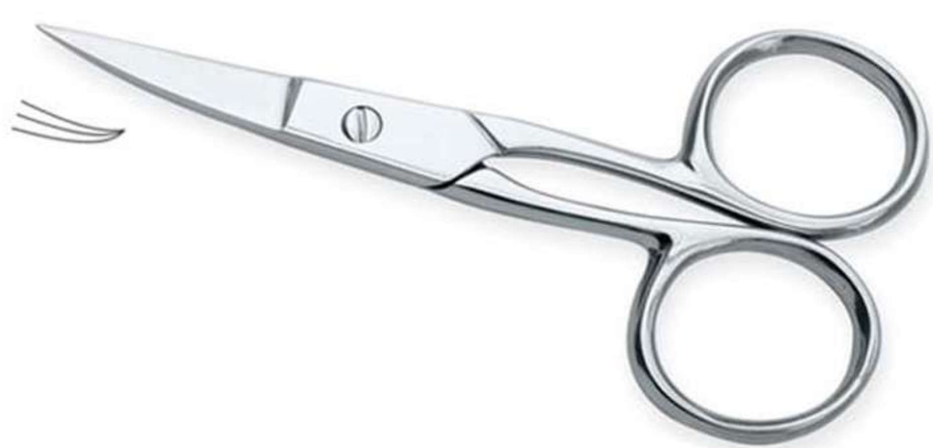
Art no: AS-3-1801

Heavy Duty Nail Scissors are designed for the perfect cut even for the thick and strong nails and this model is also very well received in Embroidery line. Made from Special Stainless steel gives it long lasting cutting ability.