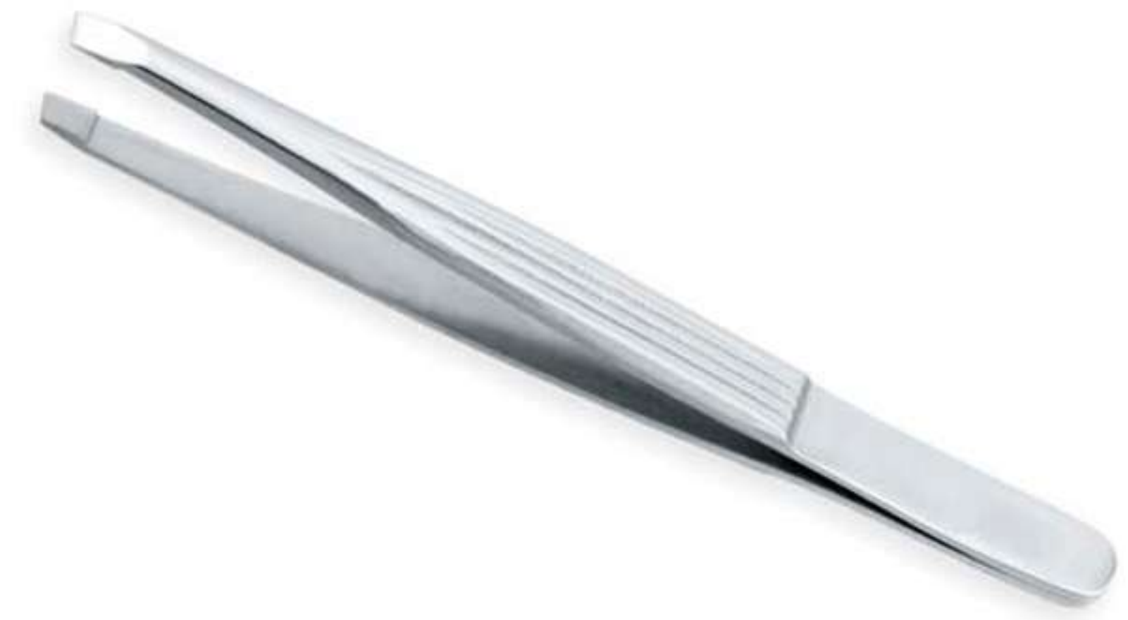
Art no: AS-3-1909

&nbsp;Eye Brow Tweezers Available Options Size 4"