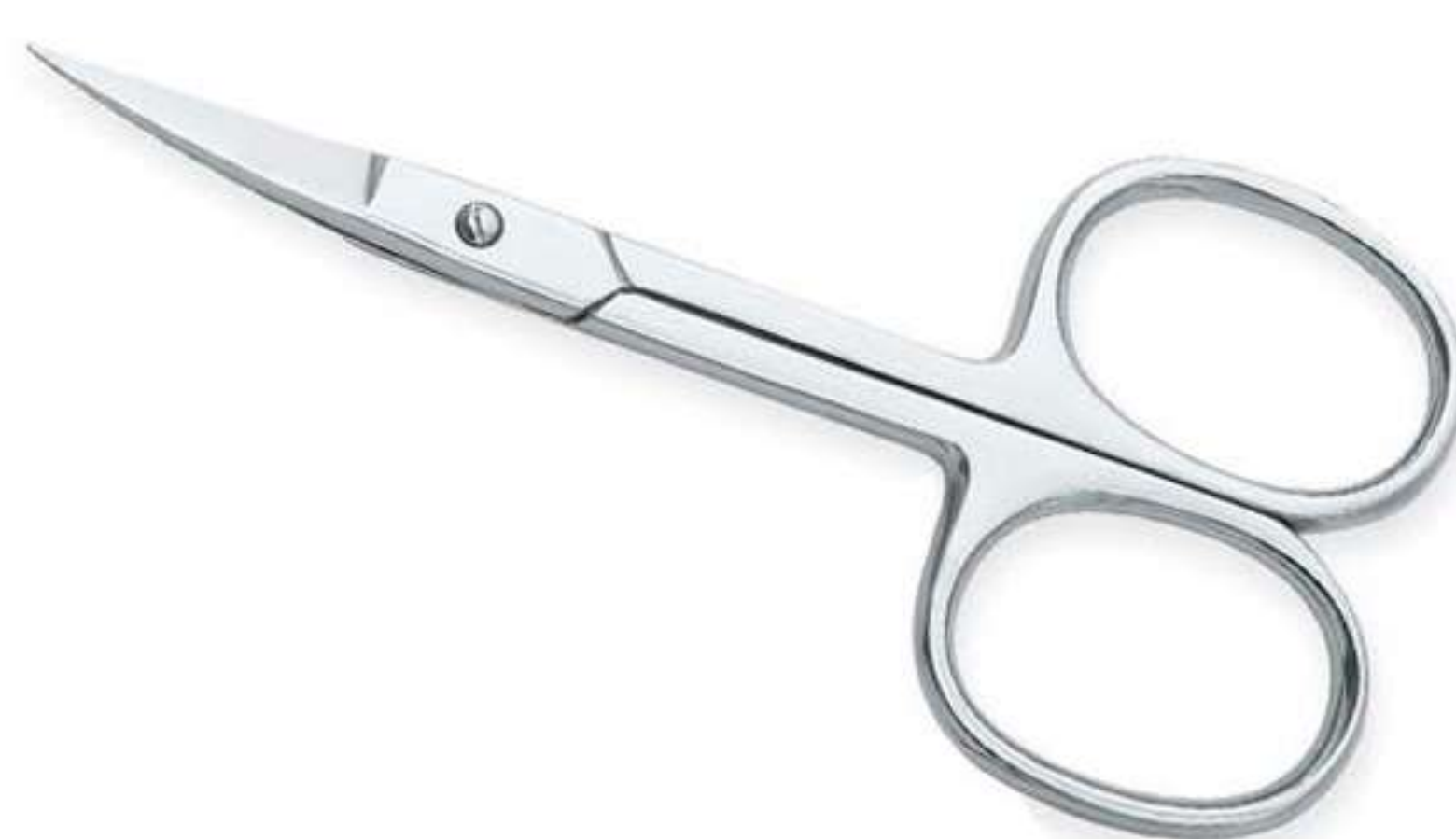
Art no: AS-3-1811

&nbsp;This model of Cuticle Scissors is Classic model with bigger finger holes and very sharp tip which allows a perfect cut for the cuticles. Available Options Size 3.5"