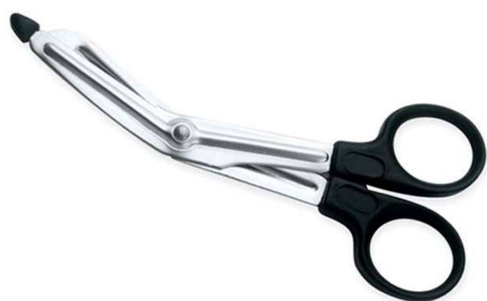
Art no: AS-3-1801

Blades of this utility Scissors are made out of high Carbon Japanese Stainless Steel Sheet and handles with Plastic, One blade micro serrated makes these Scissors perfect to cut anything from paper to heavy cloth or bandage in case of any emergency. Available Options Size 6"