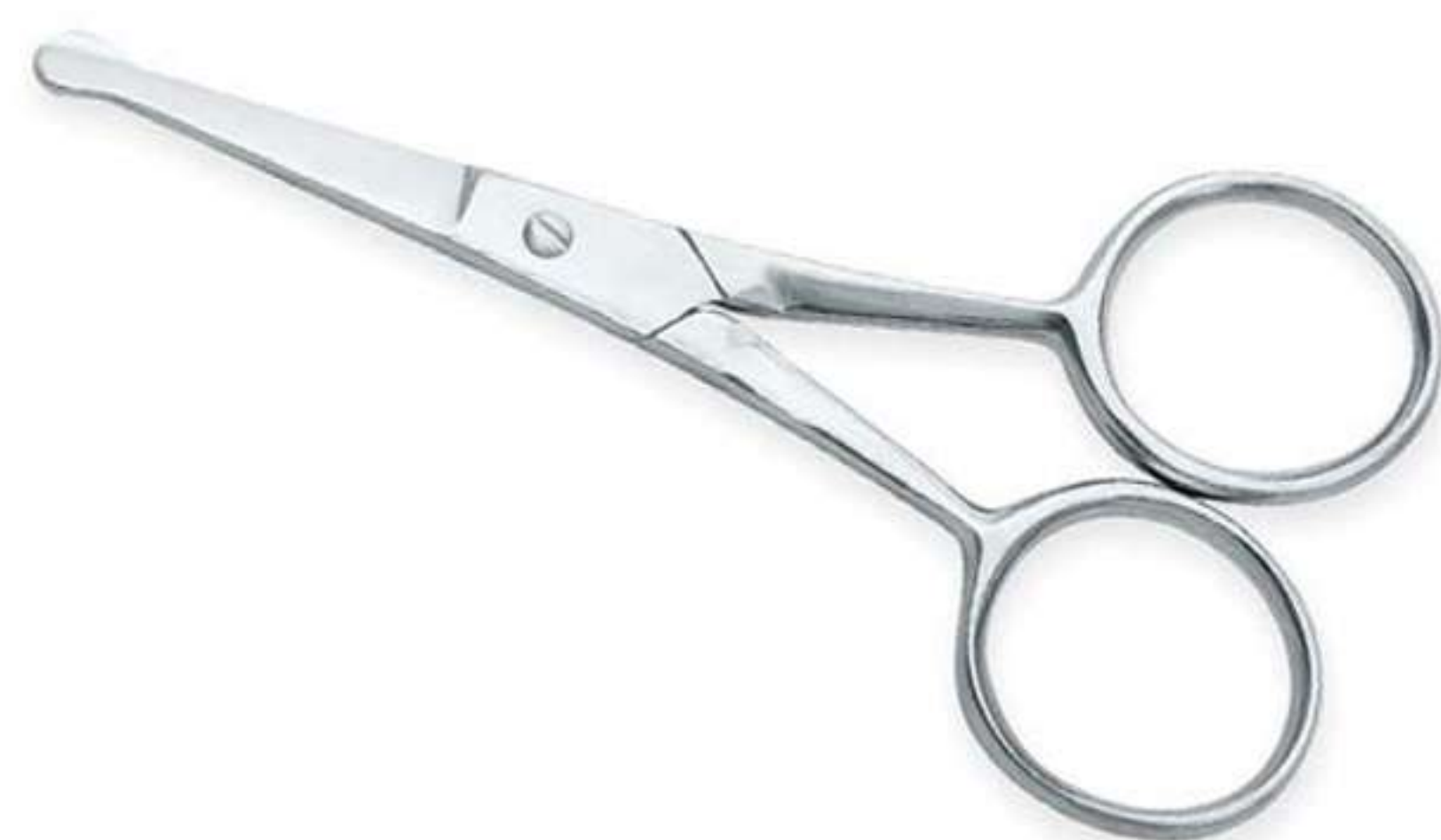
Art no: AS-3-1805

&nbsp;Baby Scissors Curved is designed with rounded tips to babies are not hurt when they move their hands while working on their nails.