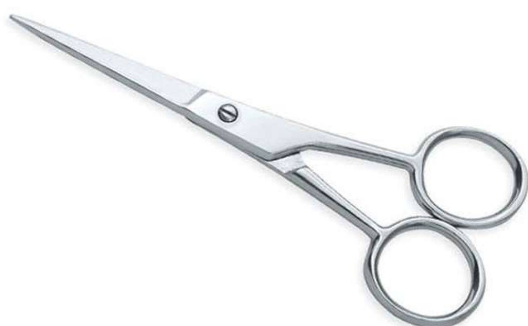
Art no: AS-3-1301

Made from Selected steel and machined to perfection for smooth thinning operation with 22 teeth single blade thinning Scissors: Available Options Size 6"