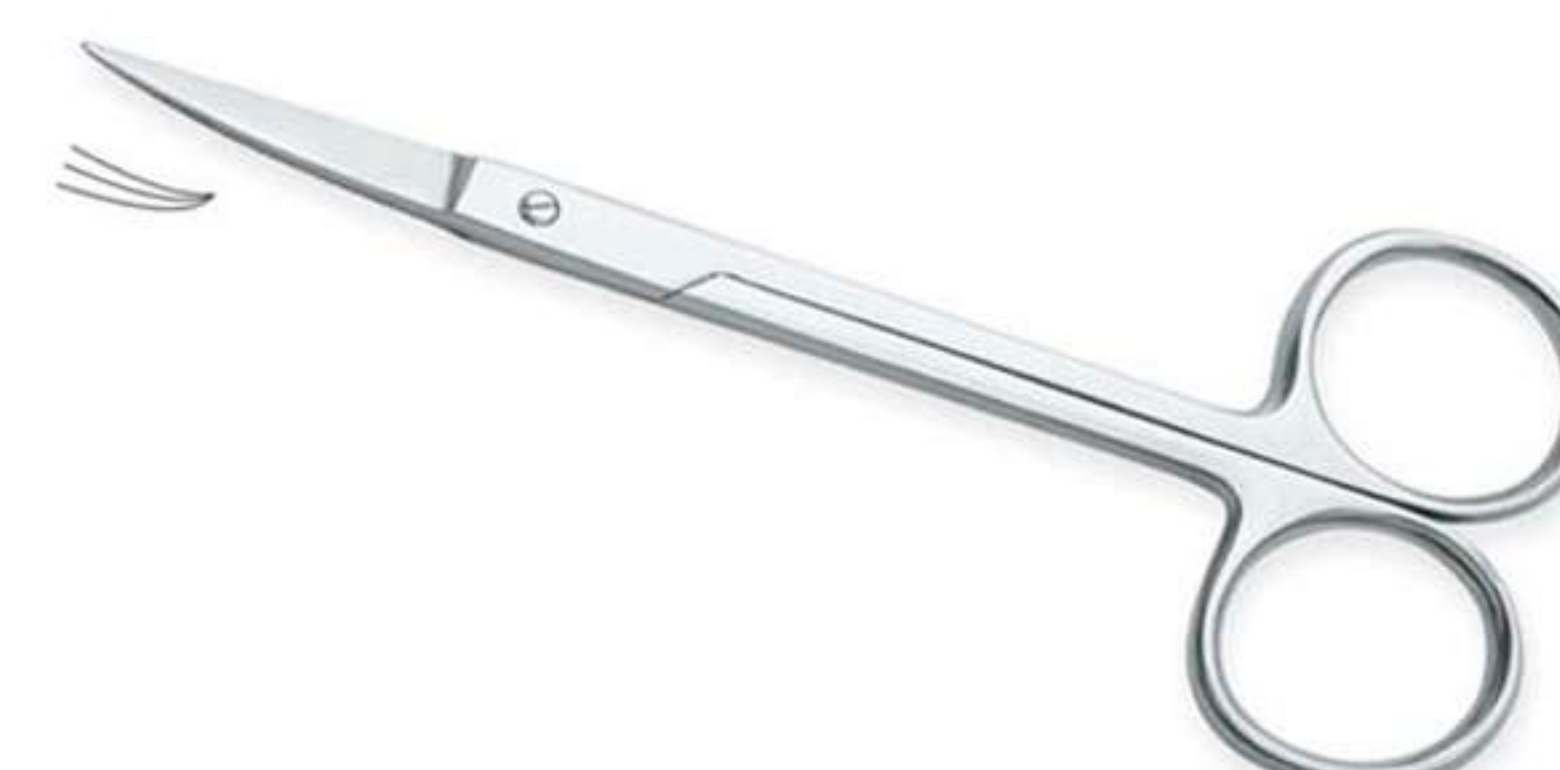
Art no: AS-3-1806

Available in assorted sizes this model of Fine Scissors can be used in different areas like it can be used as Cuticle Scissors, Nail Scissors, and Embroidery Scissors as well as for any other industrial or home use. Available Options Size 3.5" 4" 4.5"