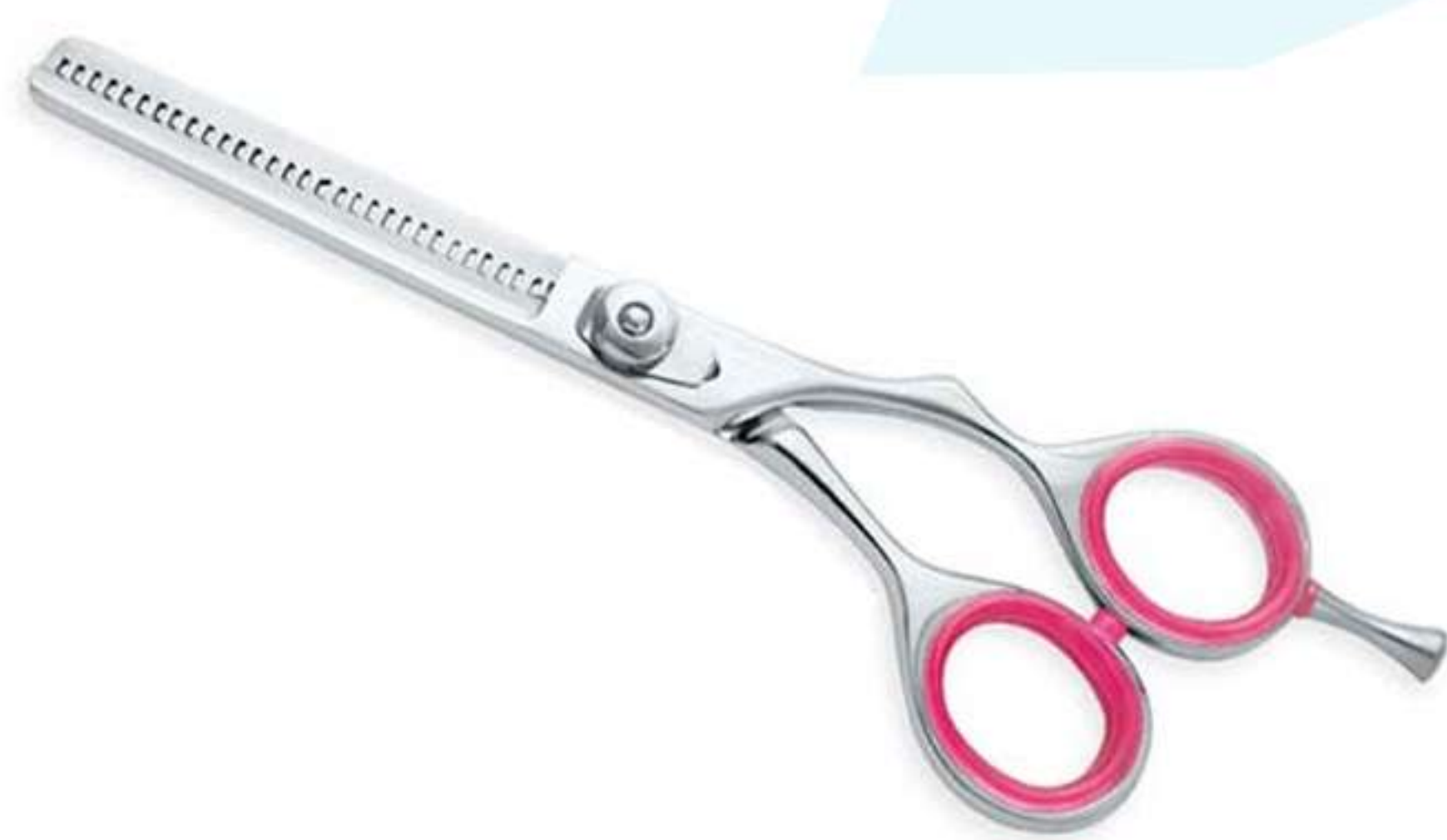
Art no: AS-3-1104

Available in Stainless steel AISI 420 or 440 with hollow ground inner blades and Convex edge, 28 teeth thinning scissors which classic ergonomic handles.