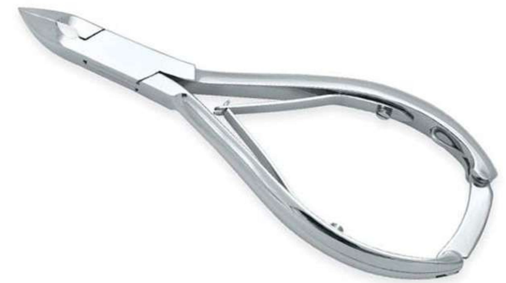
Art no: AS-3-2109

Forged from Surgical Grade Stainless Steel with Box Joint, Double Sheet Springs and lock back handles, ideal for professional work.