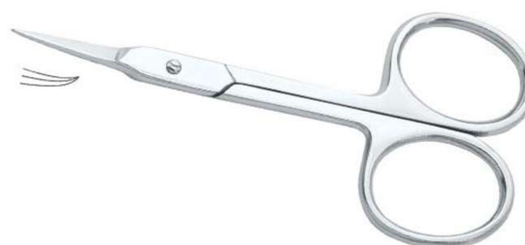
Art no: AS-3-1821

&nbsp; <div>&nbsp;</div> <div> Nose Scissors with probe at the top of the tip helps for the smooth cutting of nose hairs without any injury. Special stainless steel and excellent craftsmanship keep these scissors Sharpe for longer periods</div> Available Options Size 3.5" 4"