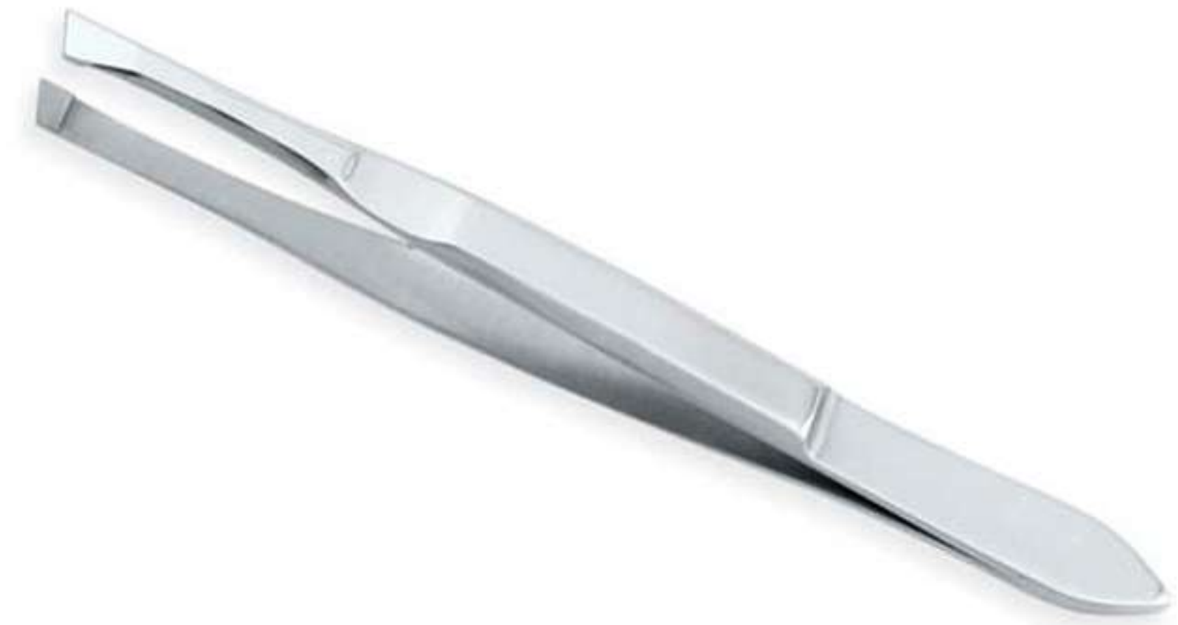
Art no: AS-3-1914

&nbsp;with Rubber grip Available Options Size 4"