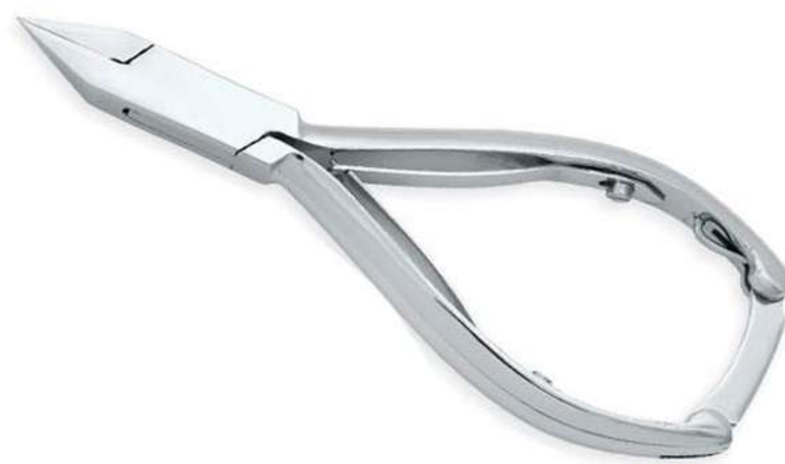
Art no: AS-3-2111

Available Options Size 4.5" 5" 5.5" 6.25"