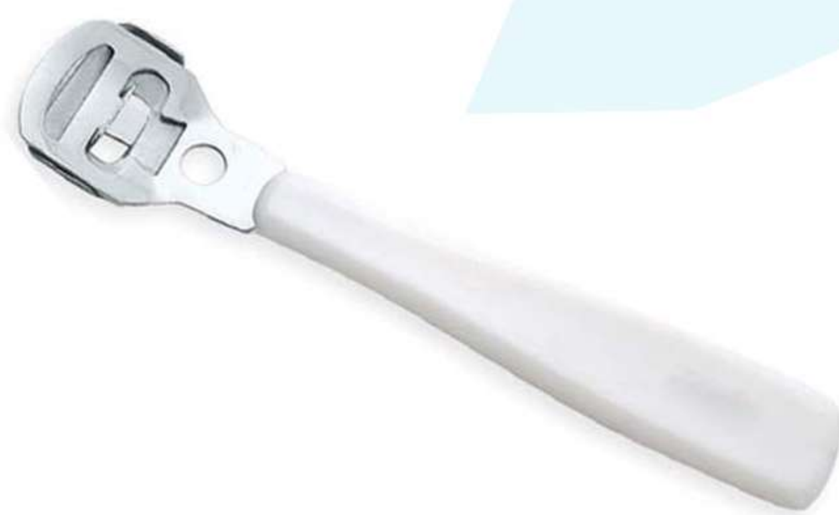
Art no: AS-3-1504

Double action foot rasp for removing the dead skin from heels, Also made of Surgical grade steel so its safe to sterilize in hot water after every use.