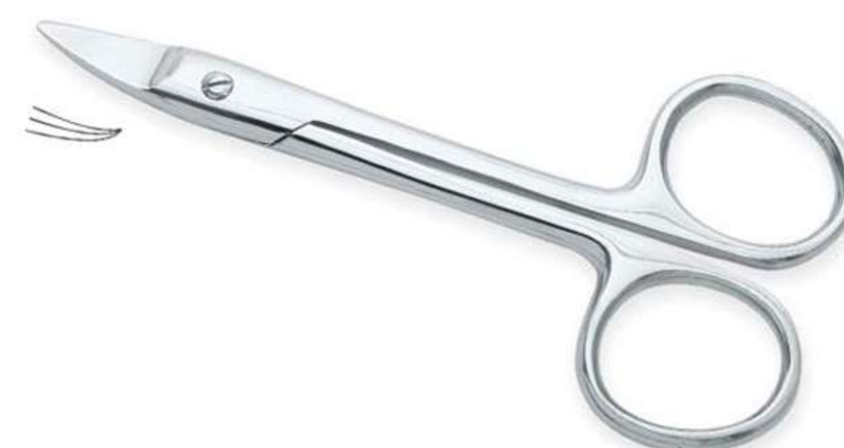
Art no: AS-3-1806

Crown Scissors Straight made out of heavy Sheet of Special alloys Steel gives it the strength needed to cut hard foot nails with great perfection and control.