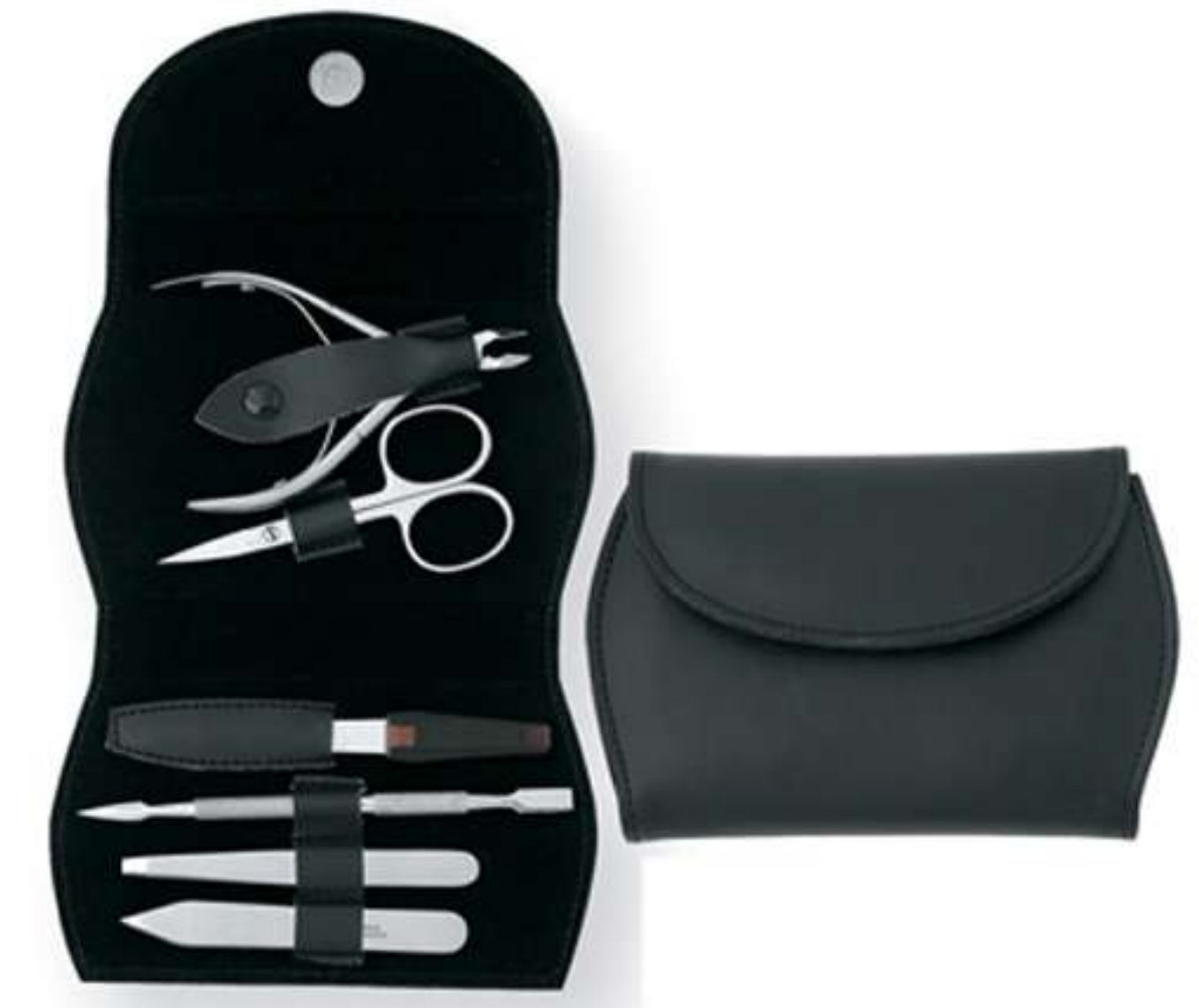
Art no: AS-3-2215

Manicure Set Contains:<br /> Nail Nippers<br /> Cuticle Nippers # 911<br /> Nail Scissors # 852<br />