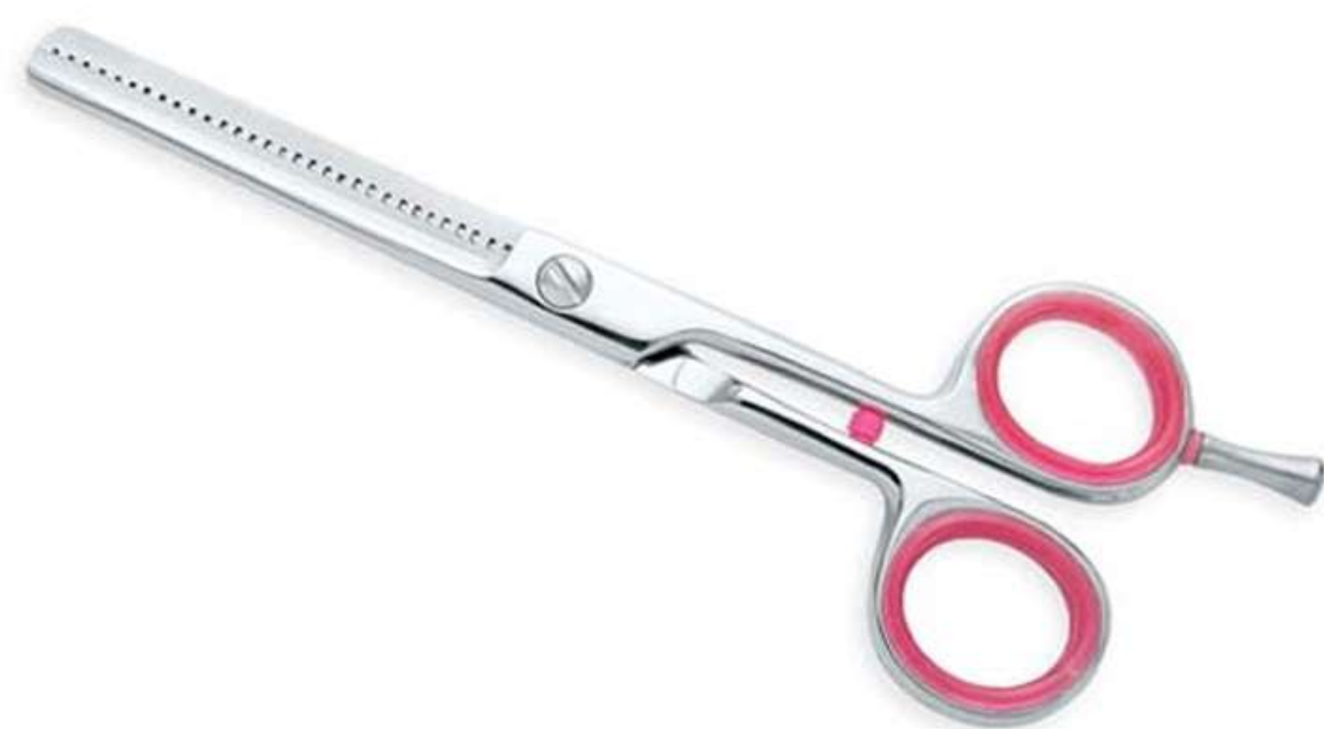
Art no: AS-3-1101

Available in Stainless steel AISI 420 or 440 with hollow ground inner blades and Convex edge, Single blade thinning Scissors with 42 teeth for a smooth thinning operation.