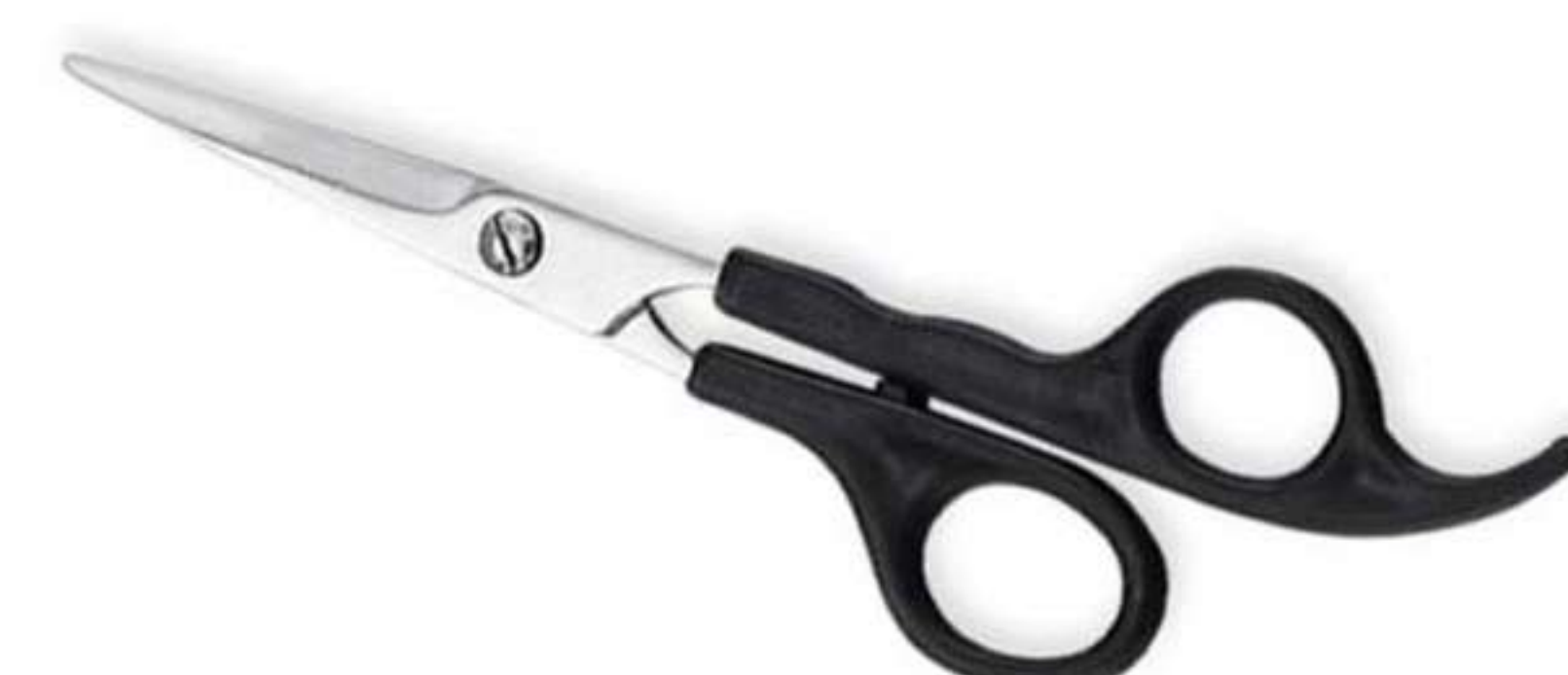
Art no: AS-3-1403

&nbsp;This Classic model of Barber Scissors passed the test of time and is still one of the best selling Scissors. Made out of Japanese Steel sheet this scissors gives perfect cut. Available Options Size 5.5" 6" 6.5" 7" 7.5"