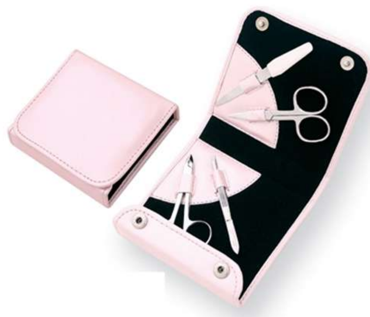
Art no: AS-3-2201

This is pocket manicure sets with leather pouch available in many colors.<br />