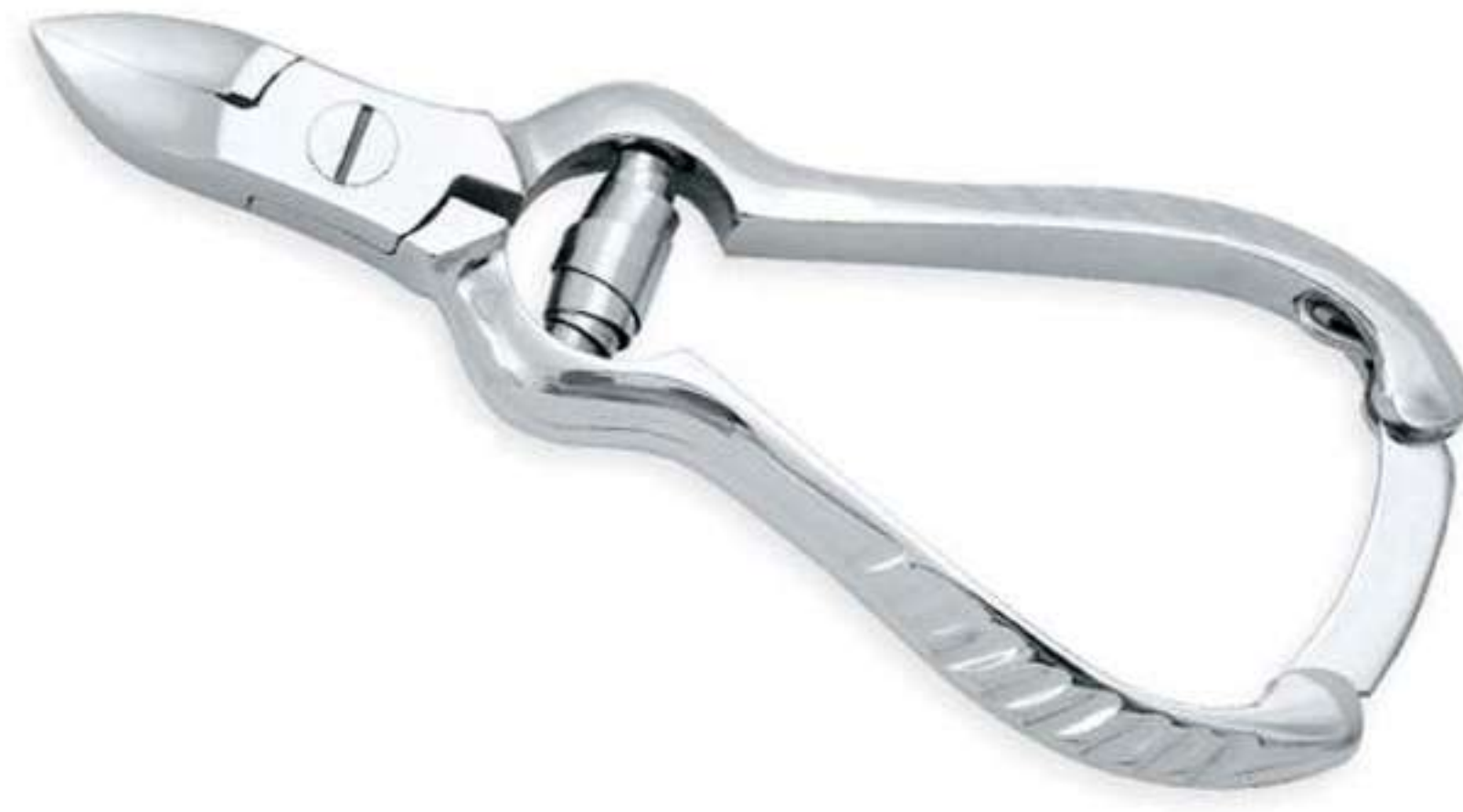
Art no: MS-3-2126

Forged from Surgical Grade Stainless Steel with Lap Joint, Barrel Sheet Spring and finished to perfection