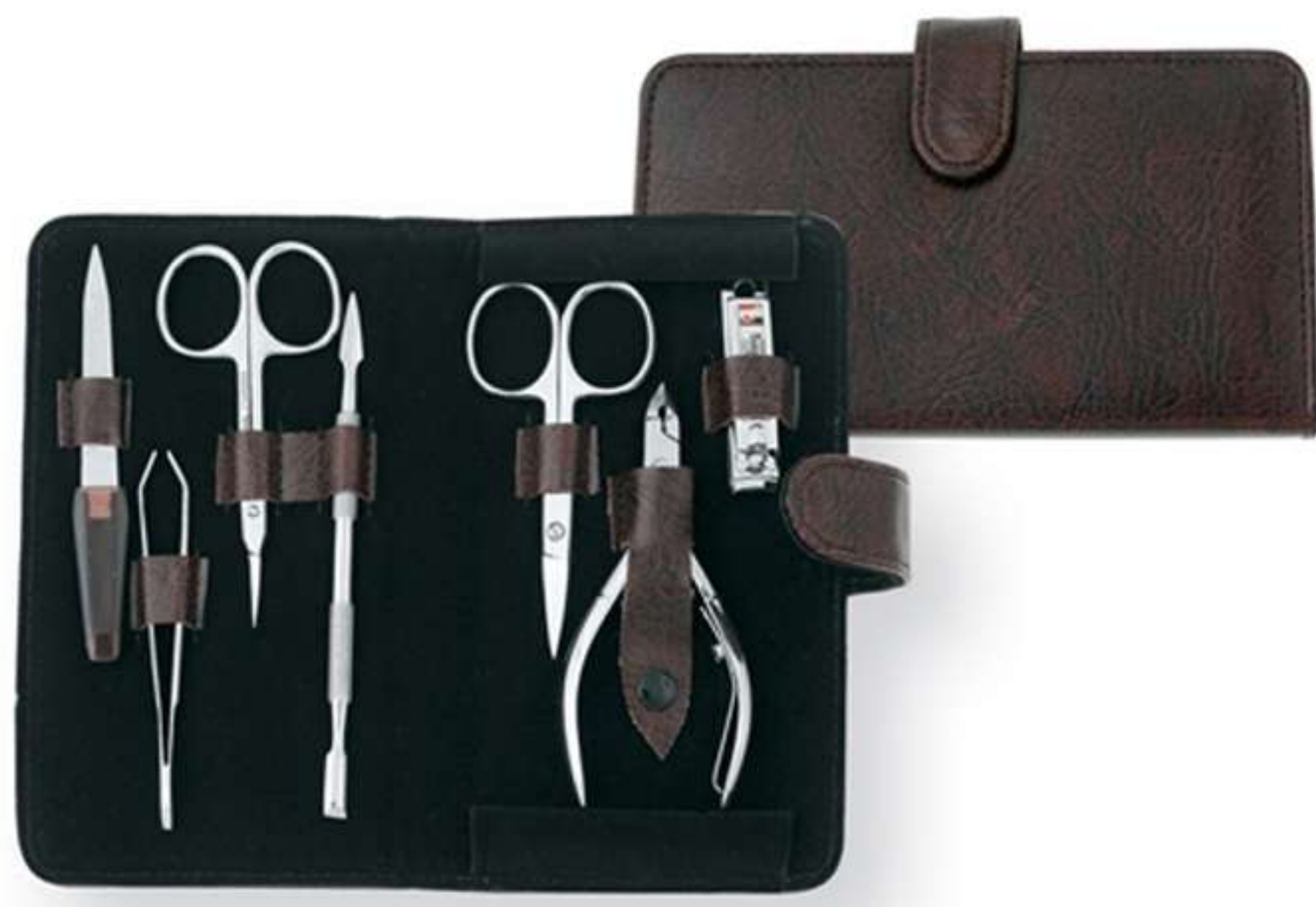
Art no: AS-3-2213

Manicure Set Contains:<br /> Nail Nippers<br /> Cuticle Nippers # 911<br /> Nail Scissors # 858<br /> Cuticle Pusher # 144<br />