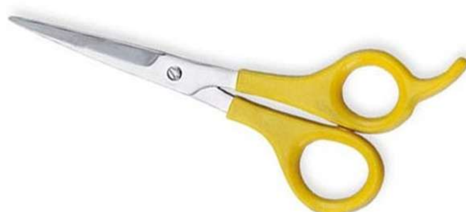
Art no: AS-3-1402

&nbsp;This Classic model of Barber Scissors passed the test of time and is still one of the best selling Scissors. Made out of Japanese Steel sheet this scissors gives perfect cut. Available Options Size 5" 6"