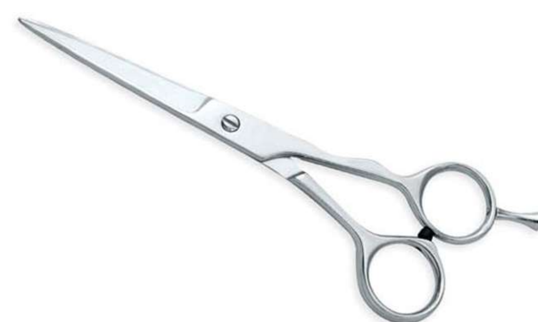
Art no: AS-3-1209

• Made from selected steel and crafted to perfection for smooth operation and sharpness with one blade micro serrated, with removable finger rest, This is ideal model for people looking for Classic models in Economy Scissors.