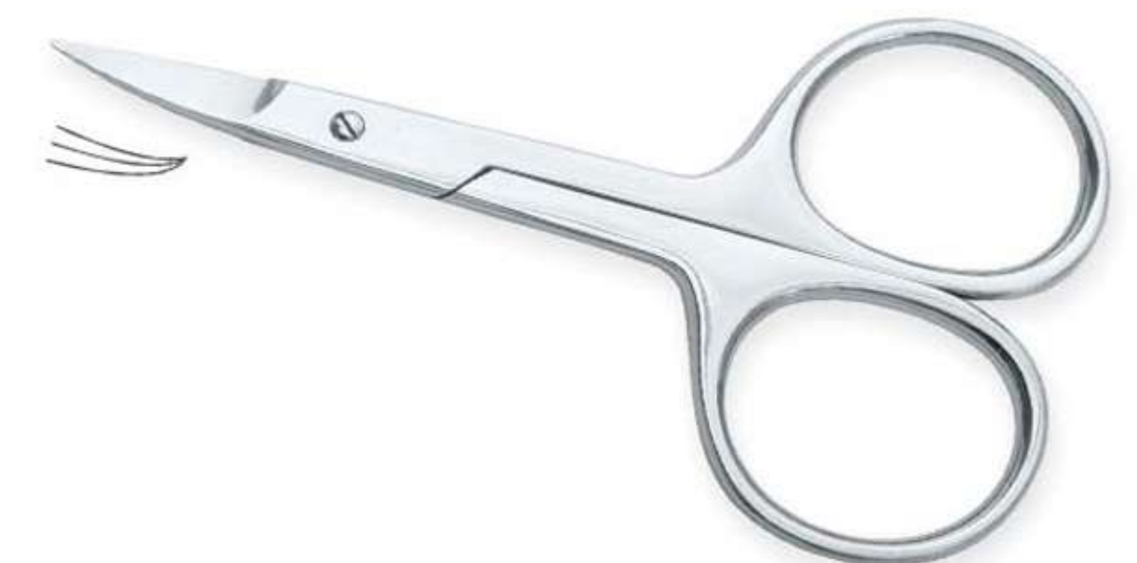
Art no: AS-3-1618

This model of Cuticle scissors is a breakaway from the traditional models as its modern trendy and nicely balanced to perform excellent operation for all sort of nails.