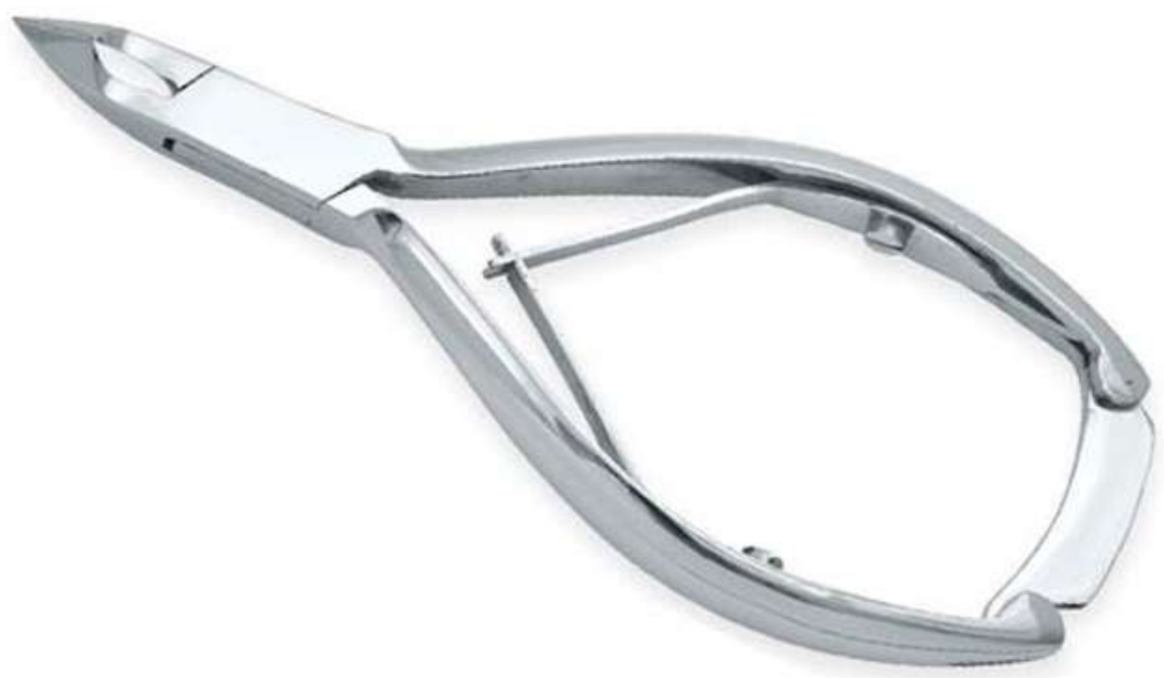
Art no: AS-3-2113

Forged from Surgical Grade Stainless Steel with Box Joint, Double Sheet Springs for smooth operation.<br />