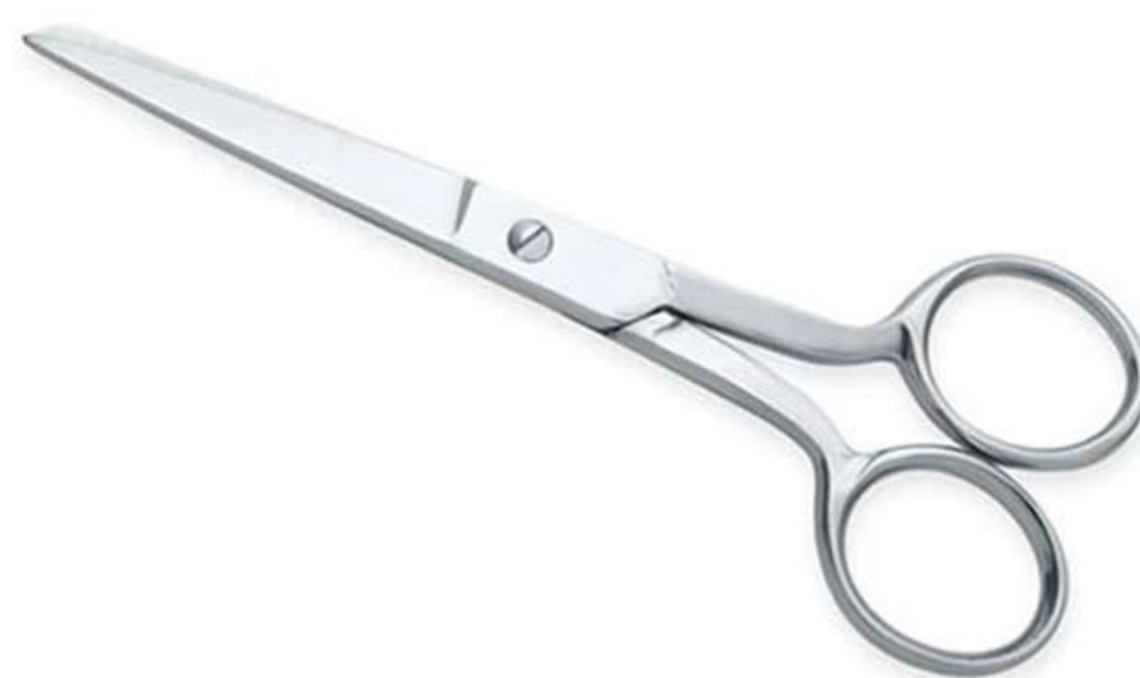
Art no: AS-3-1705

Household Scissors is available in assorted sizes for the varied operations for the household as well as for the industrial purposes. Excellent craftsmanship makes these scissors a special one to be used for comfort and ease.