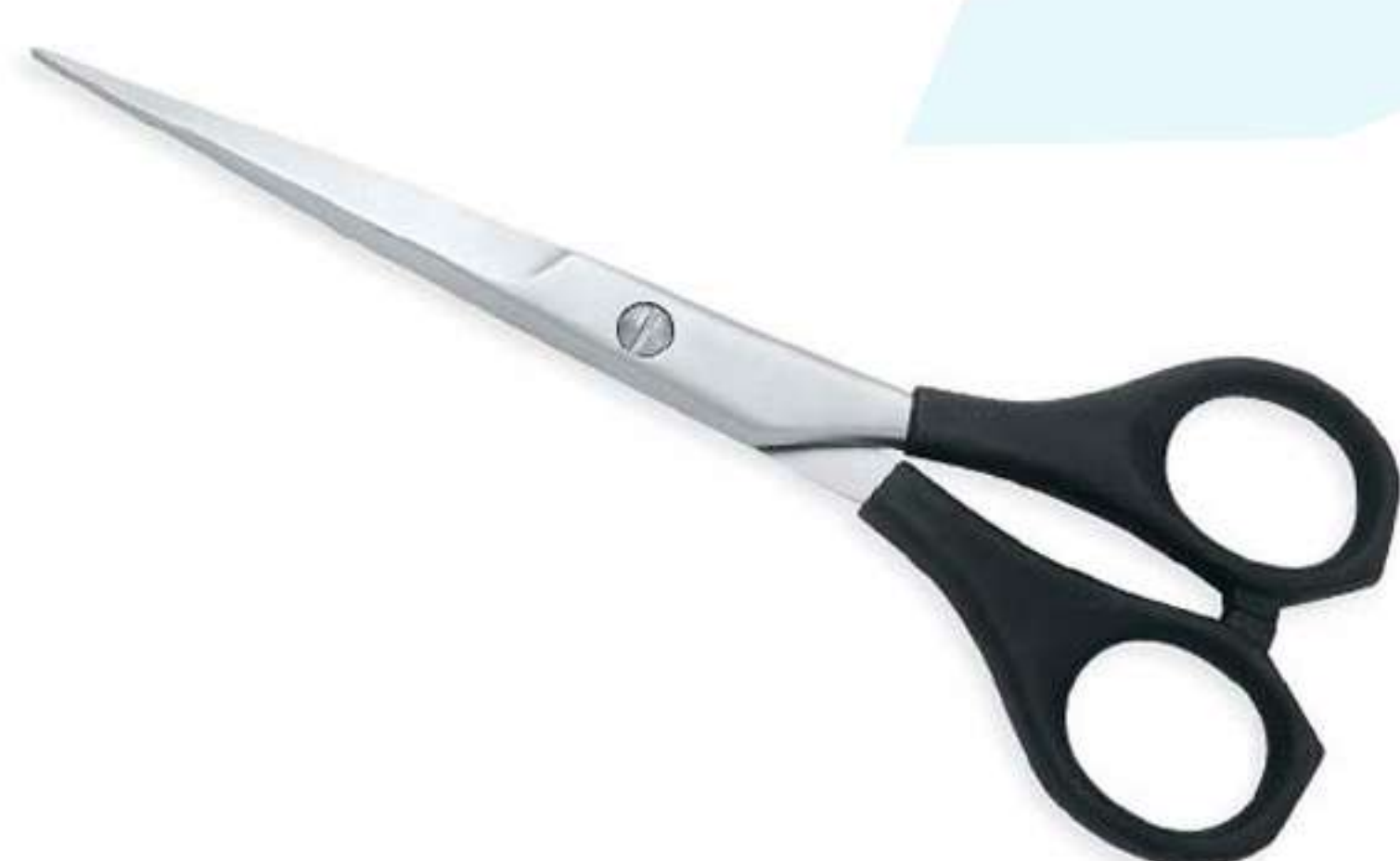
Art no: AS-3-1404

&nbsp;This Classic model of Barber Scissors passed the test of time and is still one of the best selling Scissors . Made out of Japanese Steel sheet this scissors gives perfect cut. Available Options Size 6"