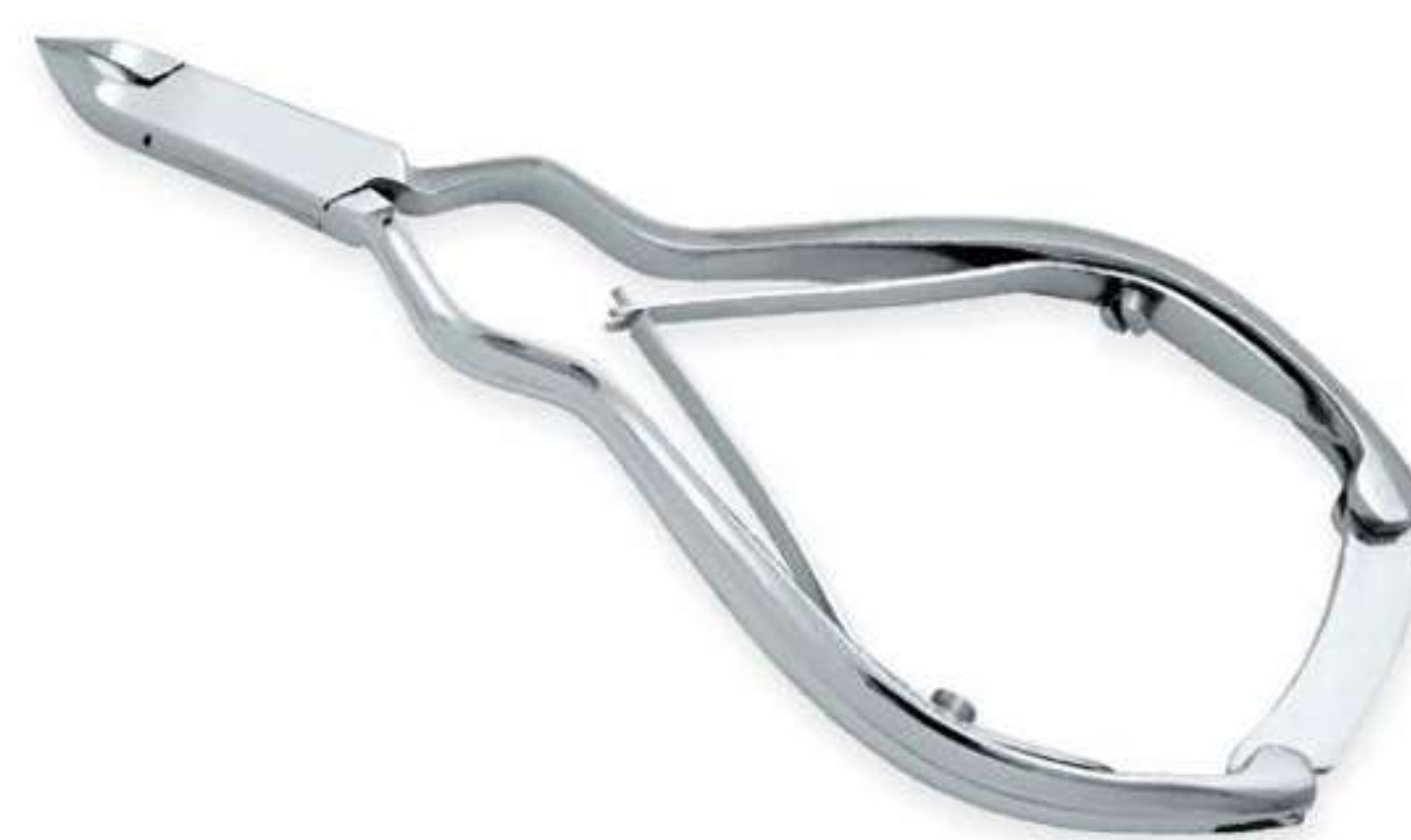
Art no: AS-3-2117

Forged from Surgical Grade Stainless Steel with Lap Joint, Barrel Sheet Spring.<br />