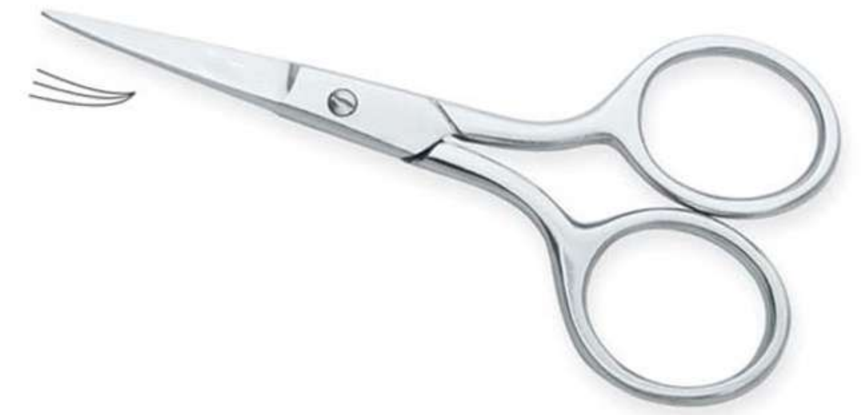
Art no: AS-3-1603

Classic model of Embroidery Scissors has passed the test of time and still is one of the best selling model for the range of Embroidery Scissors. This Classic model is made from Special Steel alloy which allows excellent smoothness and long lasting sharpness.