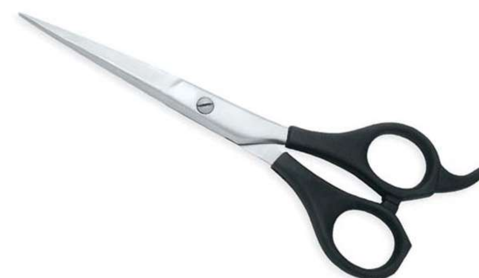
Art no: AS-3-1215

&nbsp;Barber Scissors with Plastic handle one blade micro serrated.