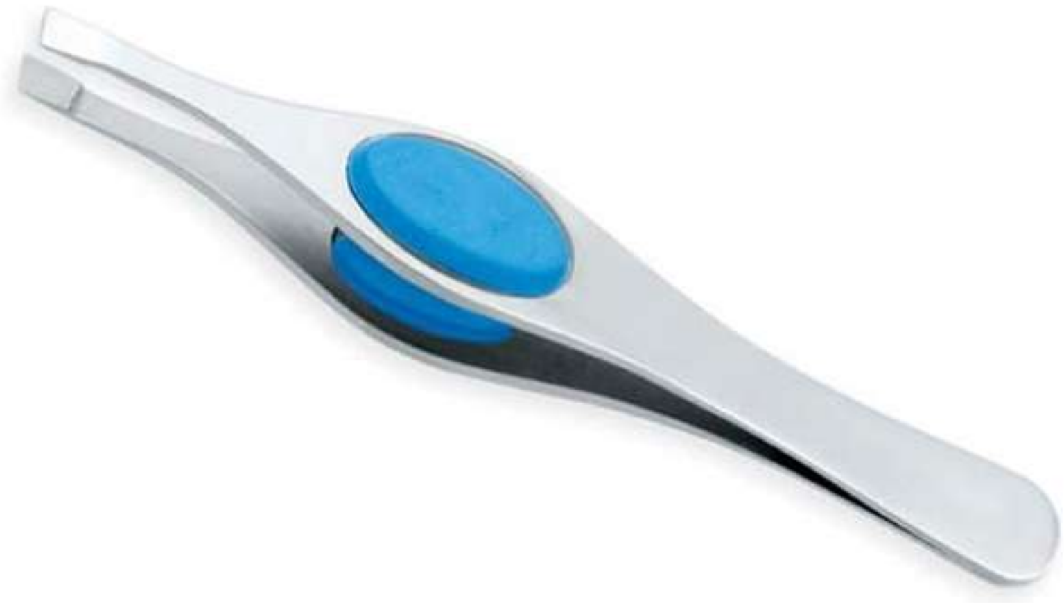
Art no: AS-3-1913

&nbsp;with Rubber grip Available Options Size 4"