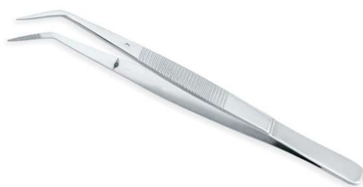
Art no: AS-3-2004

This classic model with serrated Bent tips is used for various purposes from surgical to assembly line and it's available in magnetic and non magnetic steel type.