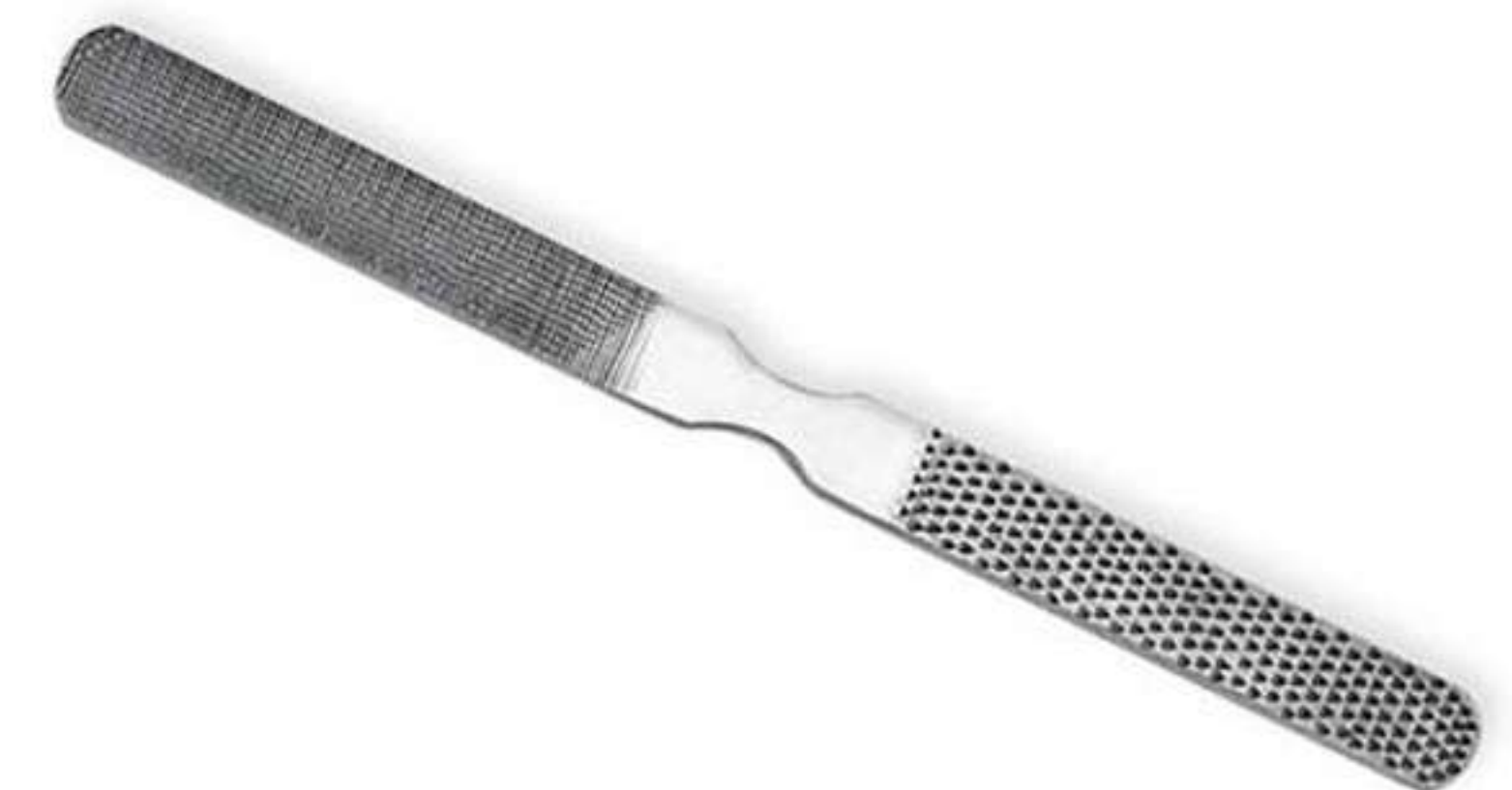
Art no: AS-3-1503

Single action foot rasp for removing the dead skin from heels, Also made of Surgical grade steel so its safe to sterilize in hot water after every use.