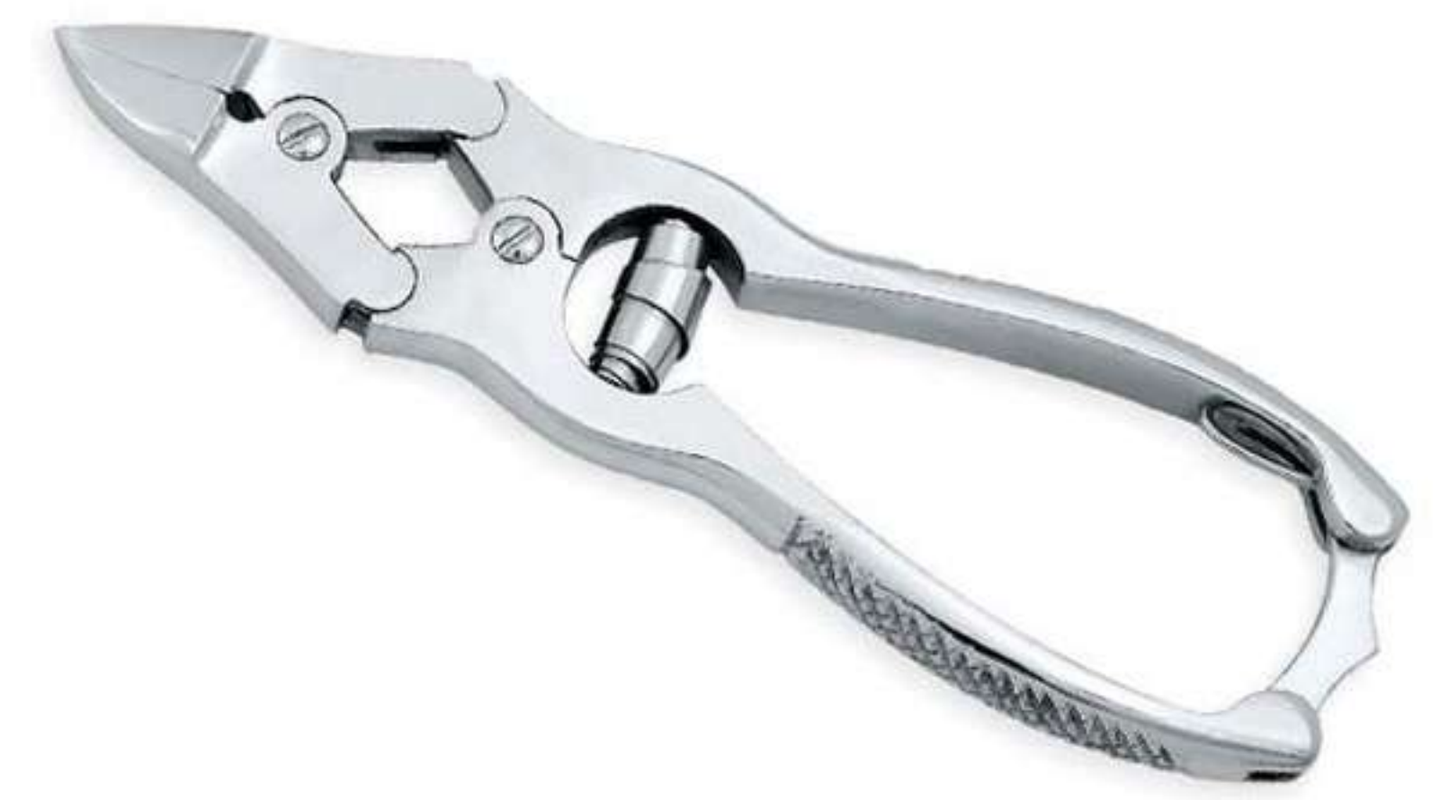
Art no: AS-3-2115

Forged from Surgical Grade Stainless Steel with Special multi Joints, and smooth cutting operation for professional work.<br />