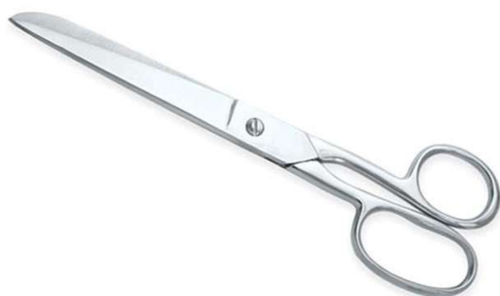
Art no: AS-3-1707

&nbsp;Sewing Scissors is available in assorted sizes for the varied operations for the household as well as for the industrial purposes. Excellent craftsmanship makes these scissors a special one to be used for comfort and ease..... Available Options Size 6" 7" 8"