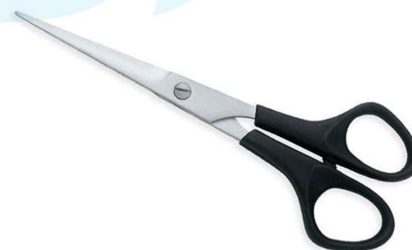
Art no: AS-3-1406

&nbsp;This model of our Barber Scissors with One Blade Micro serrated with Forged Blades instead of Sheet blades is really smooth and provides a good gripe for the barbers Available Options Size 6"