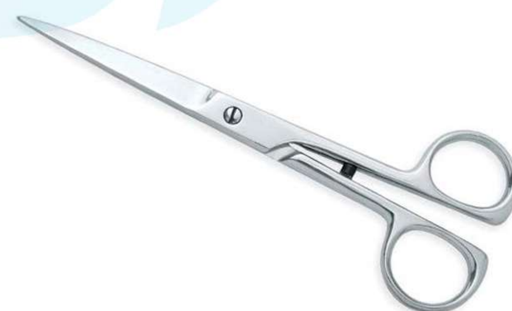
Art no: AS-3-1212

• Made from selected steel and crafted to perfection for smooth operation and sharpness with one blade micro serrated, No finger rest, This is ideal model for people looking for Economic Scissors with modern designs.