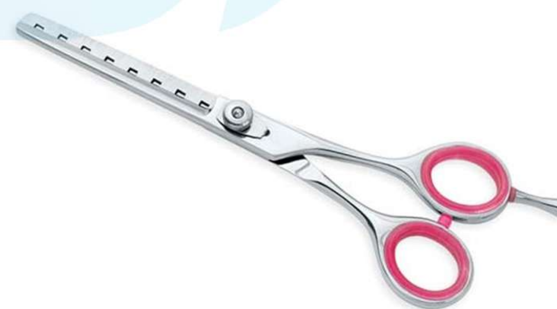
Art no: AS-3-1106

Available in Stainless steel AISI 420 or 440 with hollow ground inner blades and Convex edge, 16 teeth single blade Scissors for a smooth action.