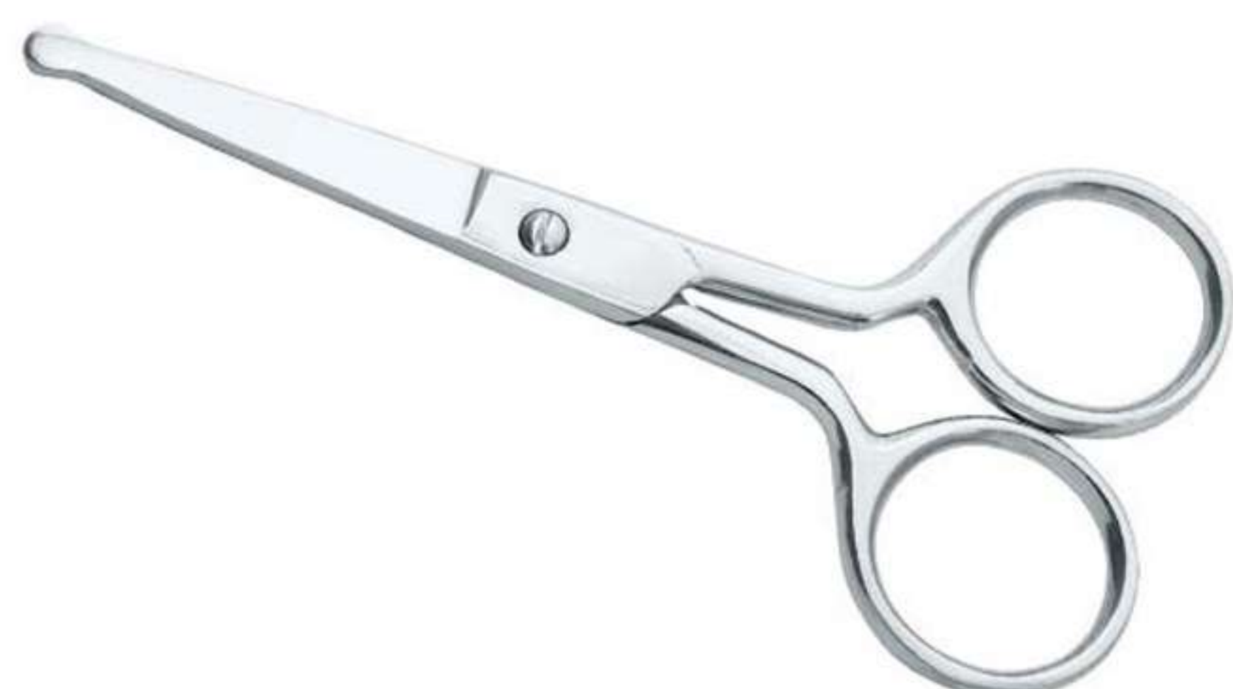
Art no: AS-3-1820

&nbsp; <div>&nbsp;</div> <div> Nose Scissors with probe at the top of the tip helps for the smooth cutting of nose hairs without any injury. Special stainless steel and excellent craftsmanship keep these scissors Sharpe for longer periods</div> Available Options Size 3.5" 4"