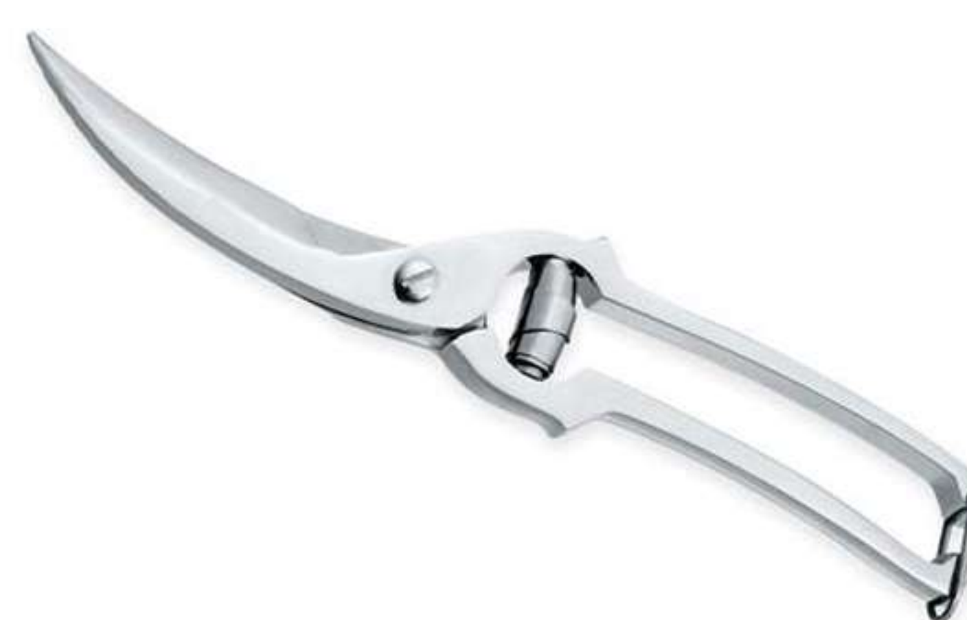
Art no: AS-3-1811

We are currently offering these Scissors only in the casted version and with one blade micro serrated these scissors can be used for poultry as well as for the leather cutting industry.