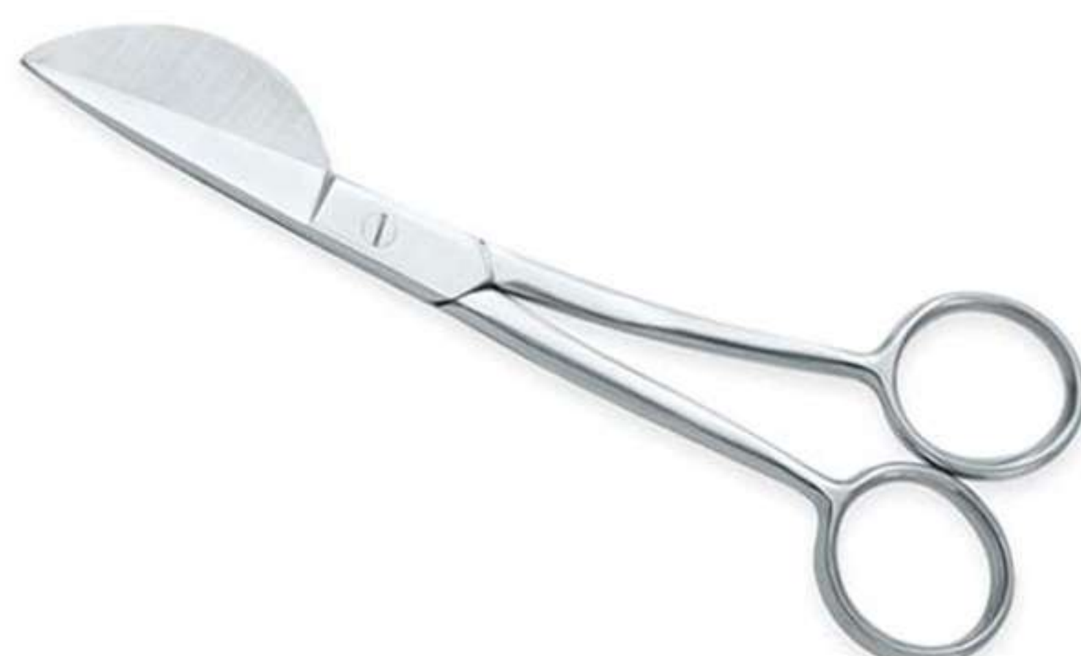
Art no: AS-3-1808

Its ergo design and made out of special steel with excellent craftsmanship this scissors is a must for any line of utility Scissors. This is lighter version and we also have a heavier version of the same.