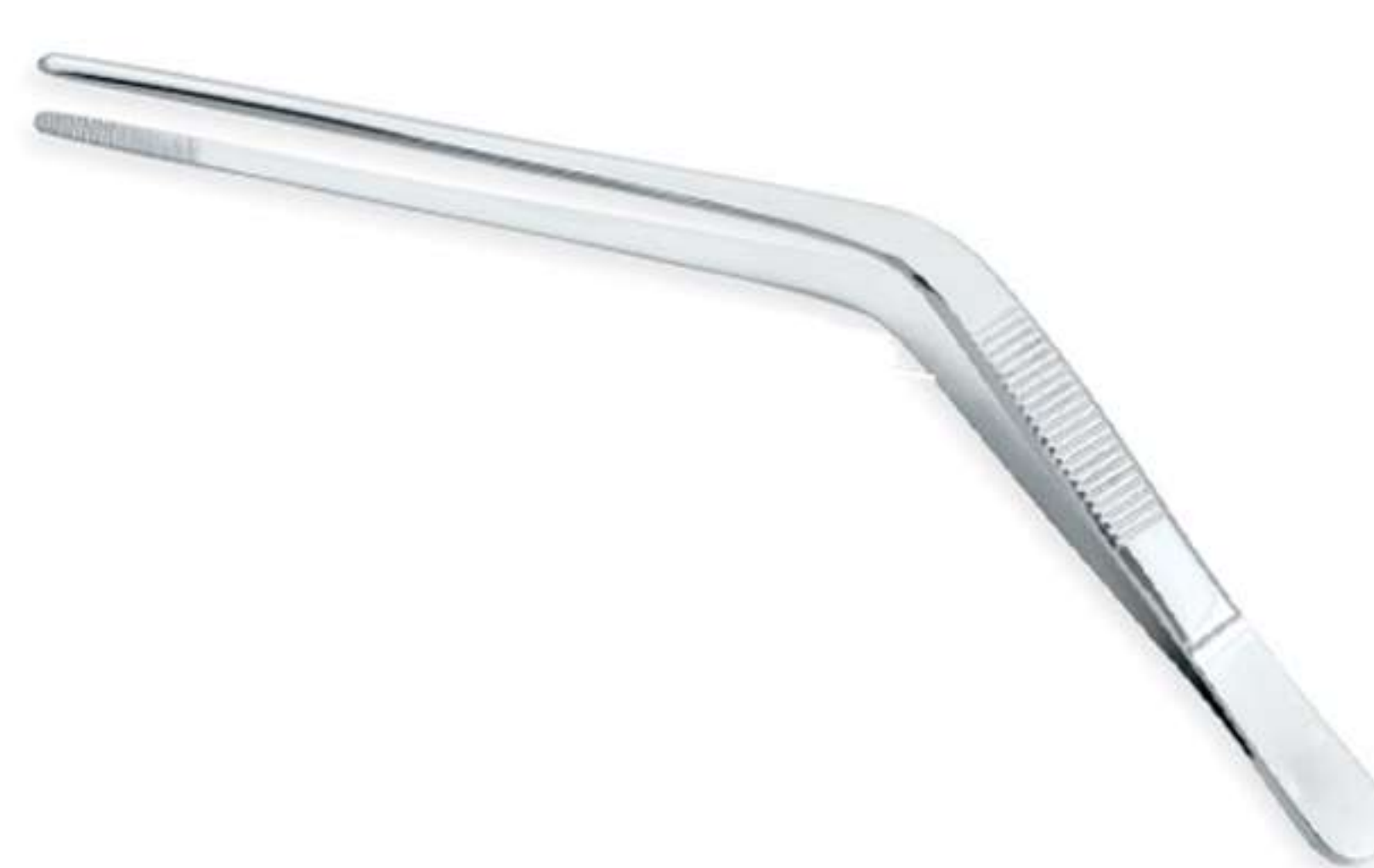
Art no: AS-3-2005

This classic model with serrated Bent tips is used for various purposes from surgical to assembly line and it's available in magnetic and non magnetic steel type.