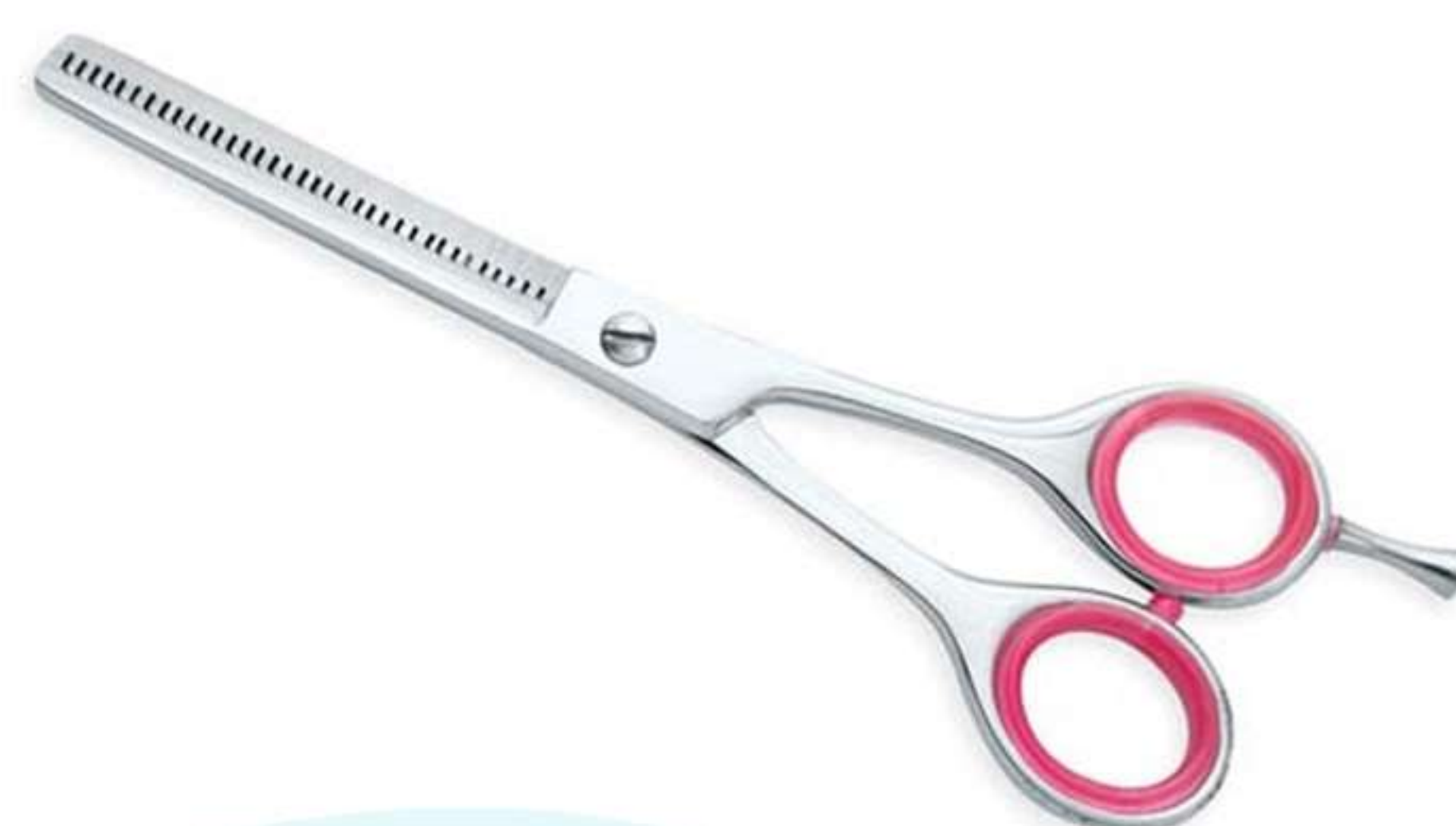
Art no: AS-3-1102

Available in Stainless steel AISI 420 or 440 with hollow ground inner blades and Convex edge, 42 teeth Thinning scissors for a smooth cut.