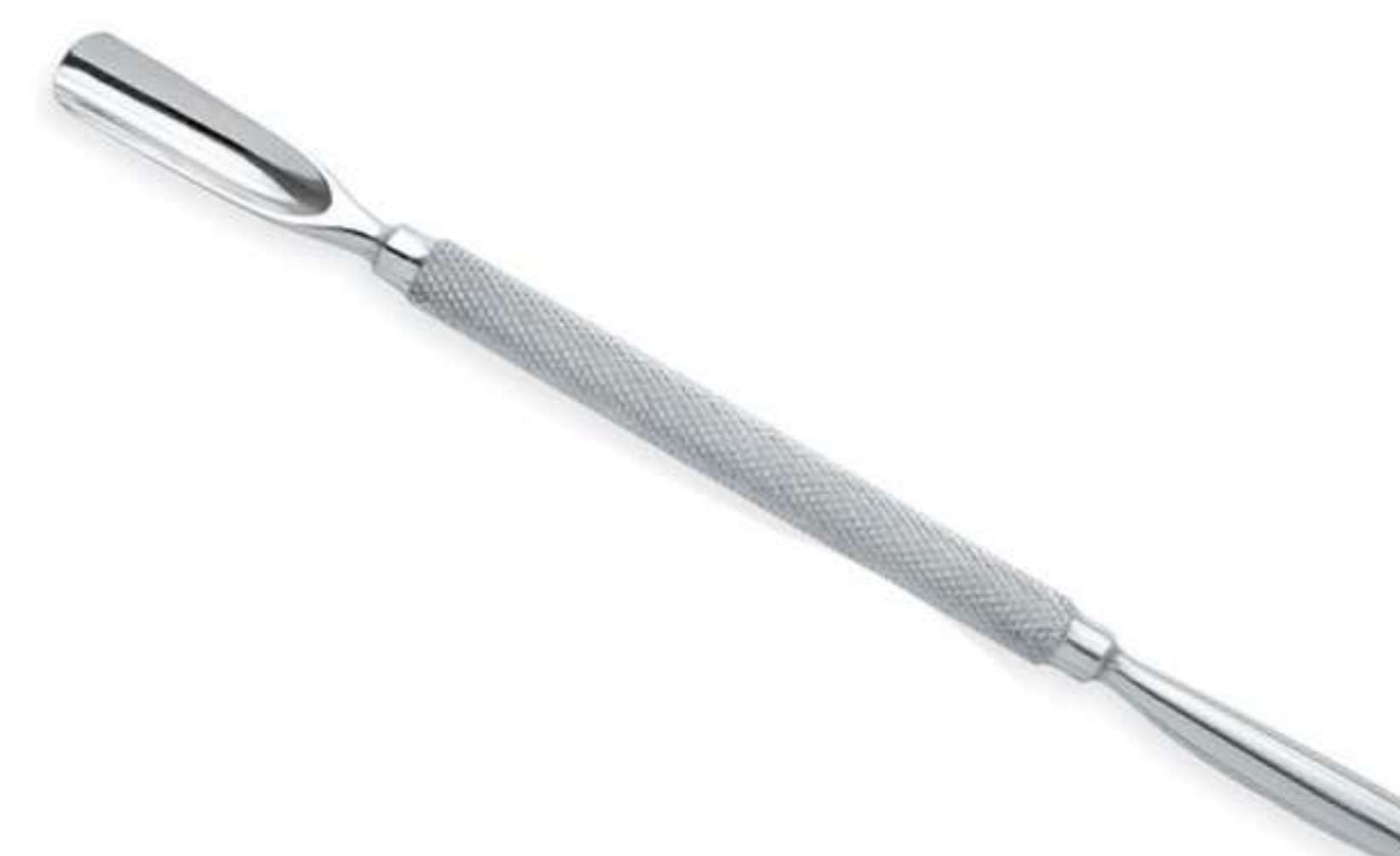
Art no: AS-3-2303

Cuticle Pushers Double Ended made of surgical grade stainless steel of Japanese origin makes these tools truly professional and surgical grade allows you to sterilize these after every use.