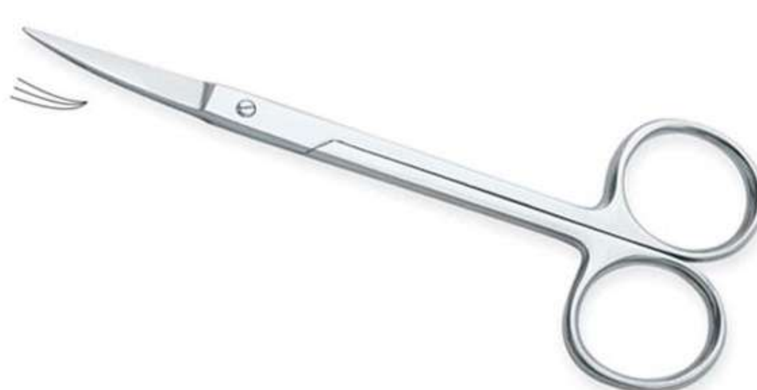
Art no: AS-3-1805

Originally from the line of Surgical Scissors this model of Dissecting Scissors can be used for various operations in household as well as in Embroidery. Available Options Size 4" 4½"