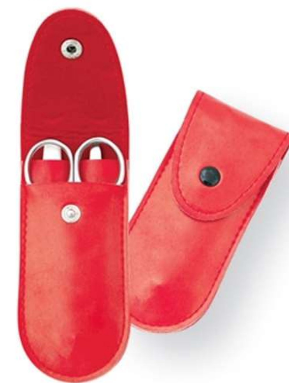
Art no: AS-3-2206

Manicure & pedicure set packed in fine leather and velvet pouch<br />