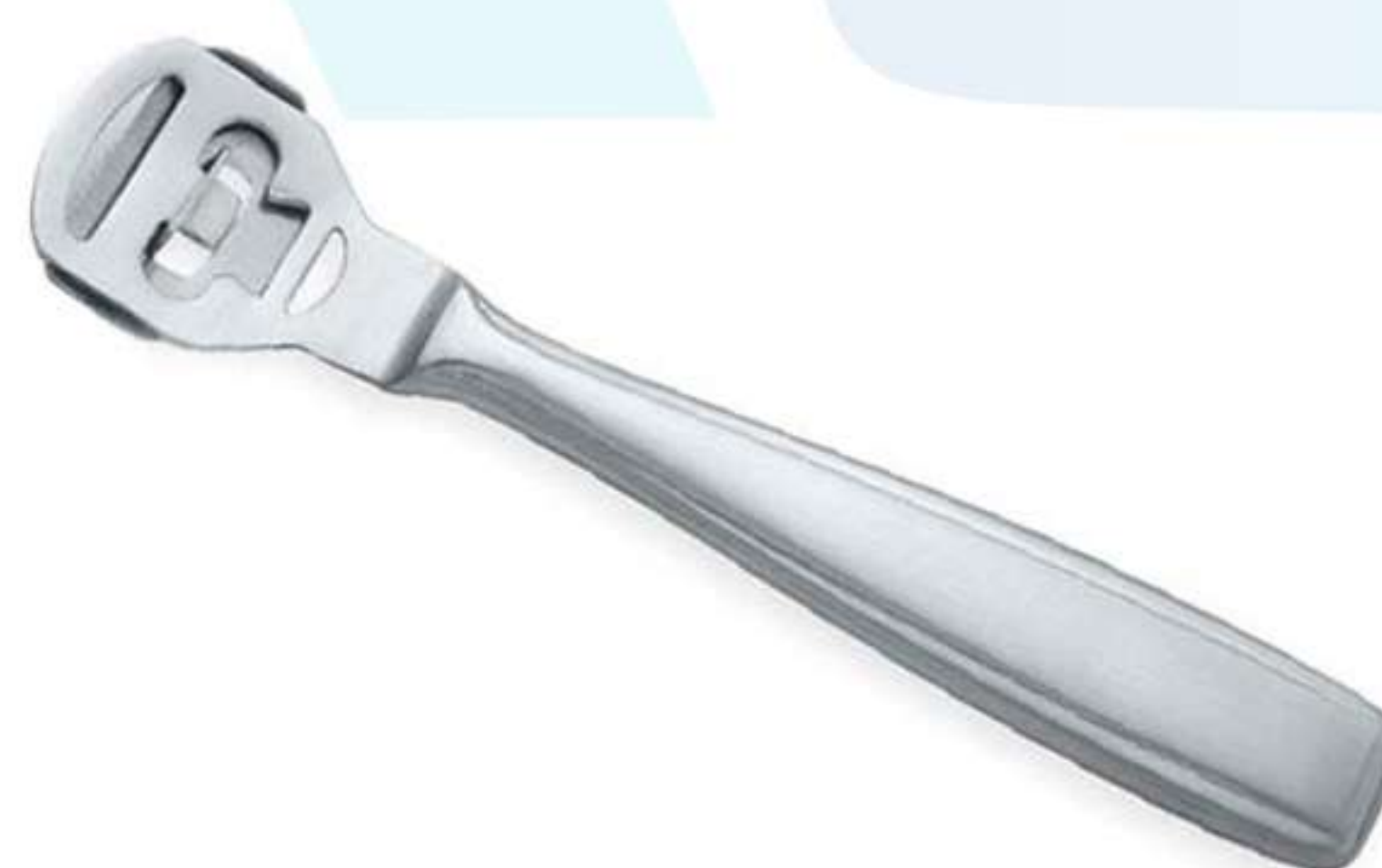
Art no: AS-3-1505

Corn cutter with plastic handle, Handle can be supplied with many available colors.