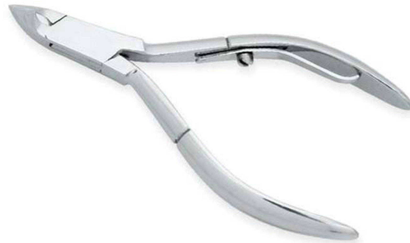
Art no: AS-3-2102

Forged from Surgical Grade Stainless Steel with Lap Joint, Single Sheet Spring and finished to perfection. Available Options Size 3.5" 4" 4.5"