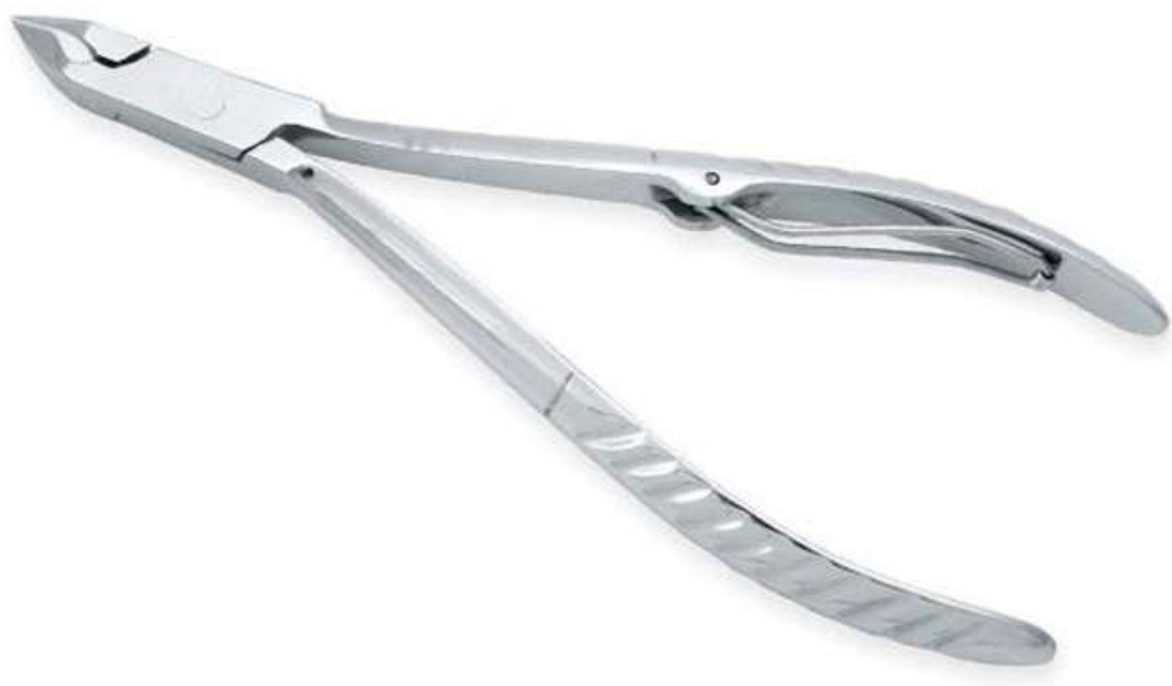
Art no: AS-3-2119

Forged from Surgical Grade Stainless Steel with Lap Joint, Single Wire Spring and light handles for smooth operations Available Options Size 5"