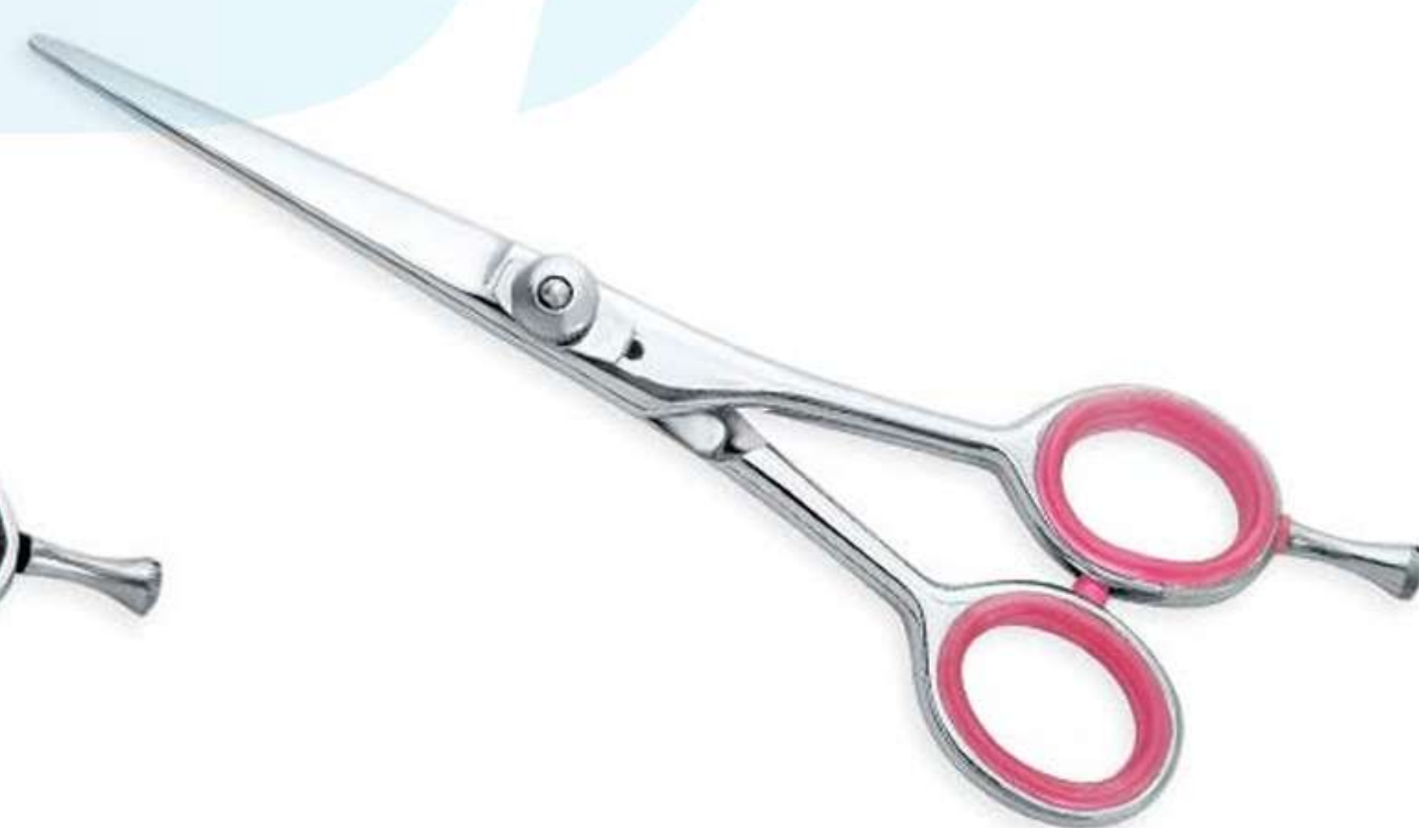
Art no: AS-3-1012

Available in Stainless steel AISI 420 or 440 with hollow ground inner blades and Convex edge, Its light weight scissors for the stylists who like small blades. Available Options Size 5 1/2"