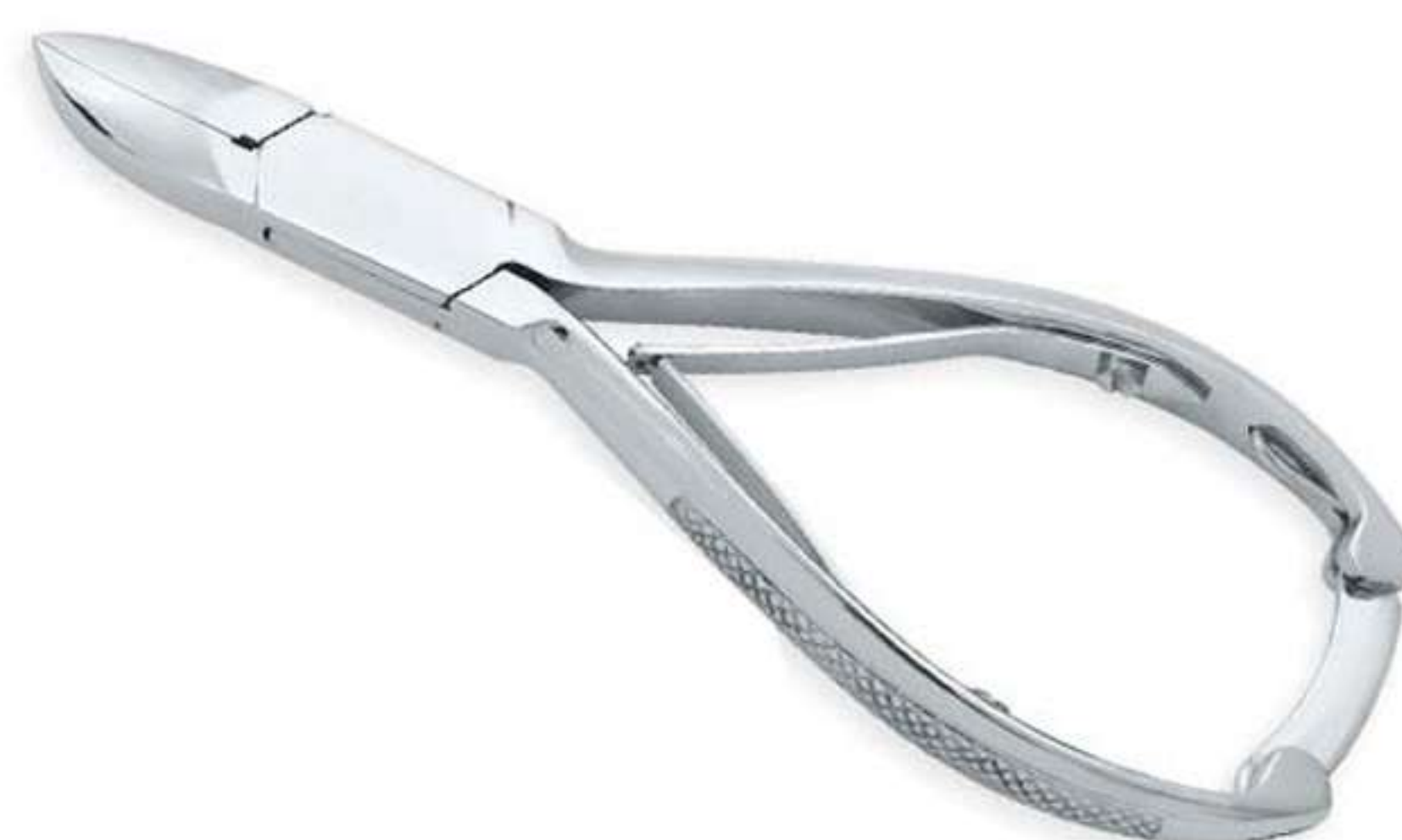
Art no: AS-3-2105

Forged from Surgical Grade Stainless Steel with Lap Joint, Barrel Spring and textures handles ideal for professional work of pedicure. Available Options Size 4.5" 5" 5.5"