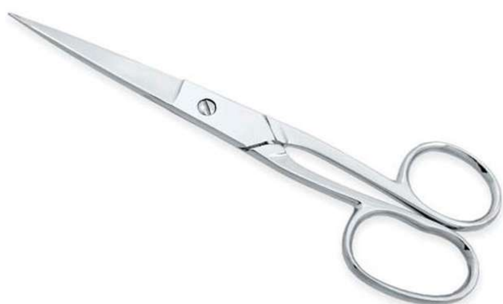
Art no: AS-3-1701

Sewing Scissors with two pointed blades is available in Size 8", 10" for various uses at home or for the industrial purpose. This Scissors is made out of high carbon Stainless Steel alloy which gives it long lasting sharpness