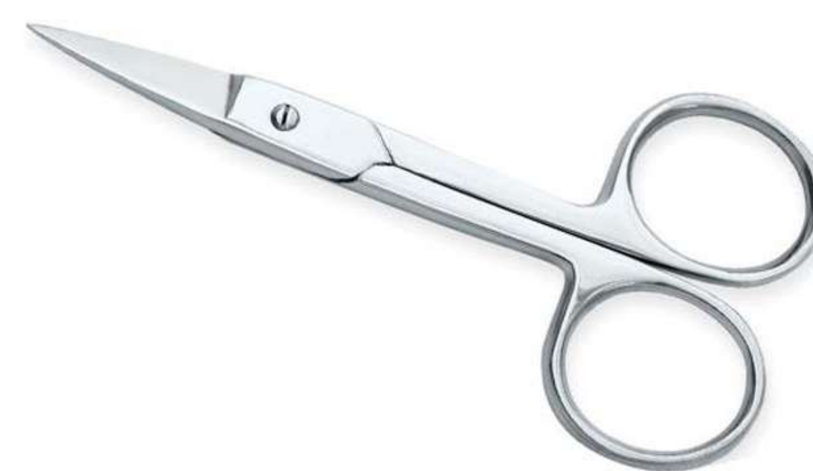
Art no: AS-3-1813

Nail Scissors Straight is also a classic model of Nail Scissors and one of our best sellers. Special grade of stainless steel and excellent craftsmanship makes these scissors last longer and keep them smooth. Available Options Size 3.5"