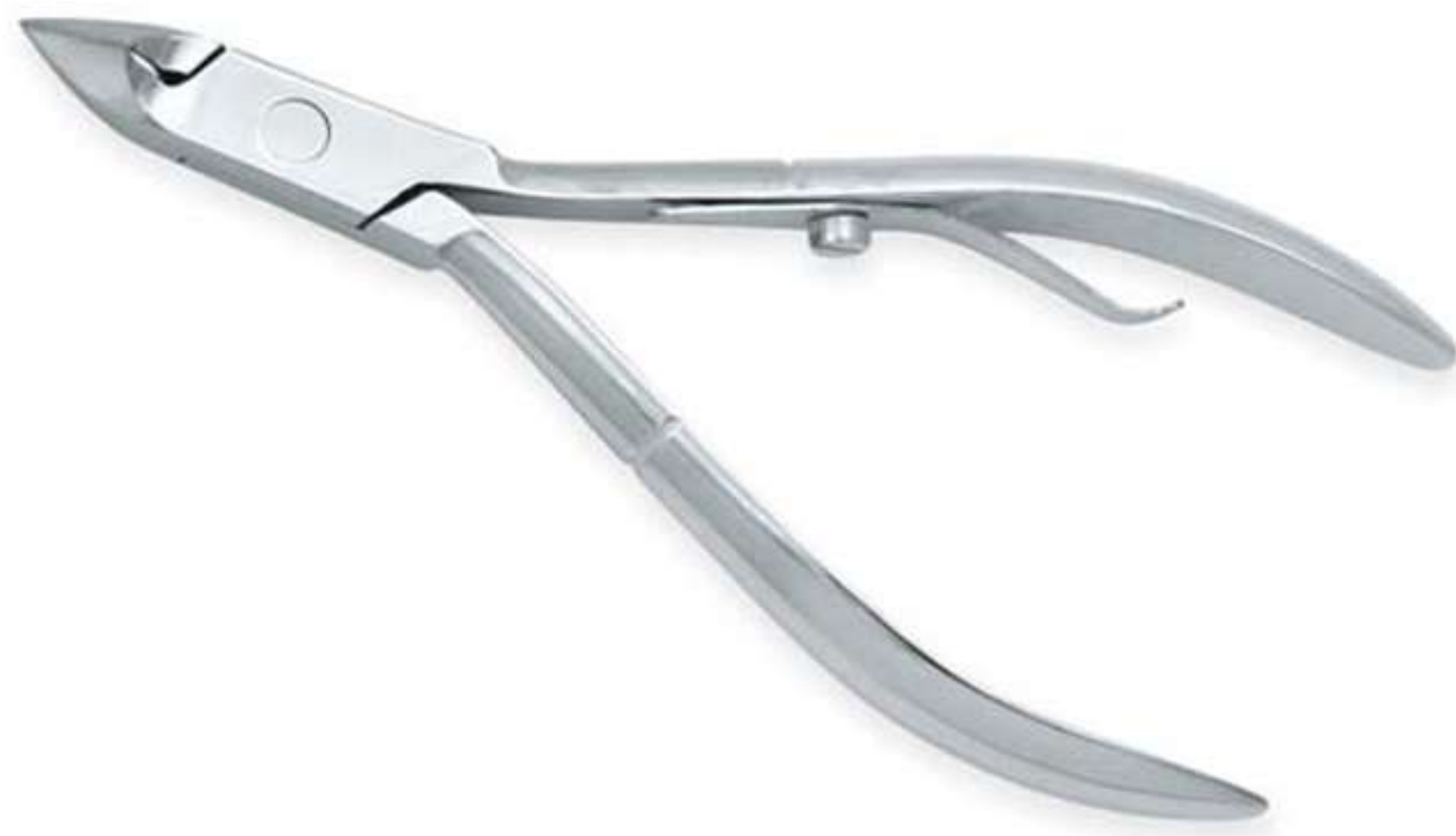
Art no: AS-3-2101

Forged from Surgical Grade Stainless Steel with Lap Joint, Single Sheet Spring and finished to perfection. Available Options Size 3.5" 4" 4.5"