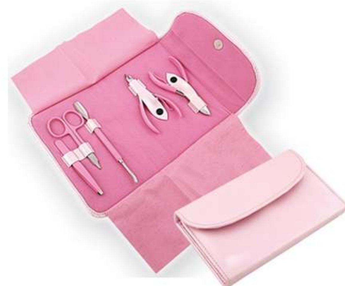
Art no: AS-3-2202

This is pocket manicure sets with leather pouch available in many colors.<br />