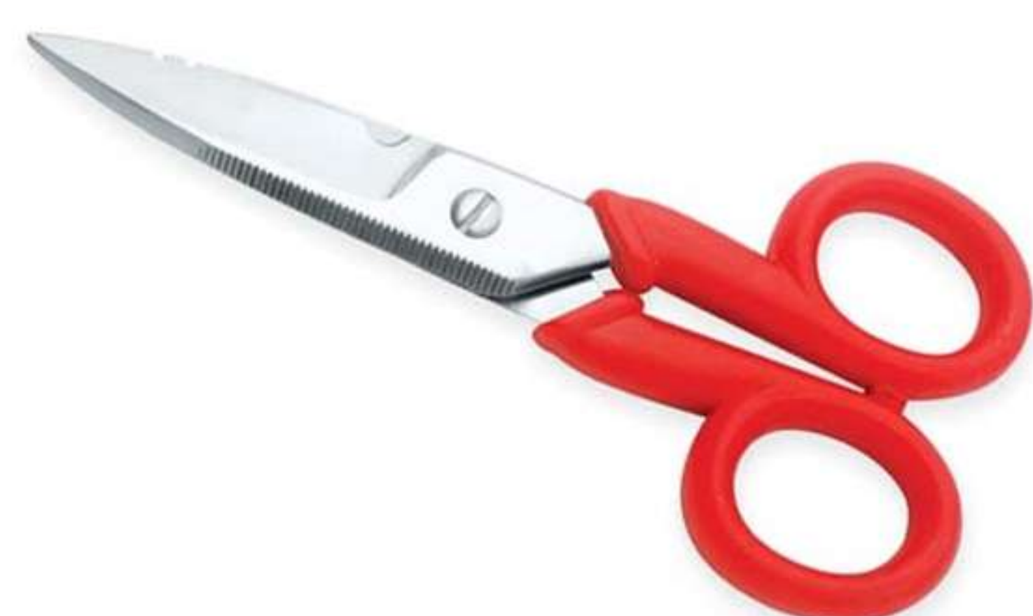
Art no: AS-3-1807

This Classic model of Wire cutting Scissors is offered with different color of handles and heavy sheet of blades with high carbon steel makes these scissors durable and sharpness also last longer.