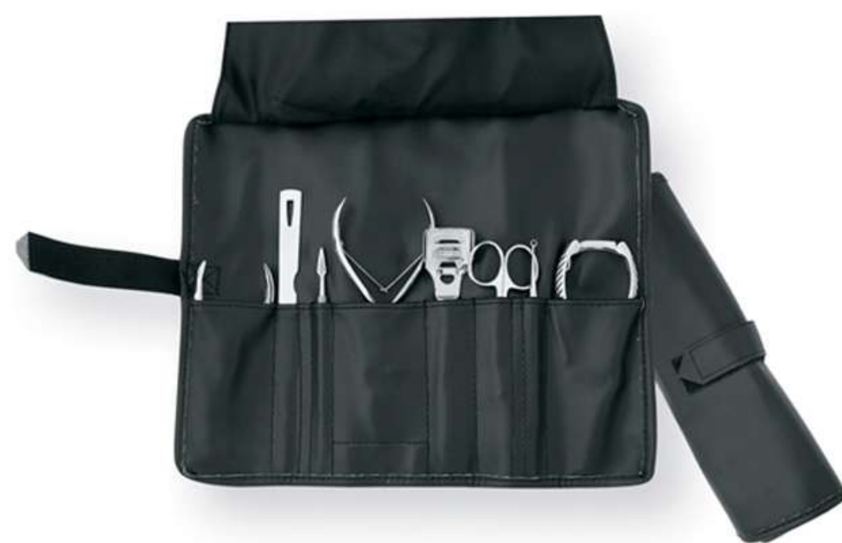
Art no: AS-3-2204

This is Economy version of pocket manicure set , Available in many colors<br />