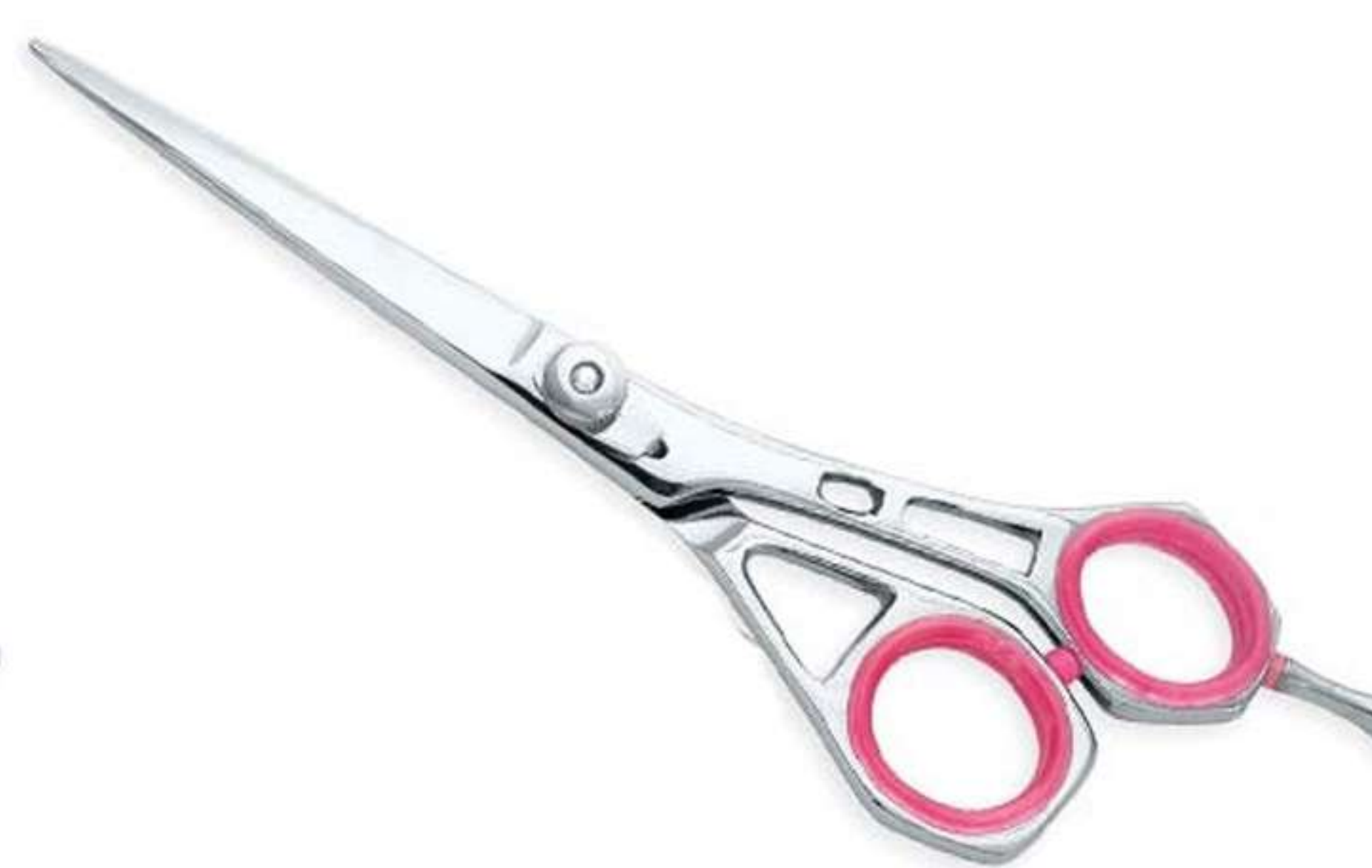
Art no: AS-3-1008

Available in Stainless steel AISI 420 or 440 with hollow ground inner blades and Convex edge, Samurai Sword Type blade shape for smooth creative cut. Available Options Size 6 1/2"