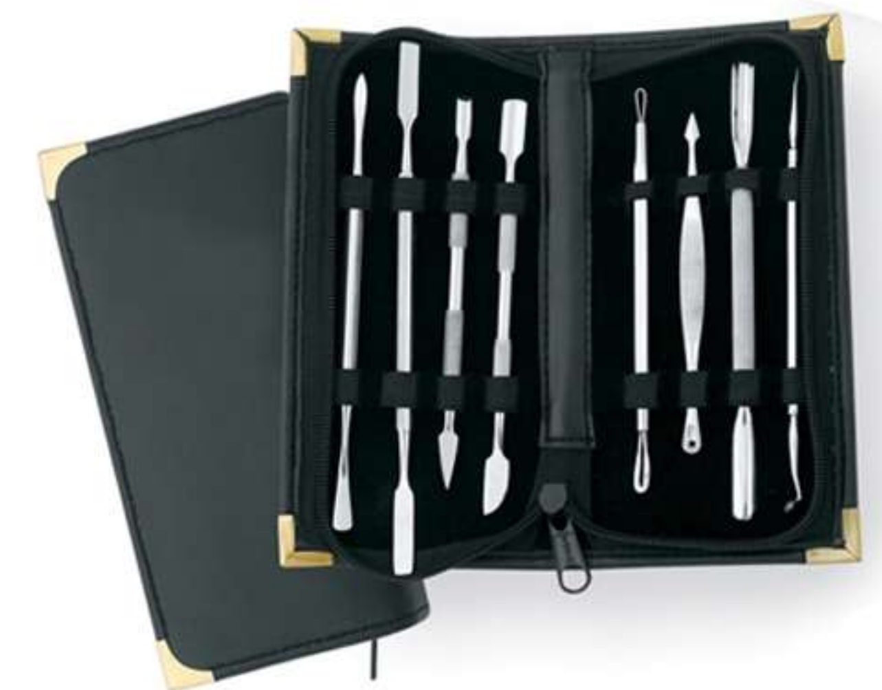
Art no: AS-3-2209

Economy version of manicure set in velvet pouch.