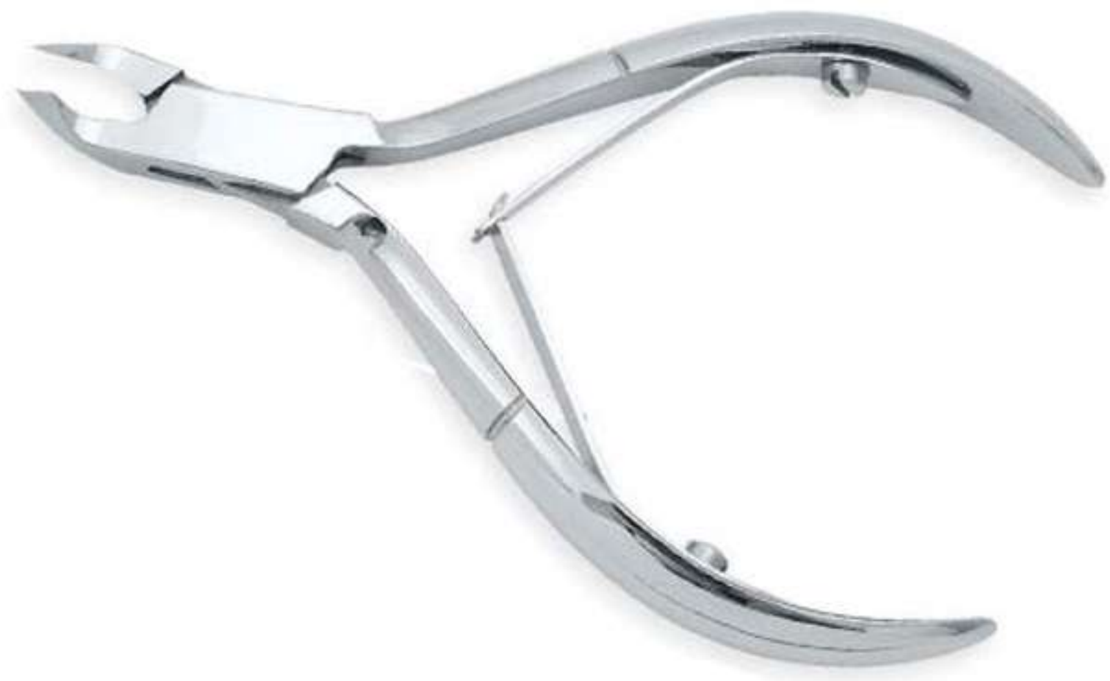
Art no: MS-3-2125

Forged from Surgical Grade Stainless Steel with Box Joint, Double Sheet Spring and finished to perfection