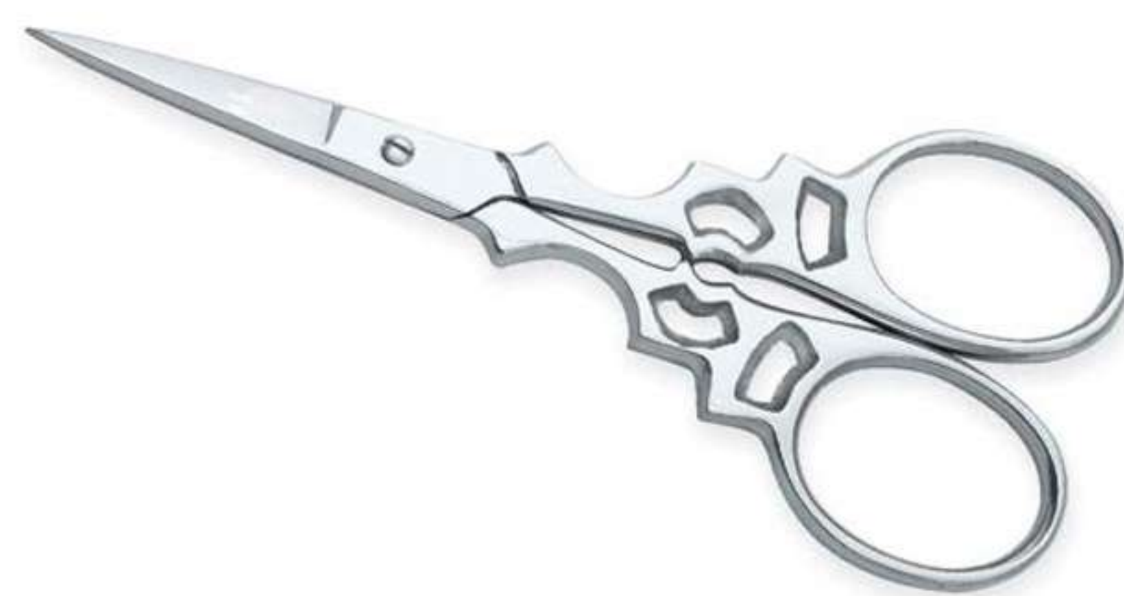
Art no: AS-3-1617

This model of nail scissors is a breakaway from the traditional models as its modern trendy and nicely balanced to perform excellent operation for all sort of nails. Special Steel used for this Scissors makes it special.