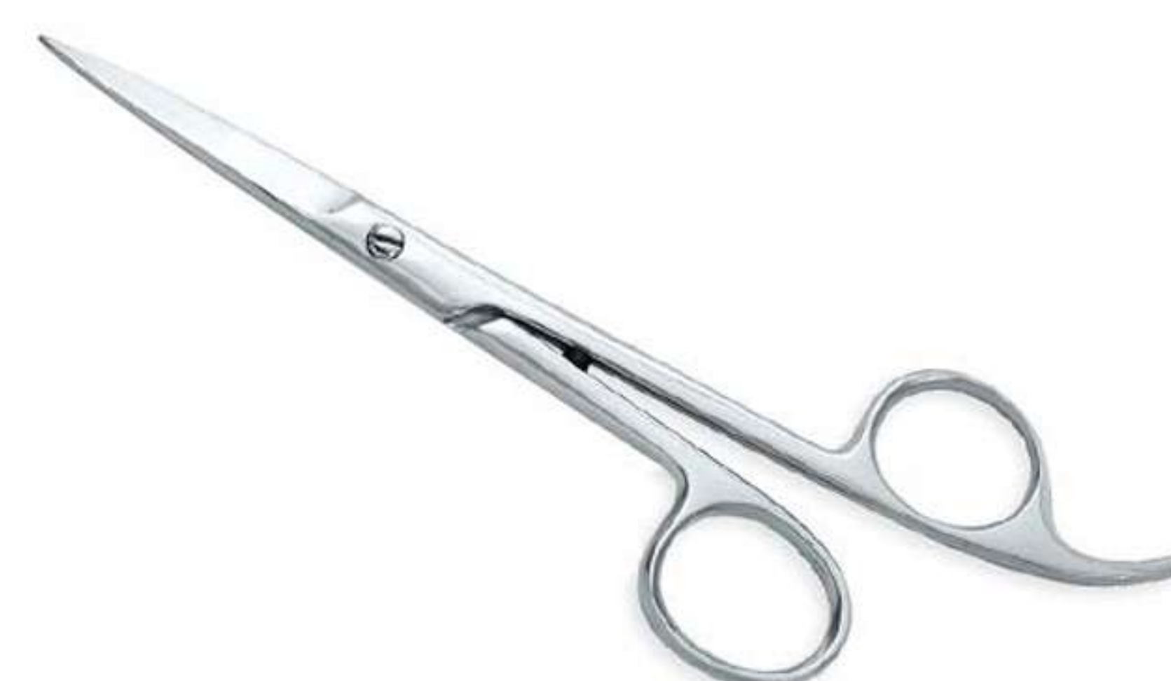
Art no: AS-3-1308

Made from Selected steel and machined to perfection for smooth thinning operation with 30 teeth single blade thinning Scissors without finger rest.