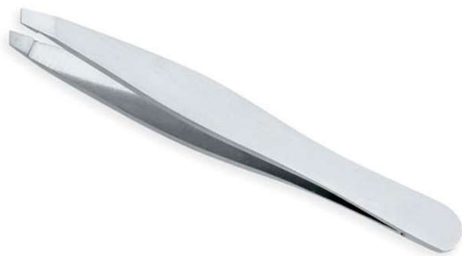
Art no: AS-3-1910

&nbsp;Eye Brow Tweezers Available Options Size 3.5"