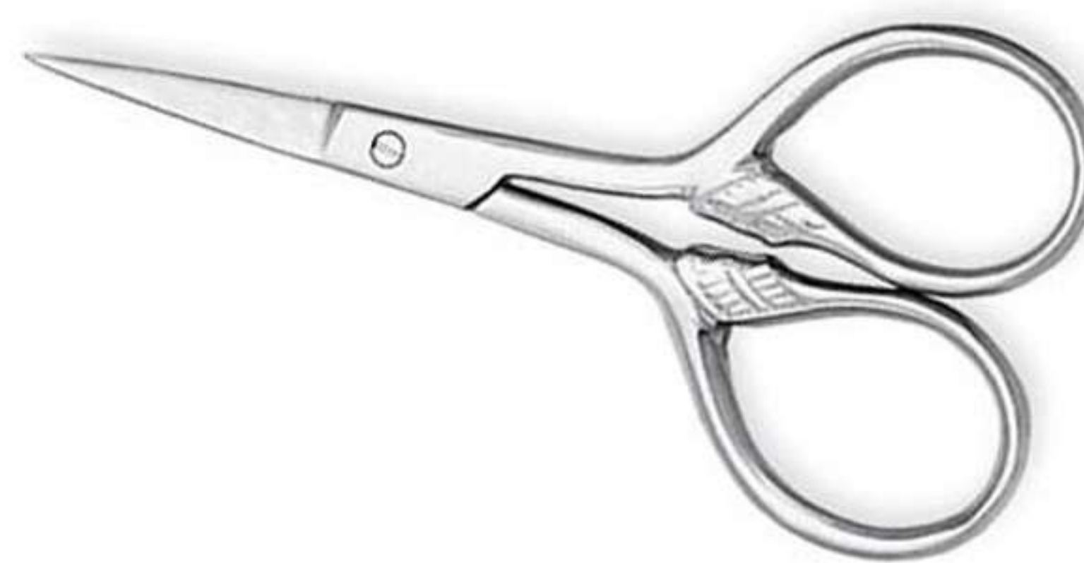
Art no: AS-3-1611

&nbsp;Fancy Embroidery Scissors Available Options Size 3½"