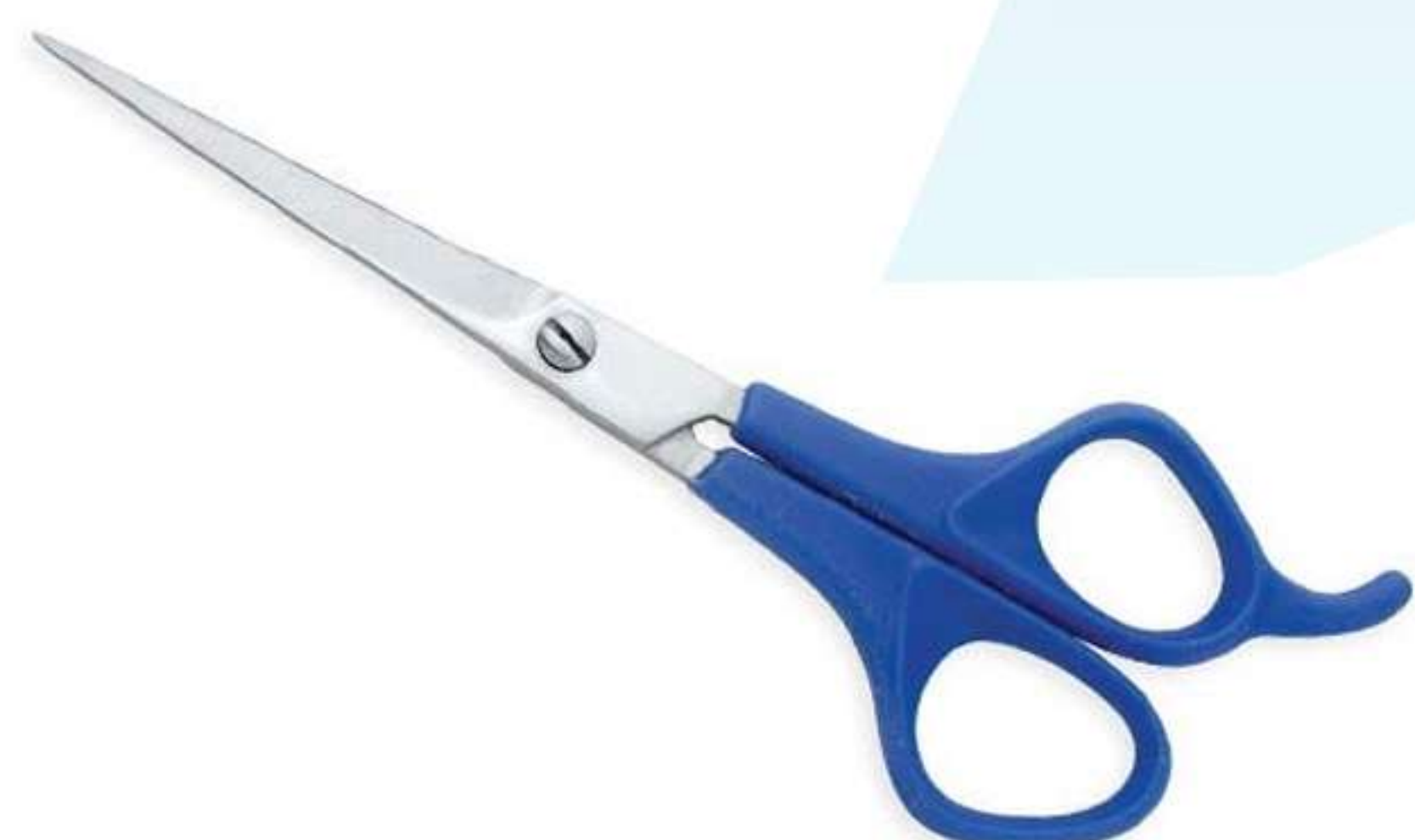
Art no: AS-3-1216

&nbsp;Made from selected steel and crafted to perfection for smooth operation and sharpness with one blade micro serrated, Brass removable finger rest and painted handles. Available Options Size 6.5"