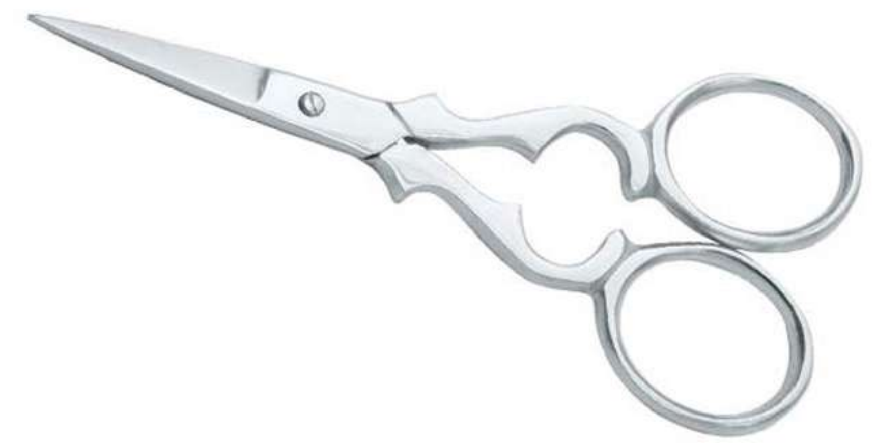
Art no: AS-3-1609

&nbsp;Beautiful design and excellent working ability is one of the features of our range of Fancy Scissors which are made out of Special Steel for long lasting cutting ability. Available Options Size 3½"