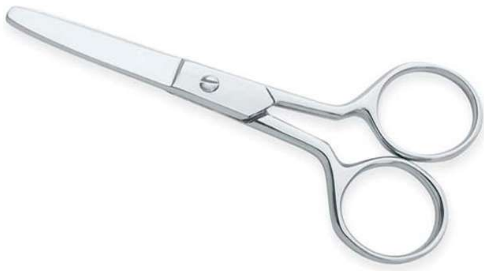
Art no: AS-3-1607

&nbsp;This Classic model of buttonhole Scissors is still a good utility for the hobby crafts in the field of sewing and embroidery and our model fulfills all requirement for the classic buttonhole Scissors.