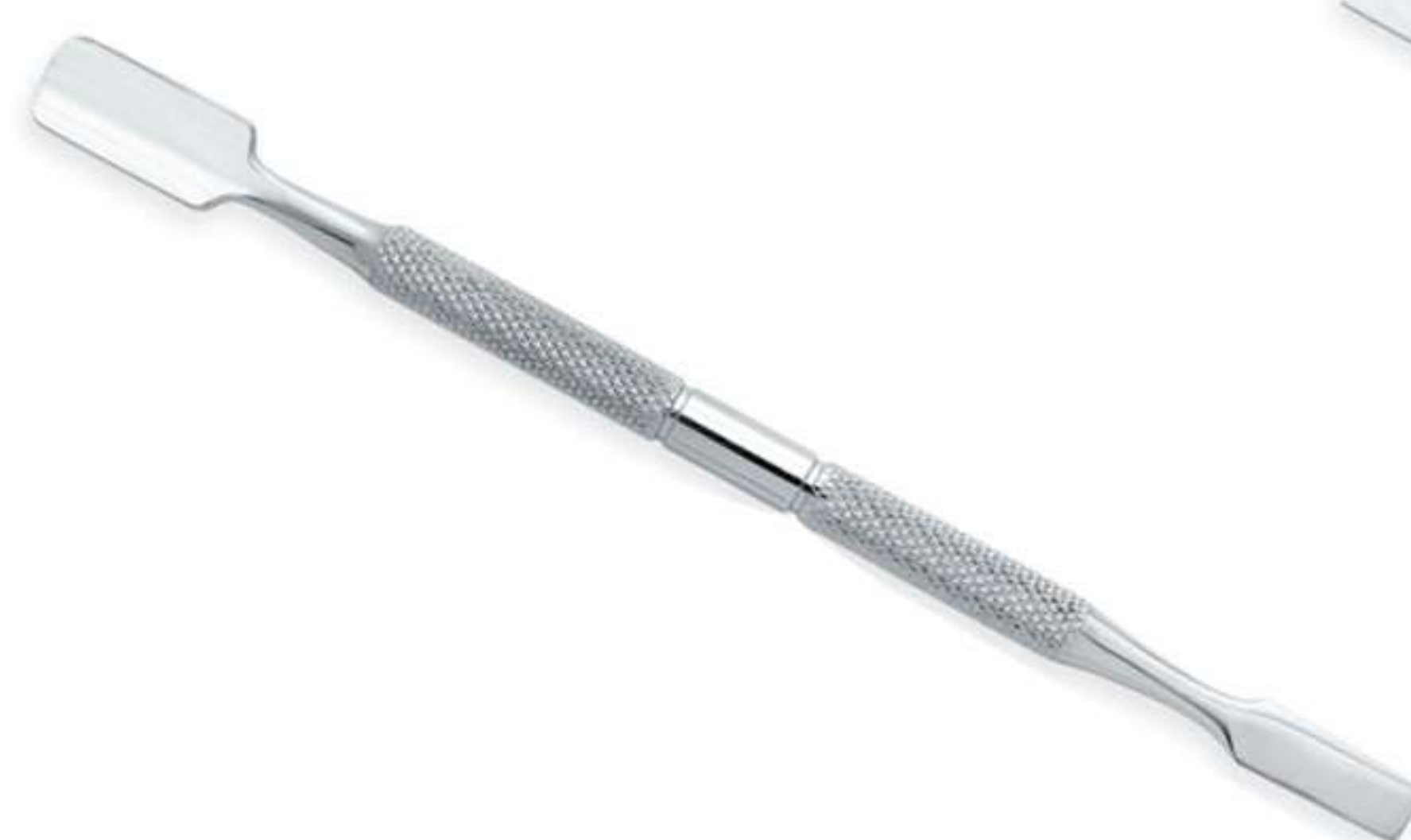
Art no: AS-3-2305

Cuticle Pushers Double Ended made of surgical grade stainless steel of Japanese origin makes these tools truly professional and surgical grade allows you to sterilize these after every use.