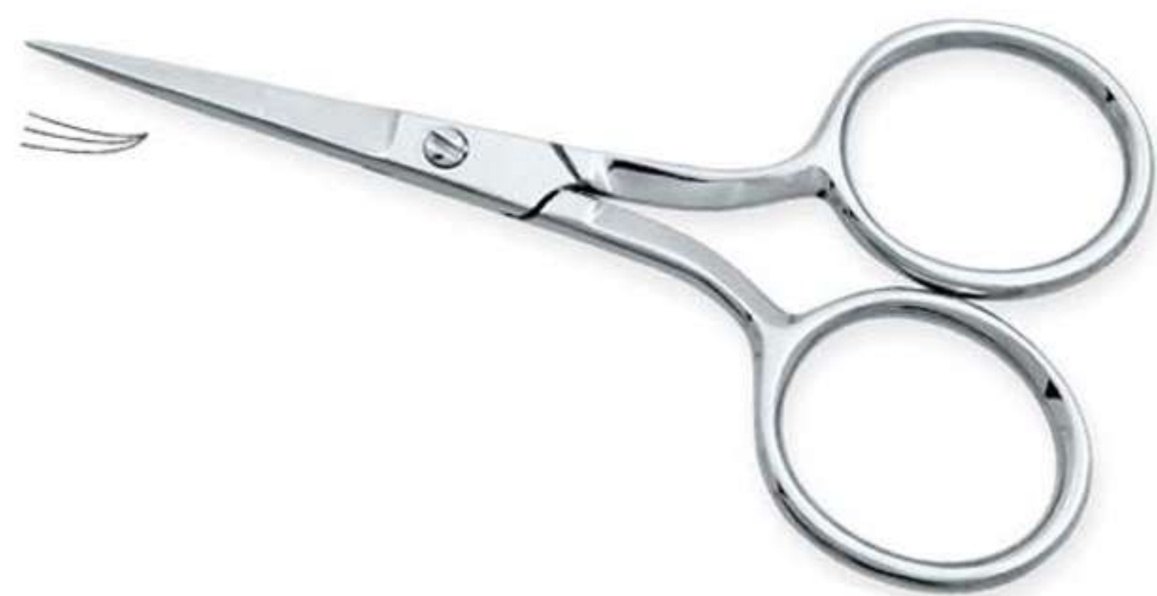
Art no: AS-3-1622

Beautiful design and excellent working ability is one of the features of our range of Fancy Scissors which are made out of Special Steel for long lasting cutting ability.