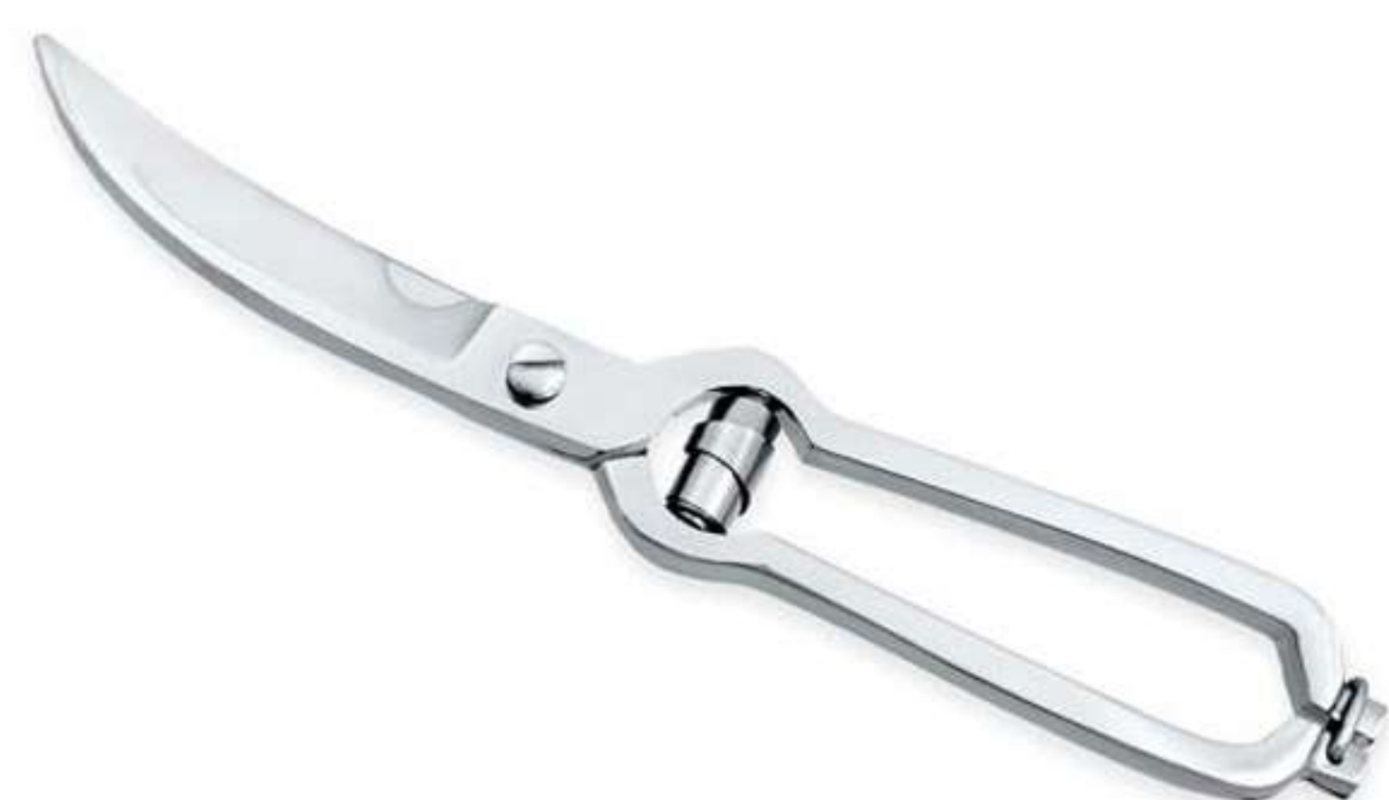
Art no: AS-3-1810

We are currently offering these Scissors only in the casted version and with one blade micro serrated these scissors can be used for poultry as well as for the leather cutting industry.