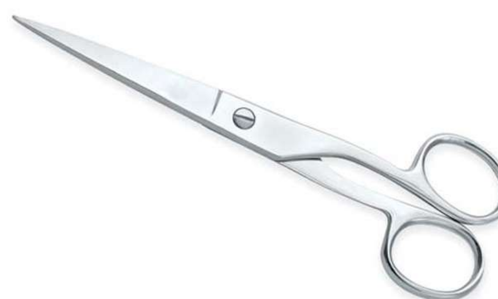
Art no: AS-3-1711

&nbsp;This Classic model of Kitchen Scissors is available in two options. For quality conscious market we offer Forged Scissors with excellent quality and for Economy markets we offer Casted Scissors with standard quality. Available Options Size 8"