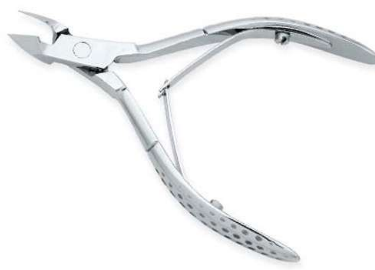
Art no: AS-3-2123

Forged from Surgical Grade Stainless Steel with Lap Joint, Double Sheet Spring and finished to perfection Available Options Size 5"