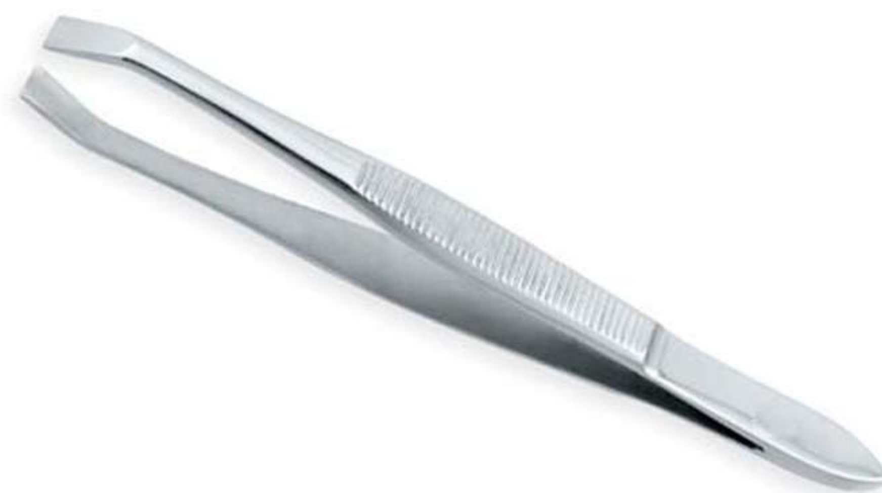
Art no: AS-3-1905

&nbsp;Plane Eye brow Tweezers Available Options Size 3" 3.5" 4"