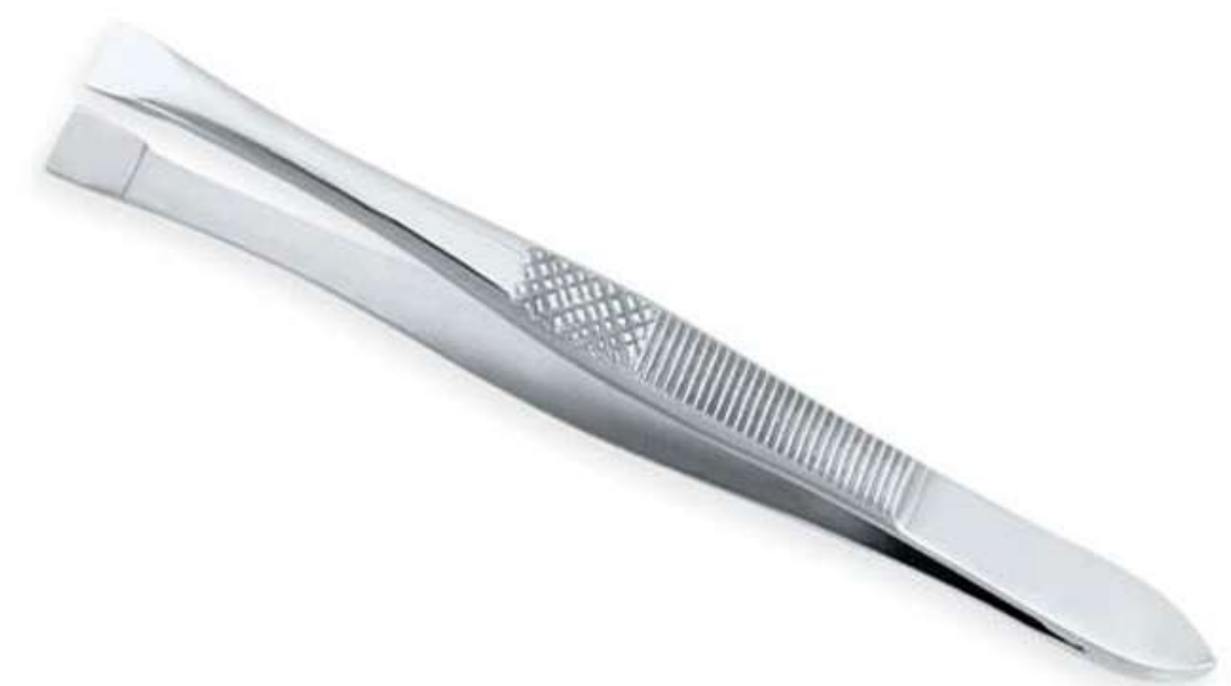
Art no: AS-3-1912

&nbsp;Tweezer with fine point ideal for removal of fine or coarse hairs at the root Available Options Size 3" 3.5" 4"