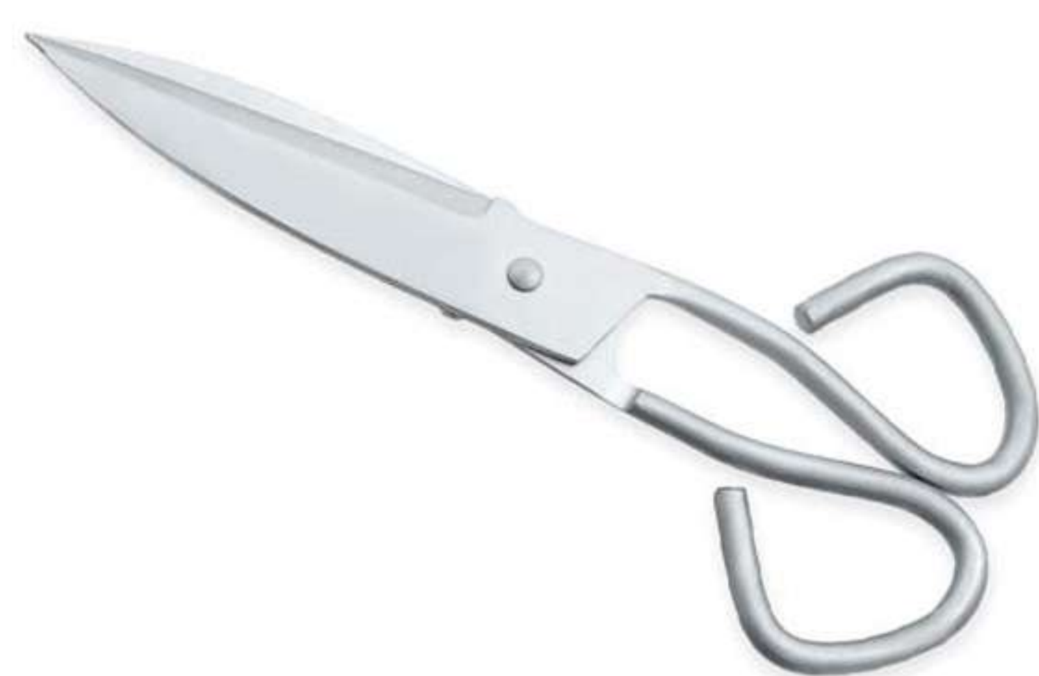
Art no: AS-3-1704

Paper Scissors with two pointed blades is available in Size 7"; for various uses at home or for the industrial purpose. This Scissors is made out of high carbon Stainless Steel alloy which gives it long lasting sharpness