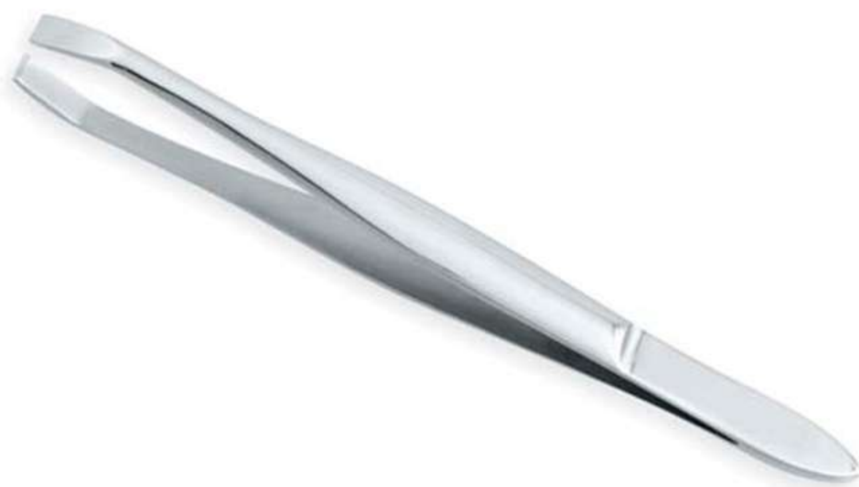
Art no: AS-3-1904

&nbsp;with thumb grip on handles Available Options Size 3" 3.5" 4"