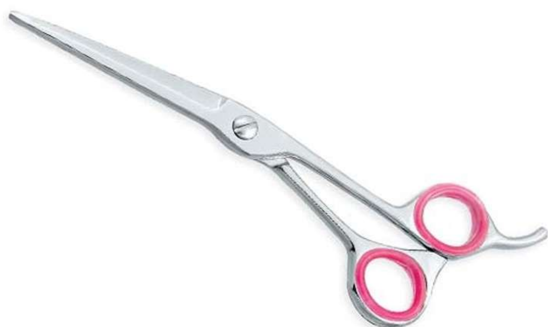
Art no: AS-3-1007

Available in Stainless steel AISI 420 or 440 with hollow ground inner blades and Convex edge, Samurai Sword Type blade shape for smooth creative cut. Available Options Size 6 1/2"