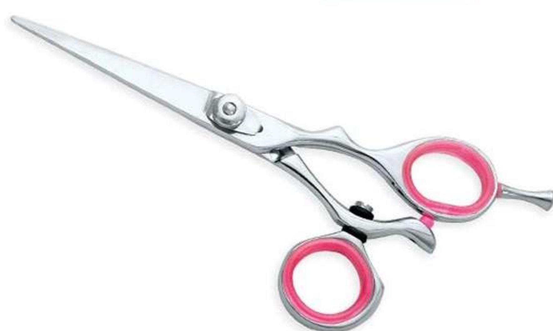
Art no: AS-3-1010

Available in Stainless steel AISI 420 or 440 with hollow ground inner blades and Convex edge, with Swirl thumb for free movement of scissors for very creative and stylish looking cut. Available Options Size 5 1/2" 6"