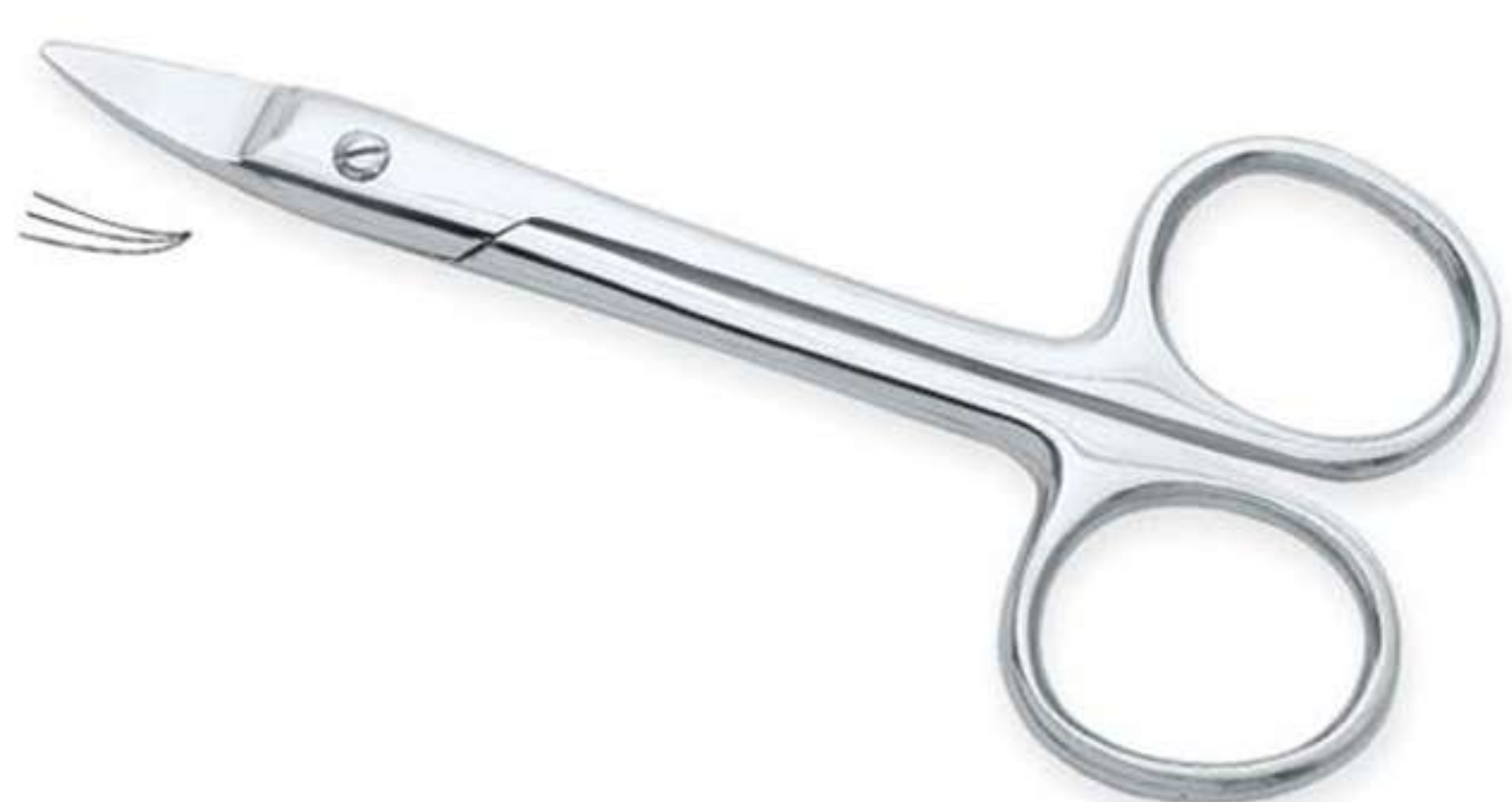
Art no: AS-3-1807

&nbsp;Crown Scissors Curved made out of heavy Sheet of Special alloys Steel gives it the strength needed to cut hard foot nails with great perfection and control Available Options Size 4½"