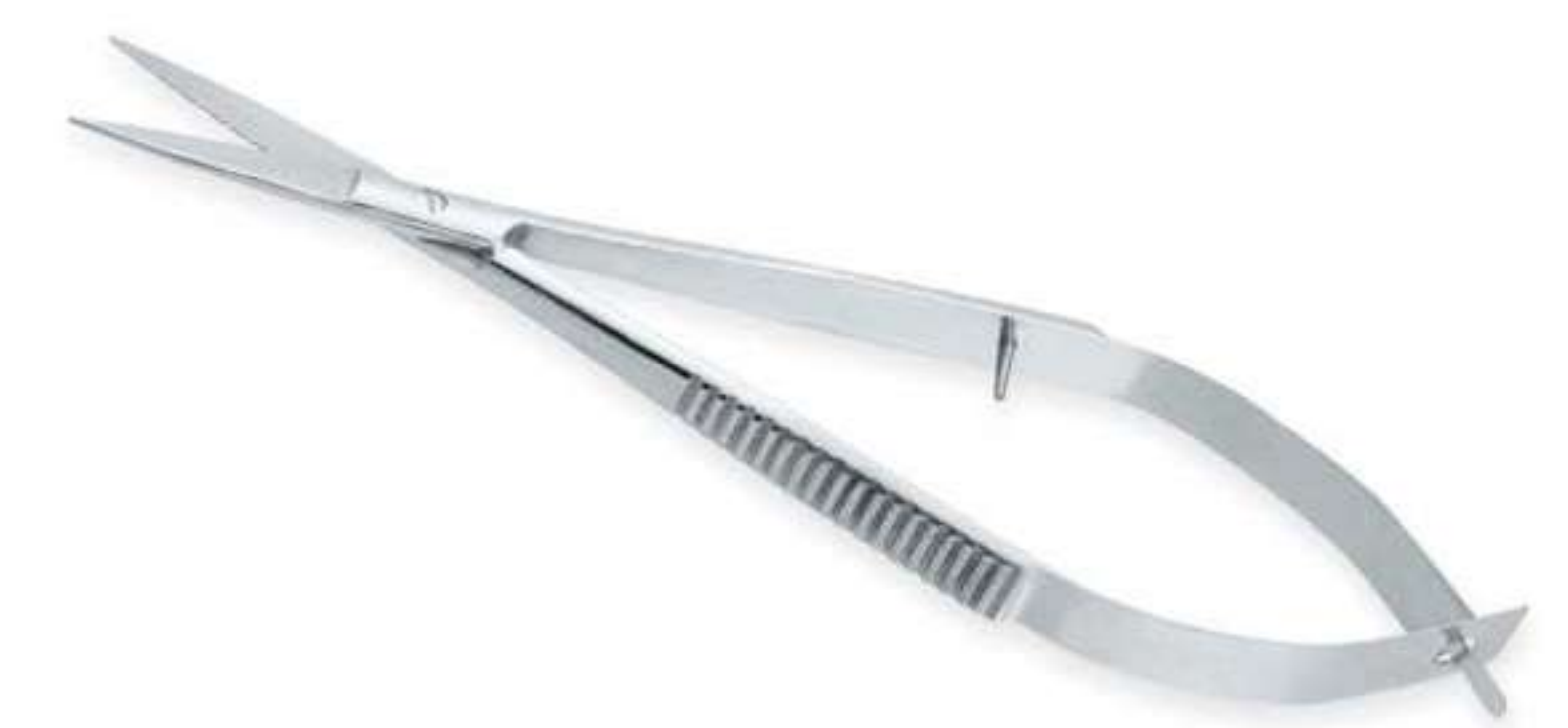
Art no: AS-3-1624

Beautiful design and excellent working ability is one of the features of our range of Fancy Scissors which are made out of Special Steel for long lasting cutting ability.