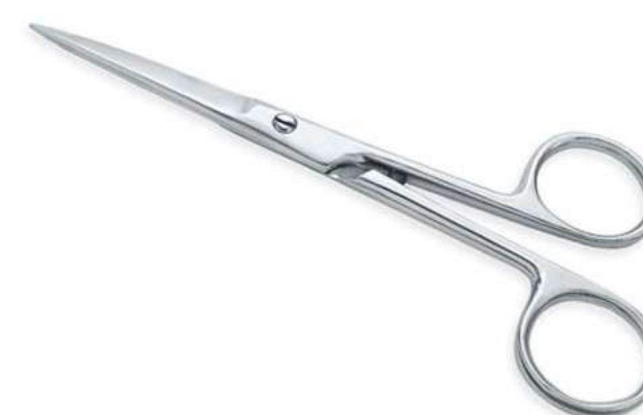
Art no: AS-3-1306

Made from Selected steel and machined to perfection for smooth thinning operation with 28 teeth single blade thinning Scissors with plastic handles. Available Options Size 6"