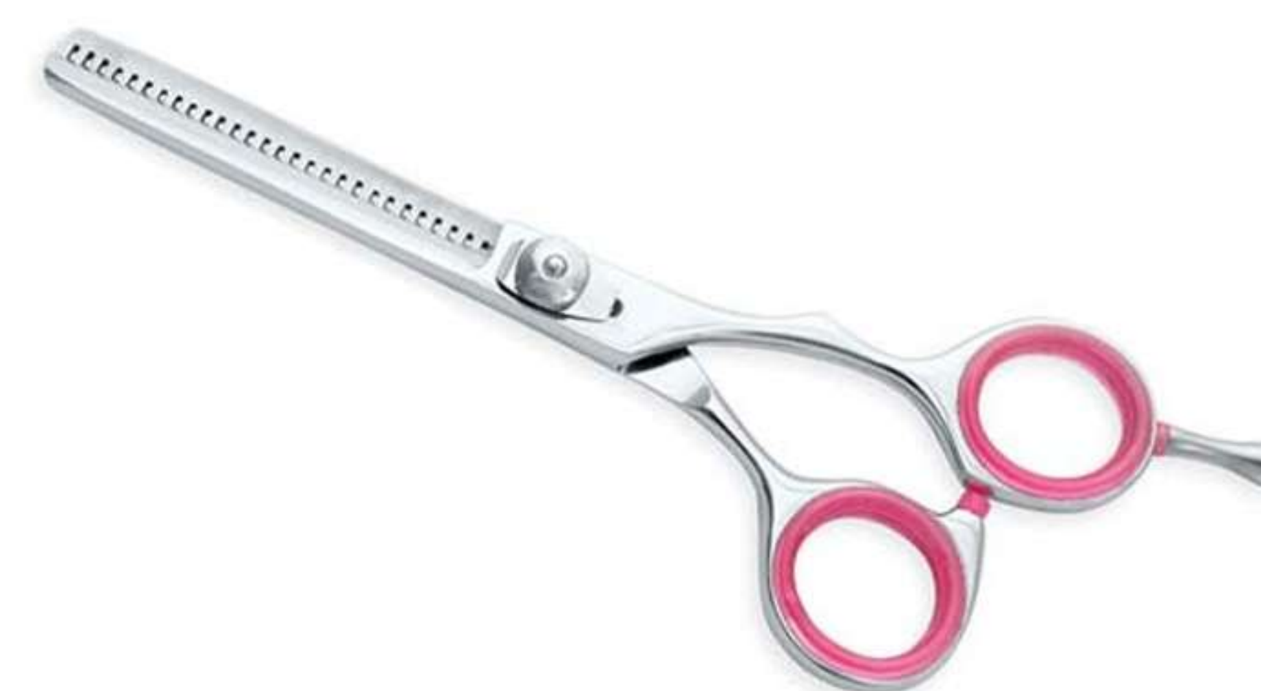
Art no: AS-3-1103

Available in Stainless steel AISI 420 or 440 with hollow ground inner blades and Convex edge, 34 teeth classic thinning scissors, One of our best seller.