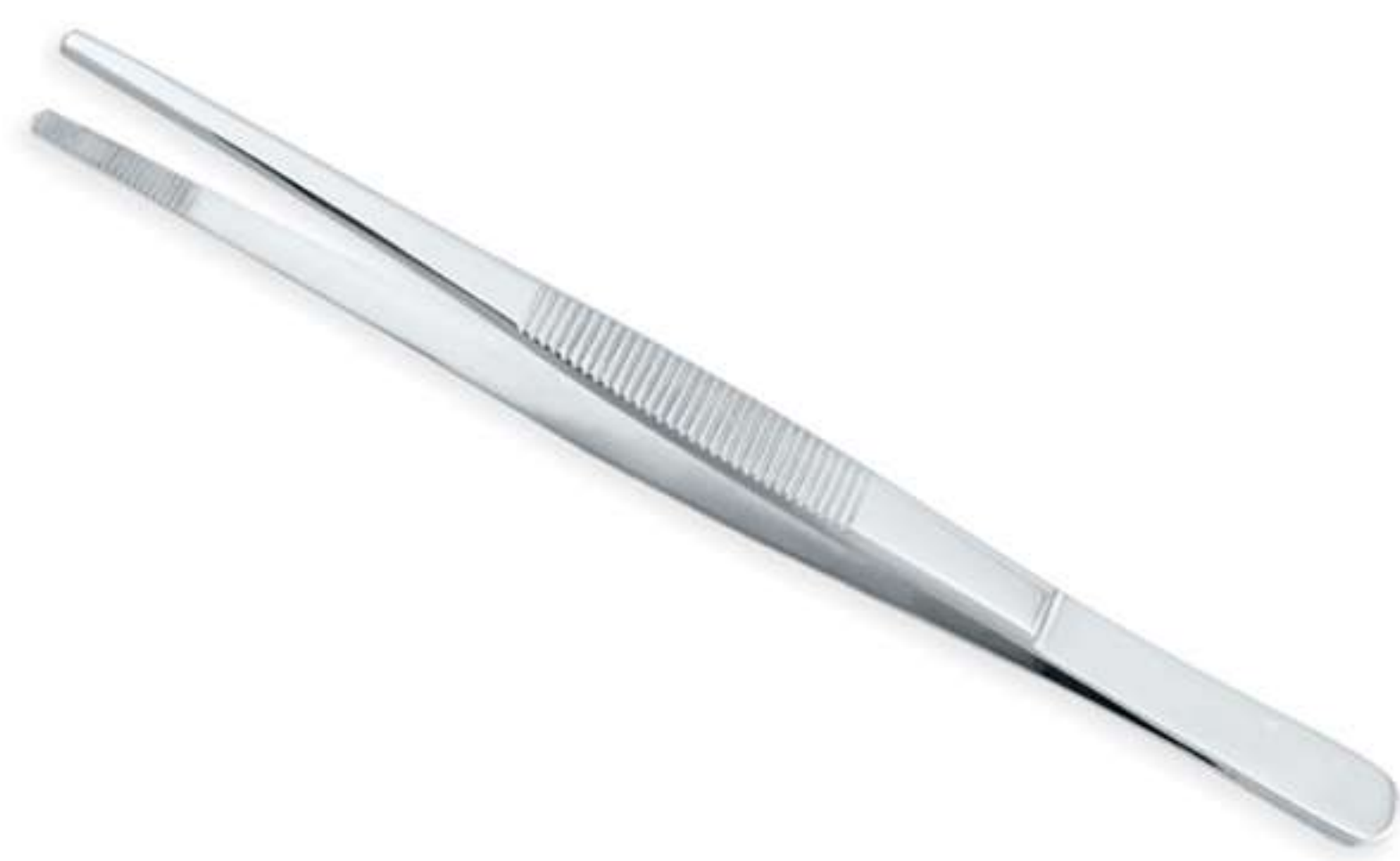
Art no: AS-3-2001

This classic model with serrated rounded tips is used for various purposes from surgical to assembly line and it's available in magnetic and non magnetic steel type.