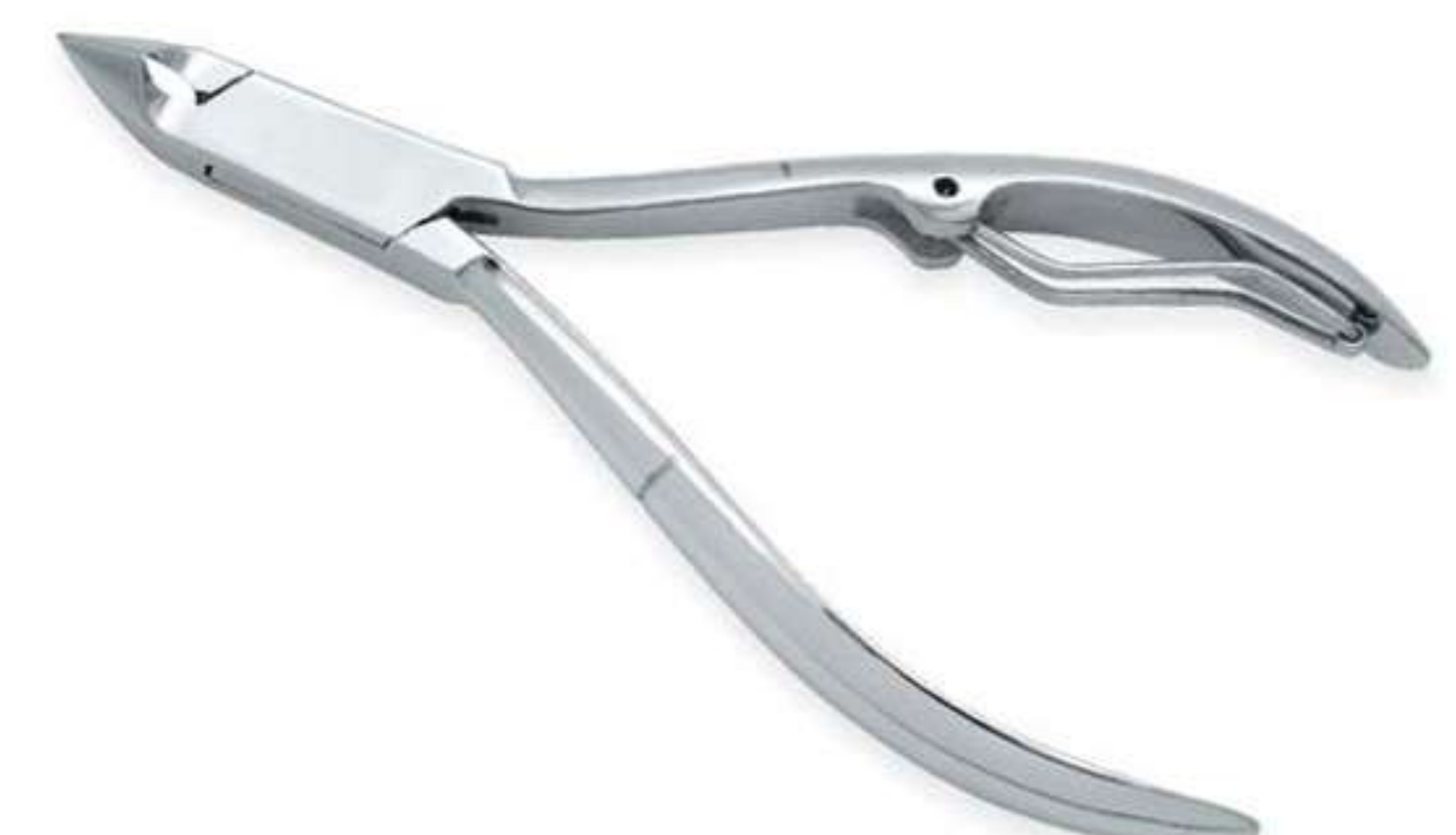
Art no: AS-3-2118

Forged from Surgical Grade Stainless Steel with Box Joint, Single Wire Spring and finished to perfection<br />