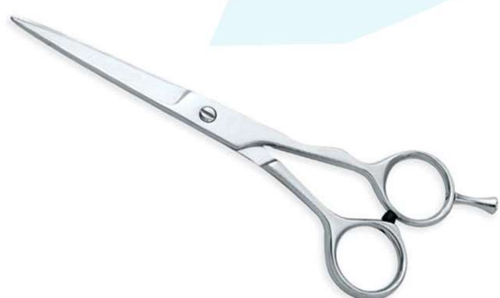
Art no: AS-3-1309

Made from Selected steel and machined to perfection for smooth thinning operation with 22 teeth double blade thinning Scissors without finger rest.