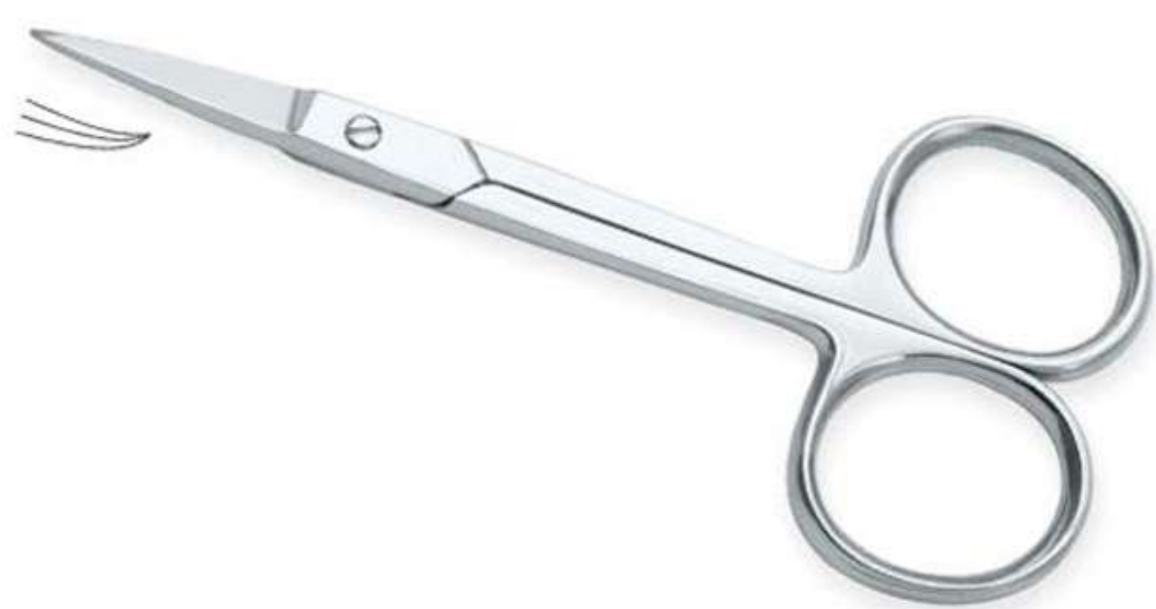
Art no: AS-3-1808

This model of Cuticle Scissors is Classic model with small finger holes and very sharp tip which allows a perfect cut for the cuticles. Available Option Size 3.5"