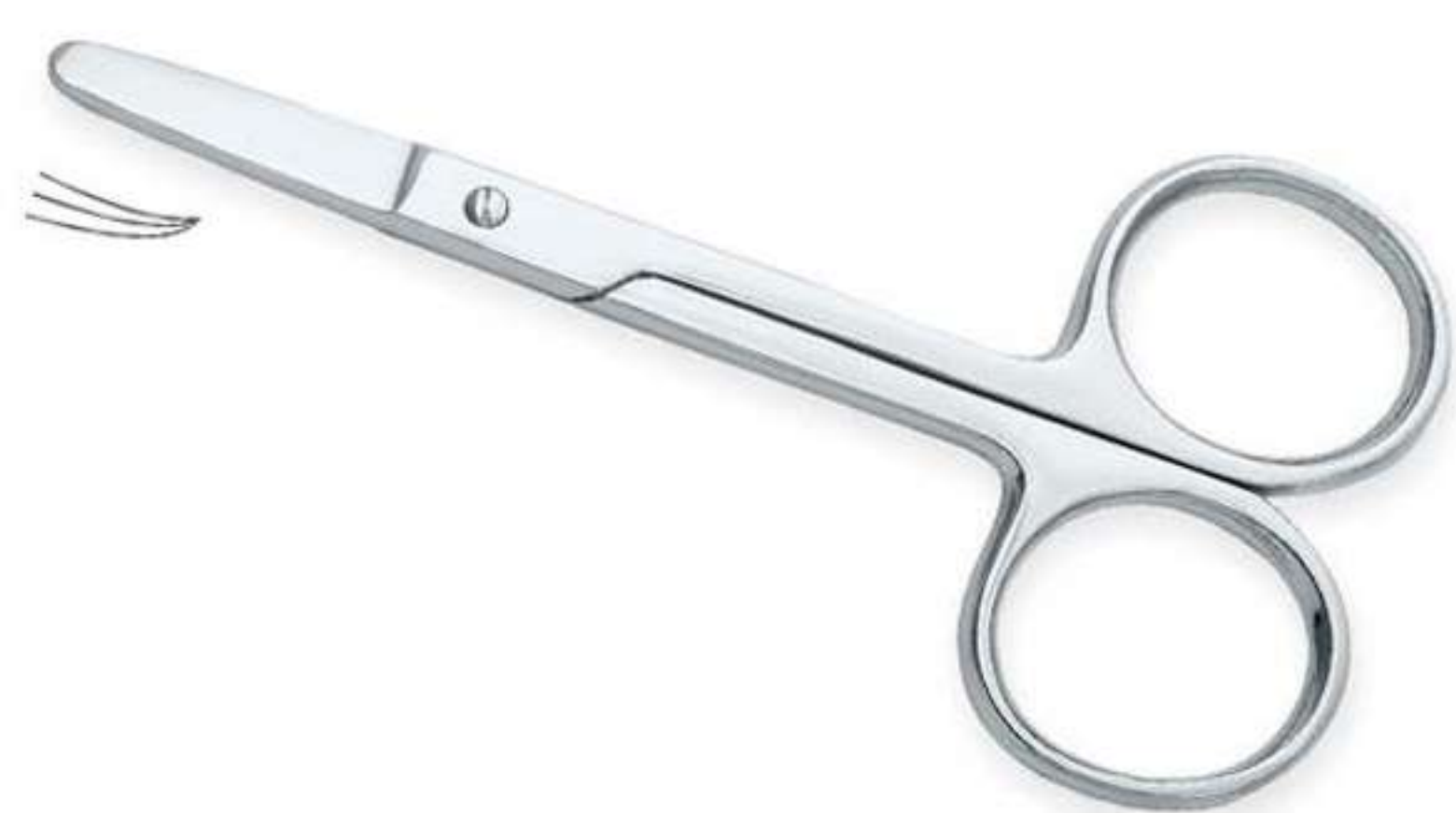
Art no: AS-3-1804

Baby Scissors Curved is designed with rounded tips to babies are not hurt when they move their hands while working on their nails. Designed with precision edges and special stainless which enables its cutting ability last longer.