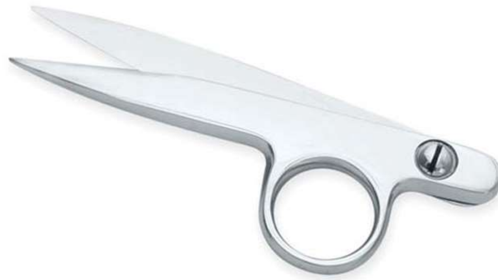
Art no: AS-3-1602

Weaver Scissors is made from high carbon Stainless steel with excellent craftsmanship allow weavers to snip the thread with great ease and comfort, This is one of our best selling embroidery tool