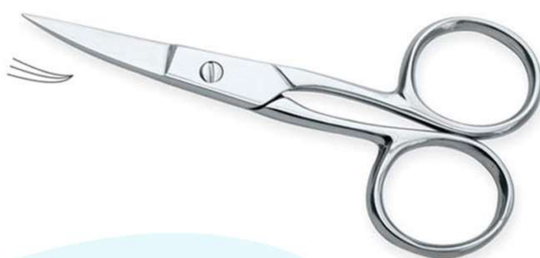
Art no: AS-3-1802

&nbsp;Heavy Duty Nails Scissors are designed for the perfect cut even for the thick and strong nails and this model is also very well received in Embroidery line. Made from Special Stainless steel gives it long lasting cutting ability.