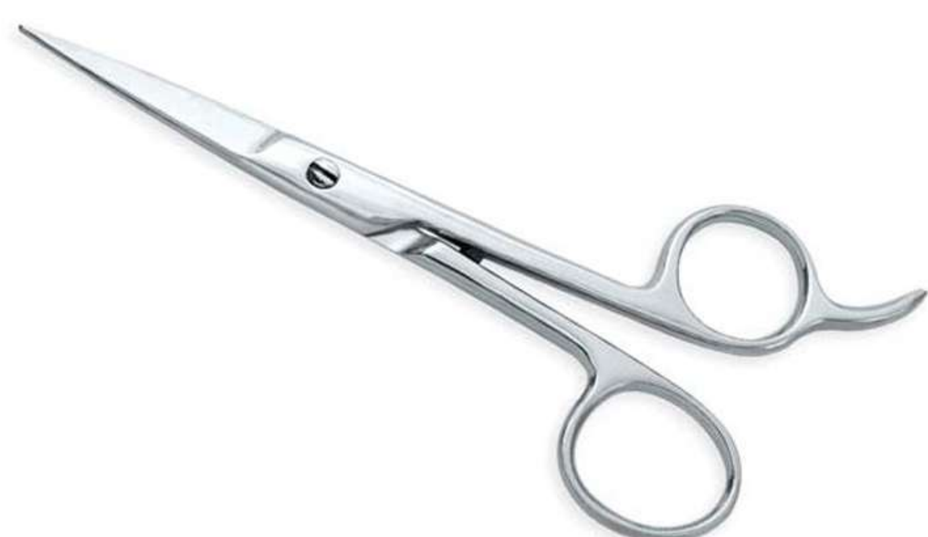
Art no: AS-3-1307

Made from Selected steel and machined to perfection for smooth thinning operation with 22 teeth double blade thinning Scissors without finger rest.