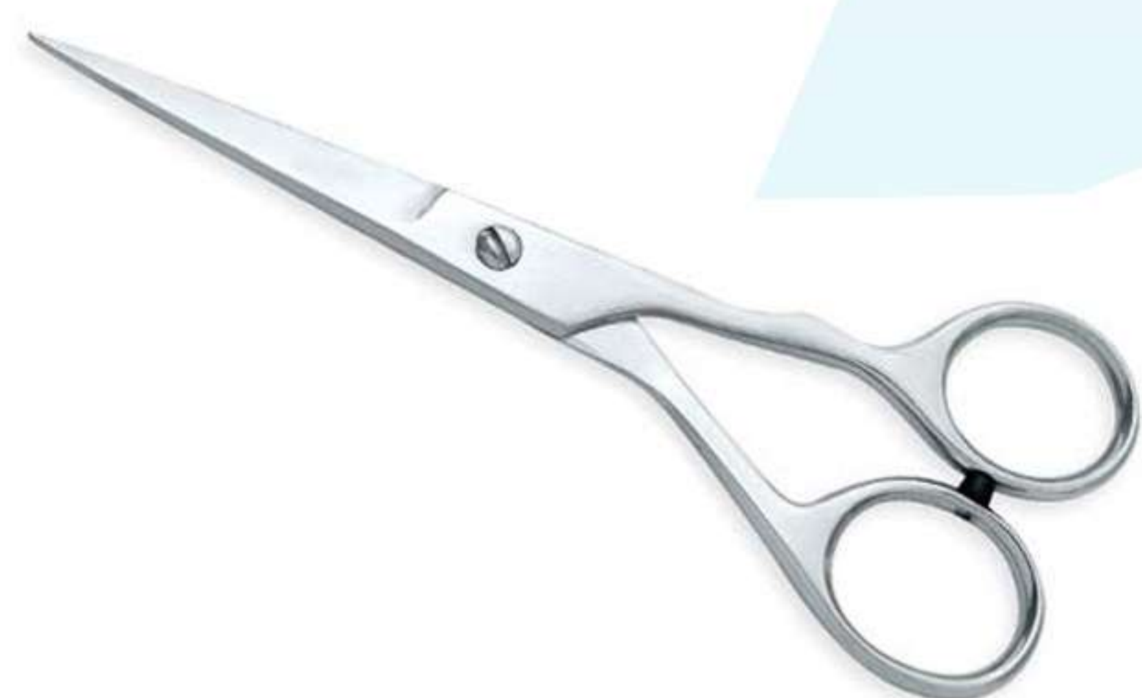
Art no: AS-3-1210

• Made from selected steel and crafted to perfection for smooth operation and sharpness with one blade micro serrated, No finger rest, This is ideal model for people looking for smaller blades in Economy Scissors.