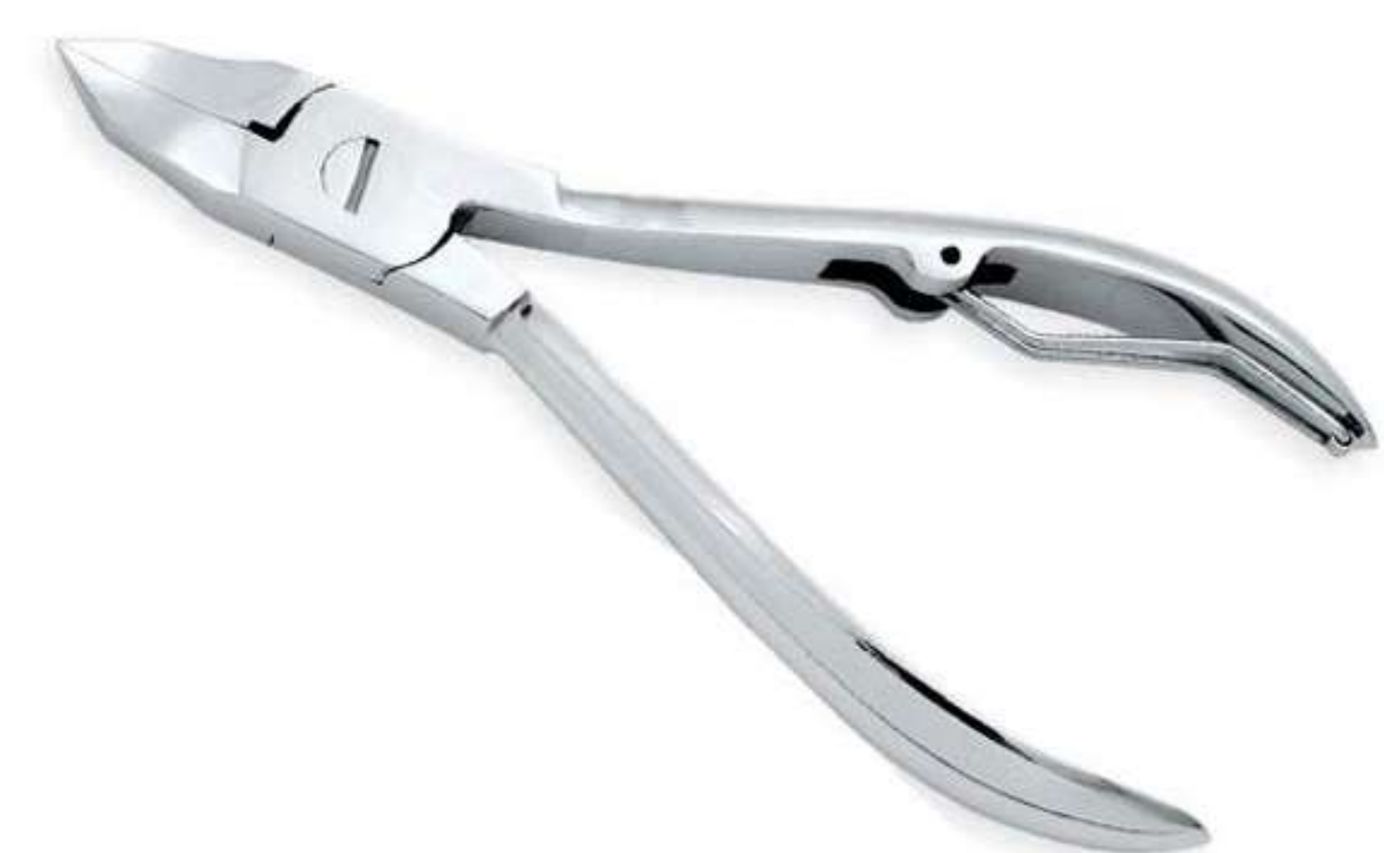
Art no: MS-3-2130

Forged from Surgical Grade Stainless Steel with Lap Joint, Single Wire Spring and fine point for professional work