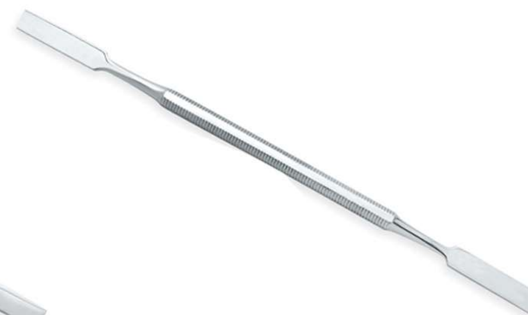
Art no: AS-3-2306

Cuticle Pushers Double Ended made of surgical grade stainless steel of Japanese origin makes these tools truly professional and surgical grade allows you to sterilize these after every use.