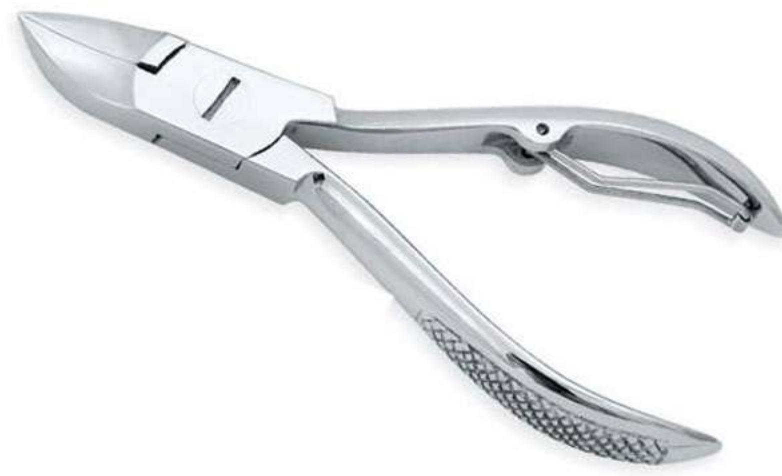
Art no: AS-3-2108

Forged from Surgical Grade Stainless Steel with Lap Joint, Single wire Spring and serrated handles for grip.