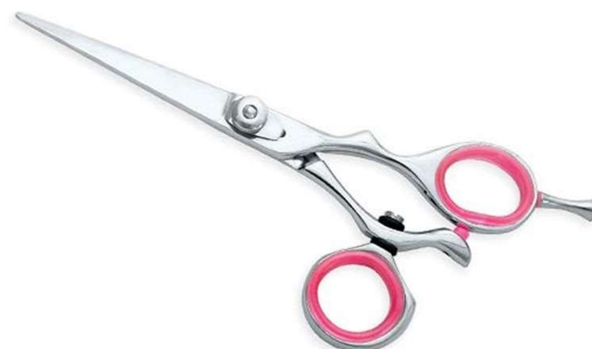
Art no: AS-3-1009

Available in Stainless steel AISI 420 or 440 with hollow ground inner blades and Convex edge, Its modern design for people like to try different models. Available Options Size 5.75"