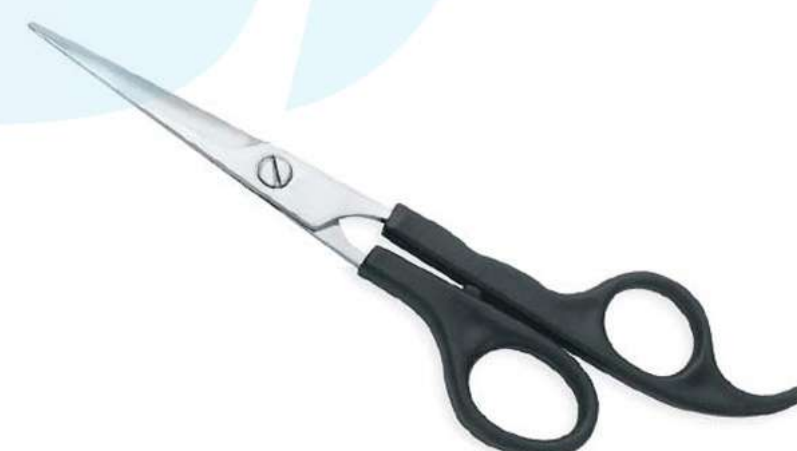
Art no: AS-3-1218

&nbsp;Barber Scissors with Plastic handle one blade micro serrated. <div>&nbsp;</div> Available Options Size 5.5" 6" 6.6" 7" 7.5".