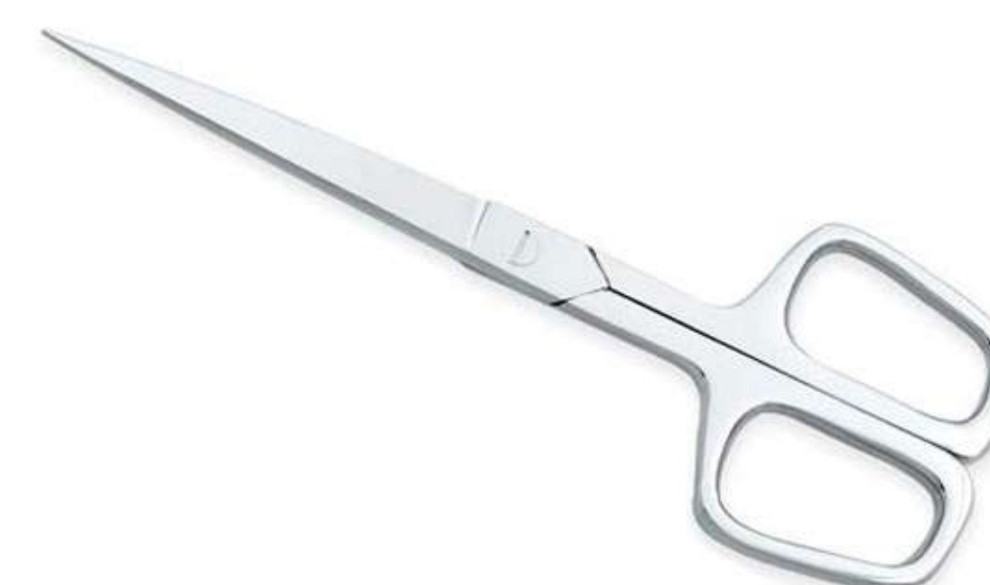
Art no: AS-3-1703

Paper Scissors with two pointed blades is available in Size 7"; for various uses at home or for the industrial purpose. This Scissors is made out of high carbon Stainless Steel alloy which gives it long lasting sharpness