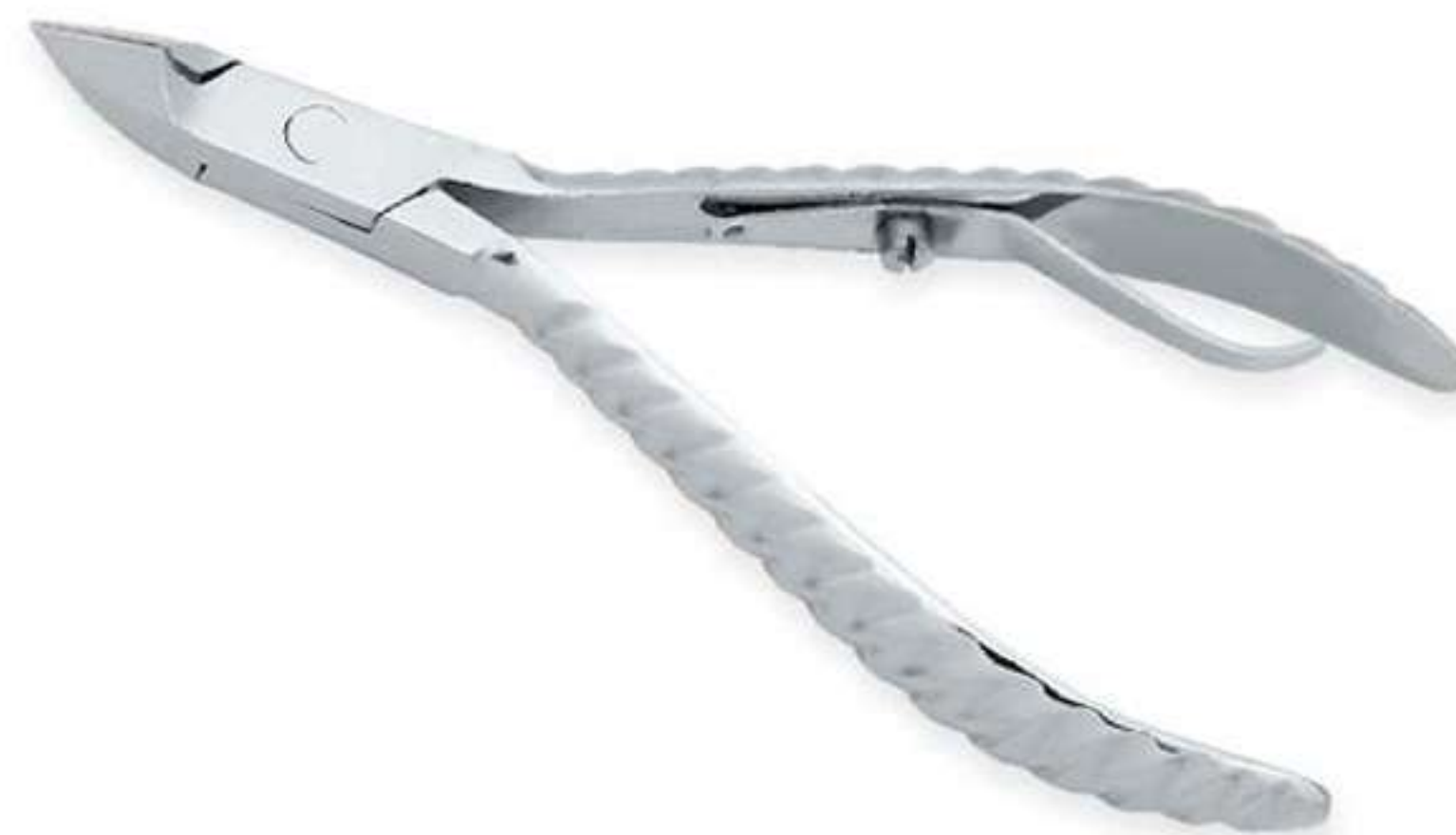
Art no: AS-3-2120

Forged from Surgical Grade Stainless Steel with Lap Joint, Single Wire Spring and light handles for smooth operations Available Options Size 5"