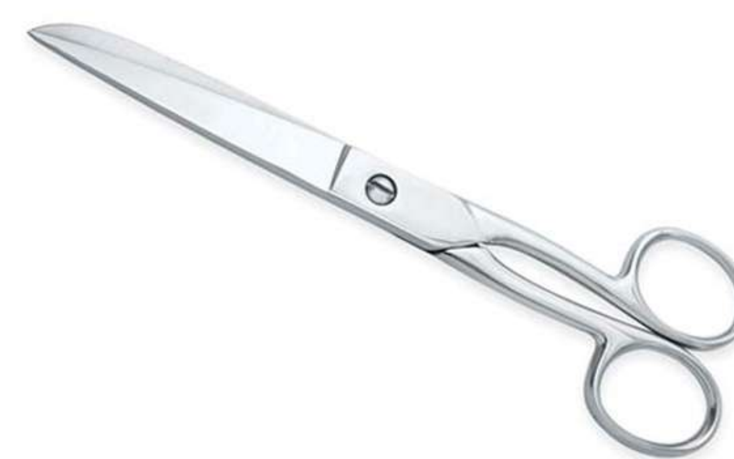
Art no: AS-3-1706