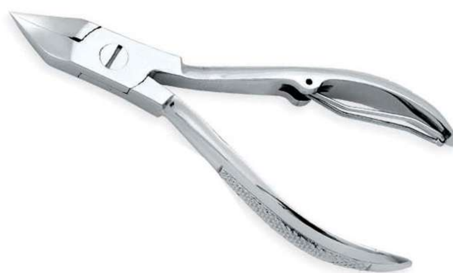
Art no: MS-3-2129

Forged from Surgical Grade Stainless Steel with Lap Joint, Single Wire Spring and fine point for professional work