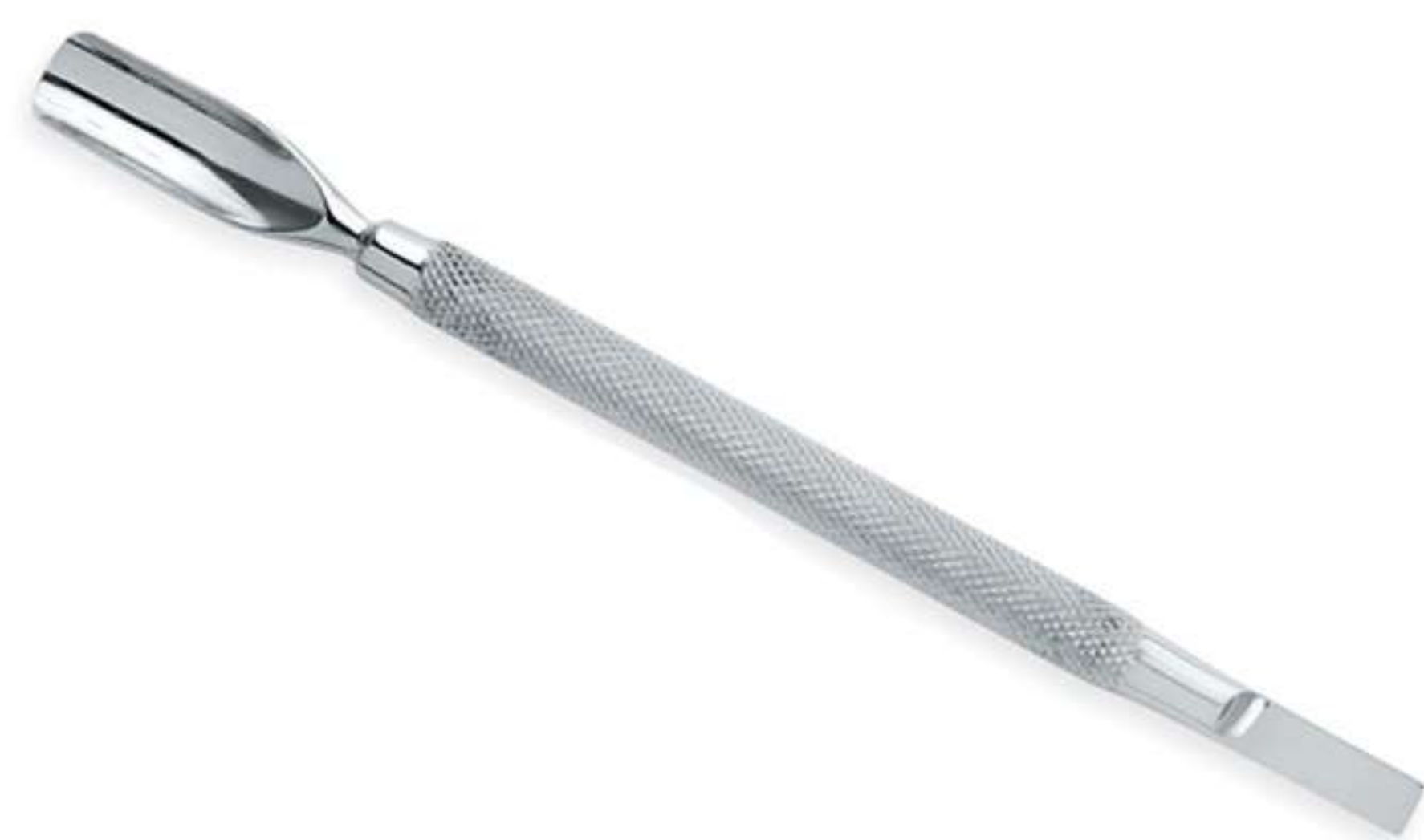
Art no: AS-3-2304

Cuticle Pushers Double Ended made of surgical grade stainless steel of Japanese origin makes these tools truly professional and surgical grade allows you to sterilize these after every use.