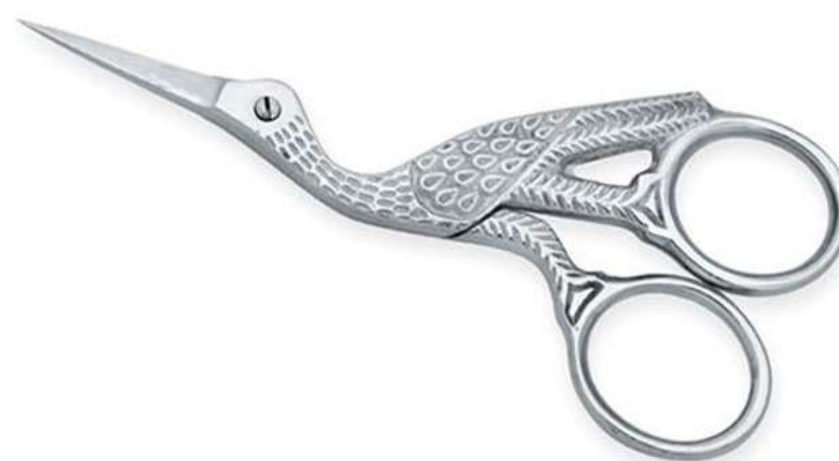
Art no: AS-3-1605

Classic model of Embroidery Scissors has passed the test of time and still is one of the best selling models for the range of Embroidery Scissors . This Classic model is made from Special Steel alloy which allows excellent smoothness and long lasting sharpness.