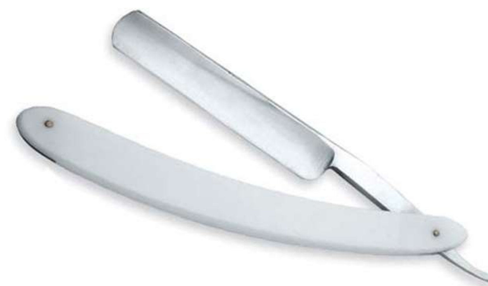
Art no: AS-3-1508

Fixed blade razors with narrow blade with plastic handles. Wooden handles can also be supplied on request.