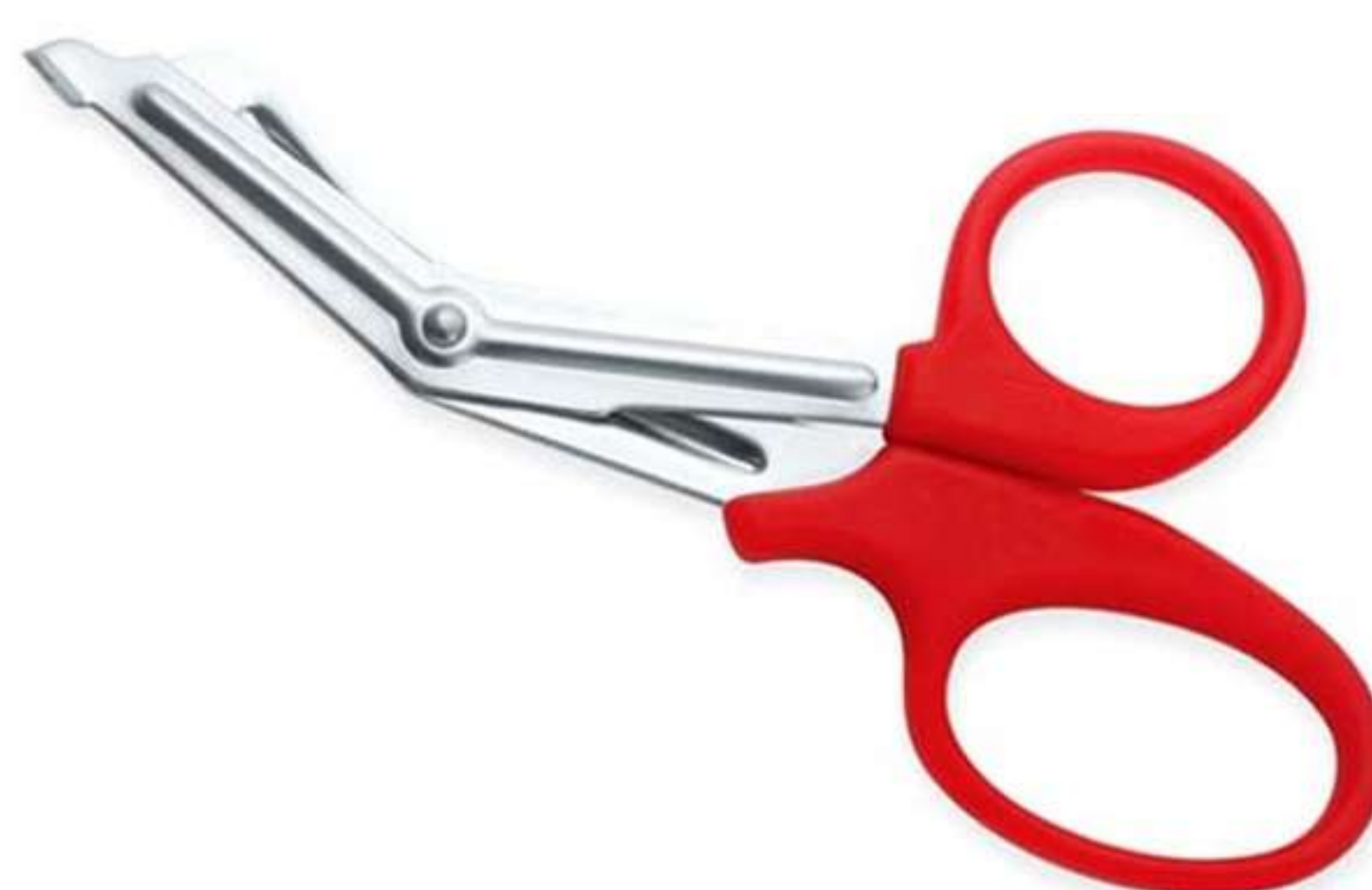
Art no: AS-3-1802

Blades of this utility Scissors are made out of high Carbon Japanese Stainless Steel Sheet and handles with Plastic, One blade micro serrated makes these Scissors perfect to cut anything from paper to heavy cloth or bandage in case of any emergency. Available Options Size 6"