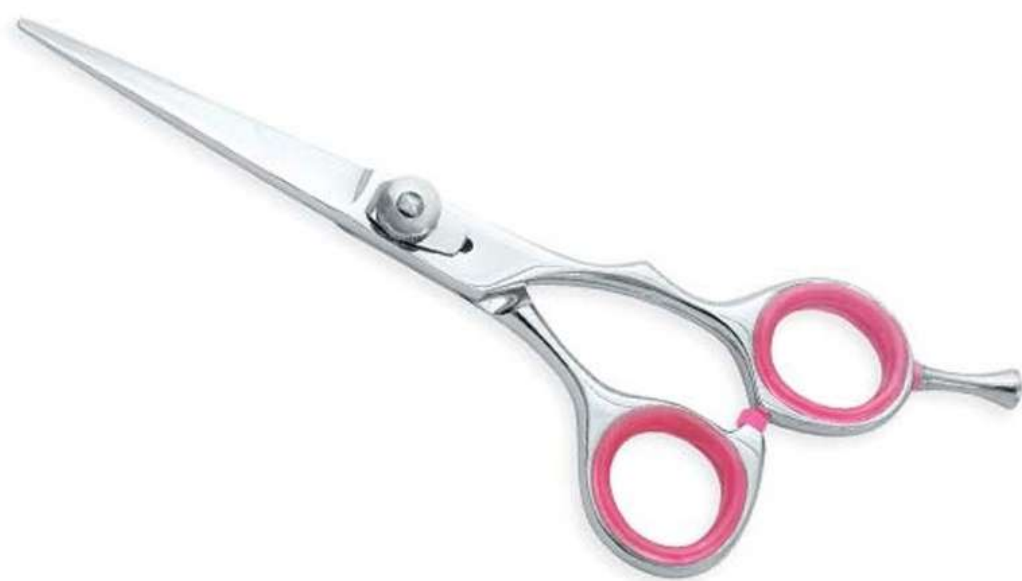
Art no: AS-3-1022

Available in Stainless steel AISI 420 or 440 with hollow ground inner blades and Convex edge, One of our best seller in conventional models, ideal for a smooth cut.