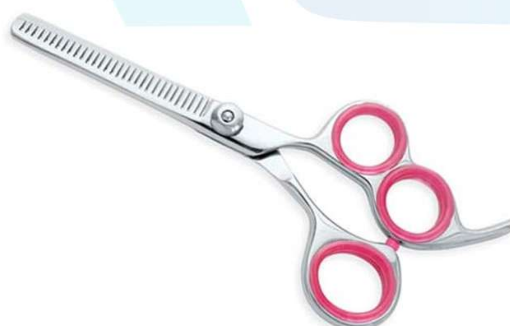
Art no: AS-3-1105

Available in Stainless steel AISI 420 or 440 with hollow ground inner blades and Convex edge, single blade 8 teeth texturing scissors.