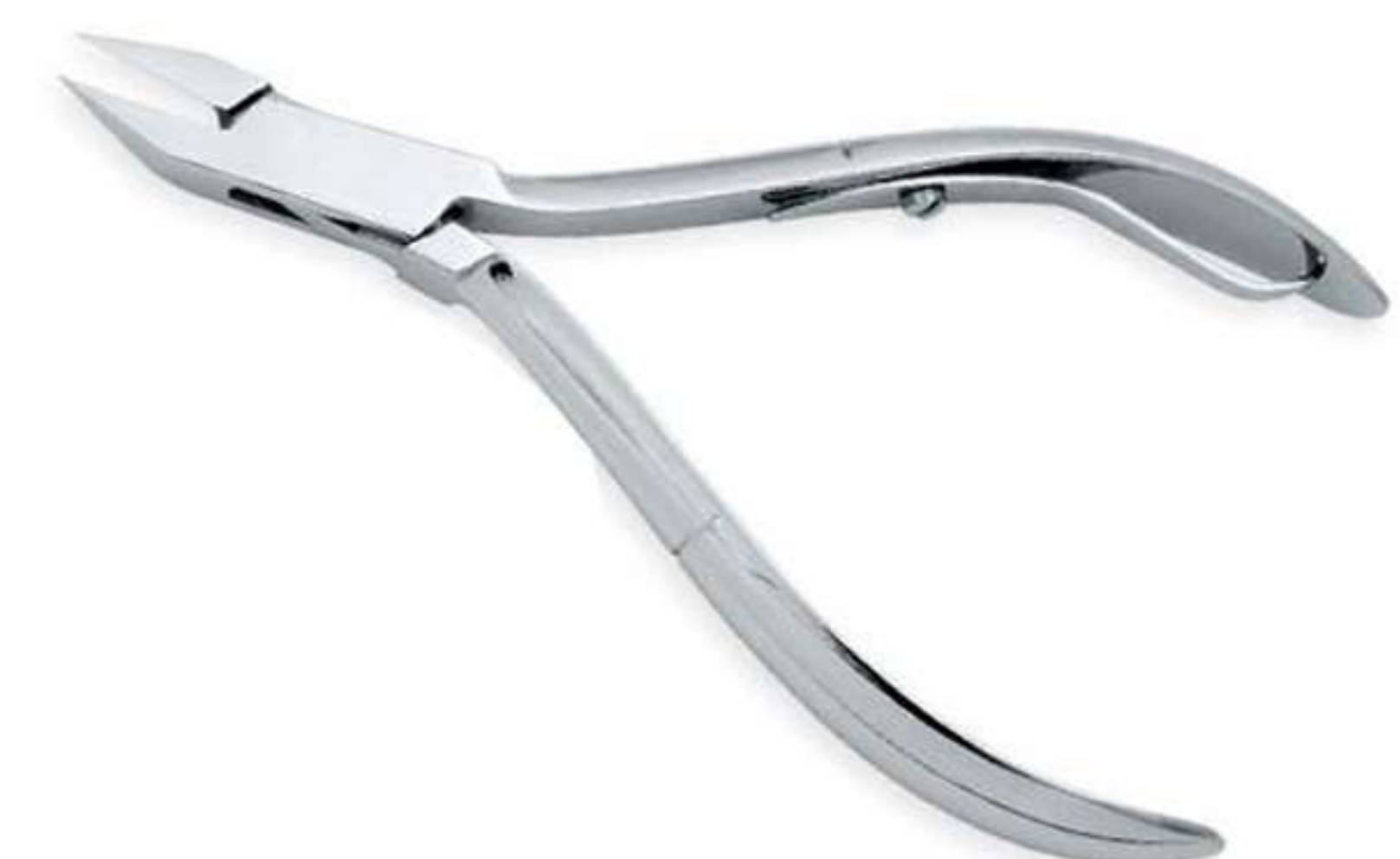
Art no: AS-3-2106

Forged from Surgical Grade Stainless Steel with Box Joint, double Sheet Springs for smooth operation and ideal for professional pedicure work. Available Options Size 5.5"