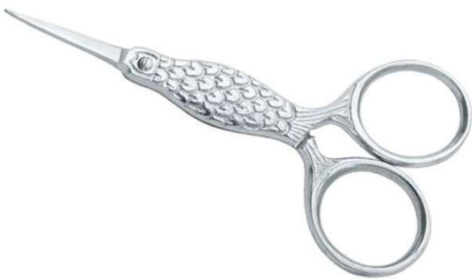
Art no: AS-3-1613

Beautiful design and excellent working ability is one of the features of our range of Fancy Scissors which are made out of Special Steel for long lasting cutting ability