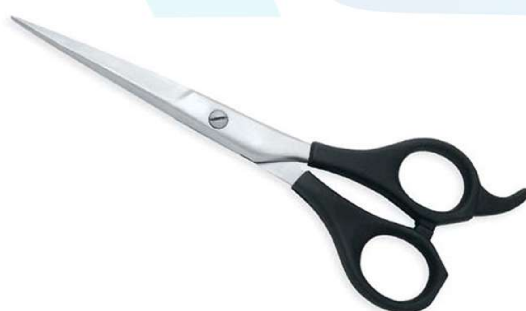
Art no: AS-3-1405

&nbsp;This model of our Barber Scissors with One Blade Micro serrated with Forged Blades instead of Sheet blades is really smooth and provides a good gripe for the barbers. Available Options Size 6"