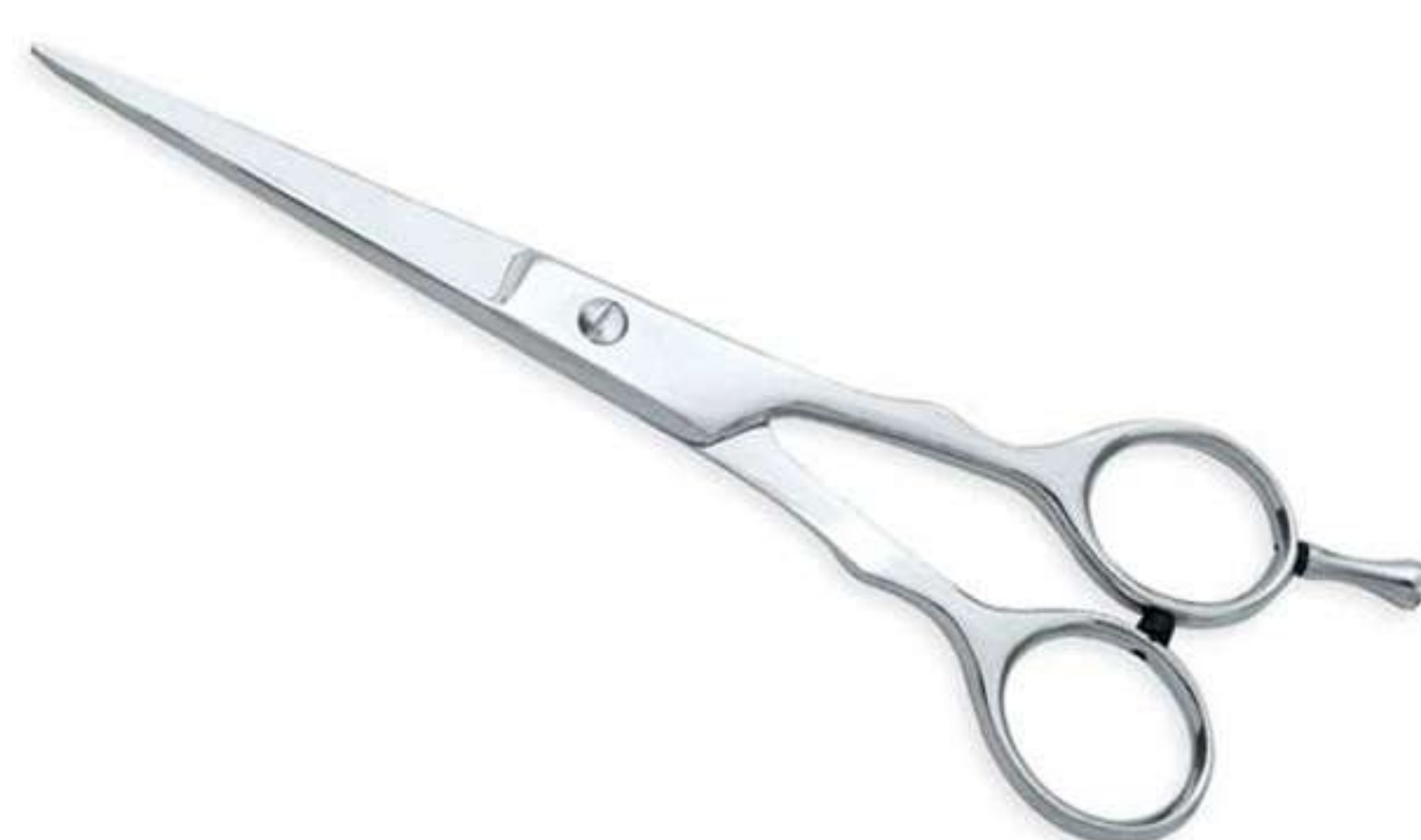
Art no: AS-3-1214

&nbsp;Made from selected steel and crafted to perfection for smooth operation and sharpness with one blade micro serrated, No finger rest, This is ideal model for people looking for Economic Scissors with classic models. Available Options Size 6.5"