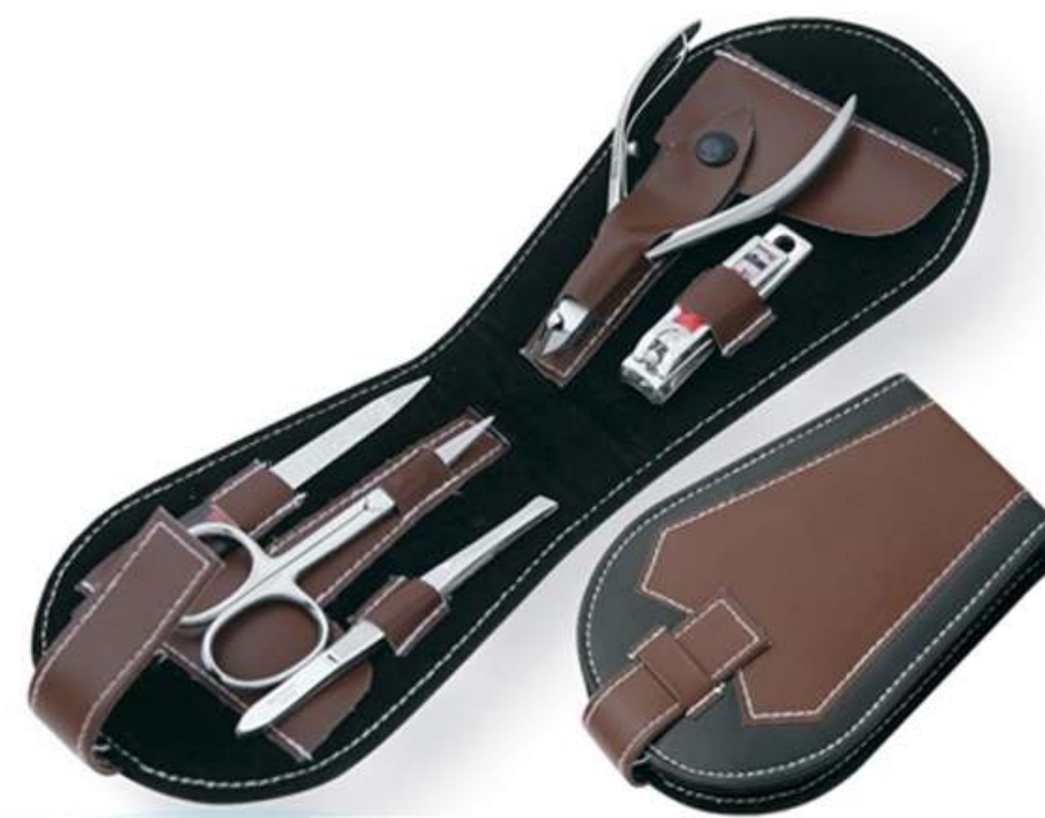
Art no: AS-3-2214

Manicure Set Contains:<br /> Nail Nippers<br /> Cuticle Nippers # 911<br /> Nail Scissors # 858<br /> Cuticle Pusher # 144<br />