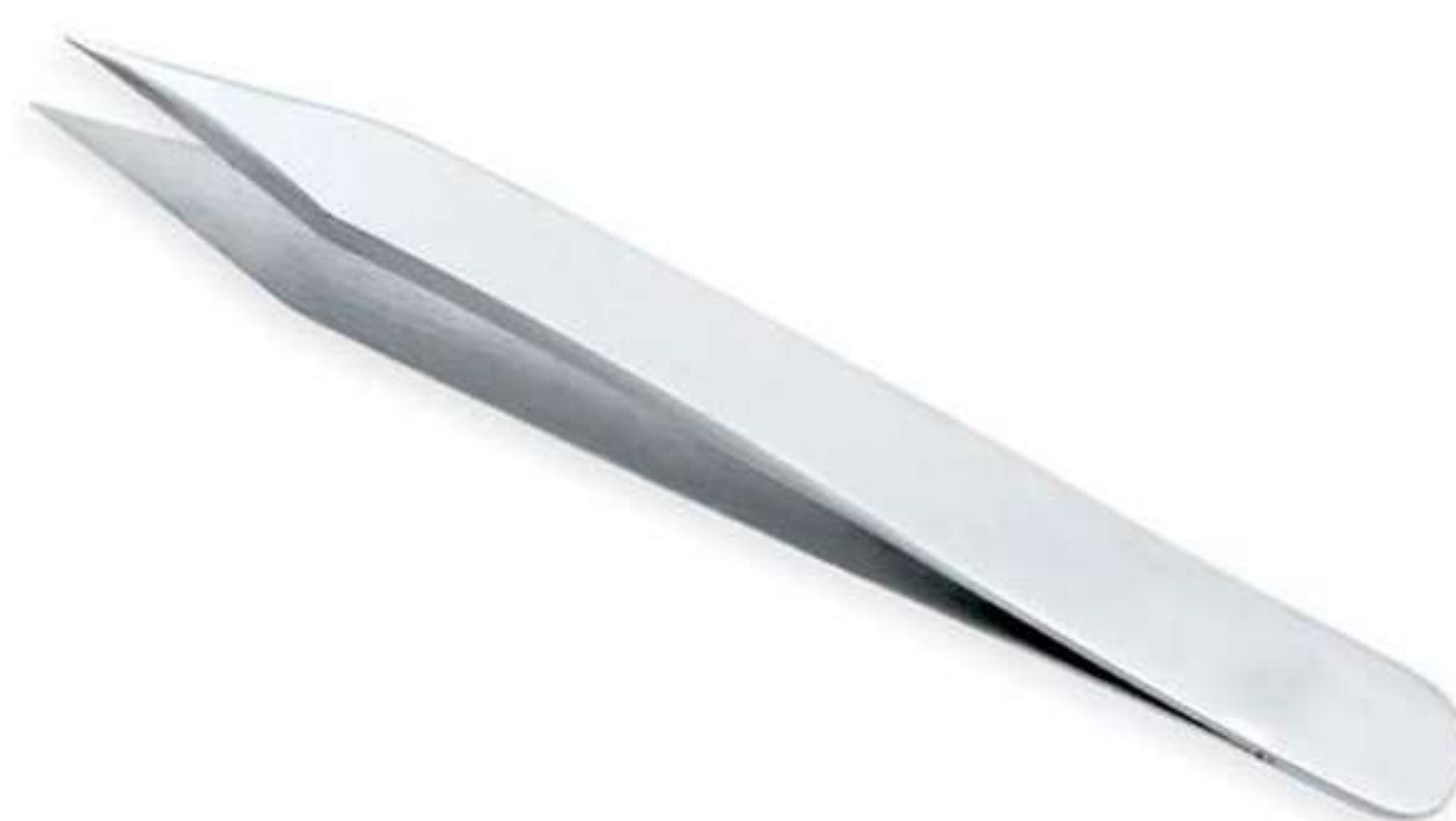
Art no: AS-3-1911

&nbsp;Eye Brow Tweezers Available Options Size 3.5"