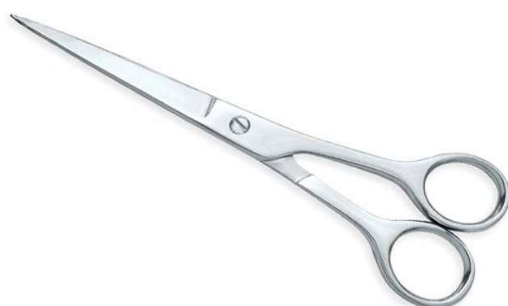
Art no: AS-3-1302

Made from Selected steel and machined to perfection for smooth thinning operation with 22 teeth single blade thinning Scissors: Available Options Size 6"