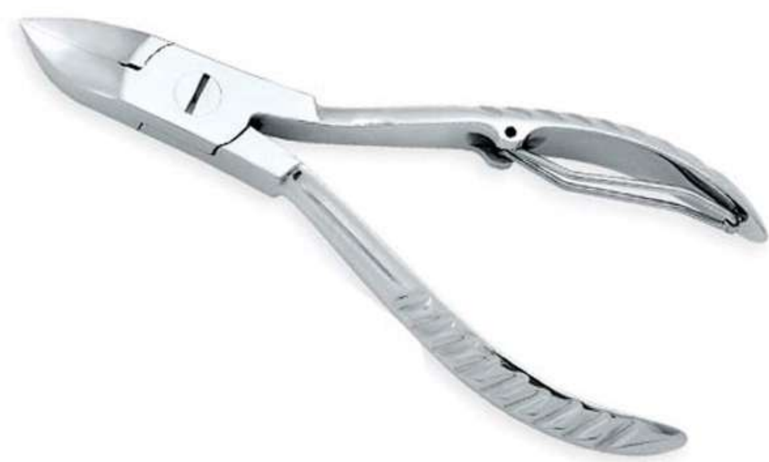
Art no: MS-3-2128

Forged from Surgical Grade Stainless Steel with Lap Joint, Single Wire Spring with serrated handles for Grip