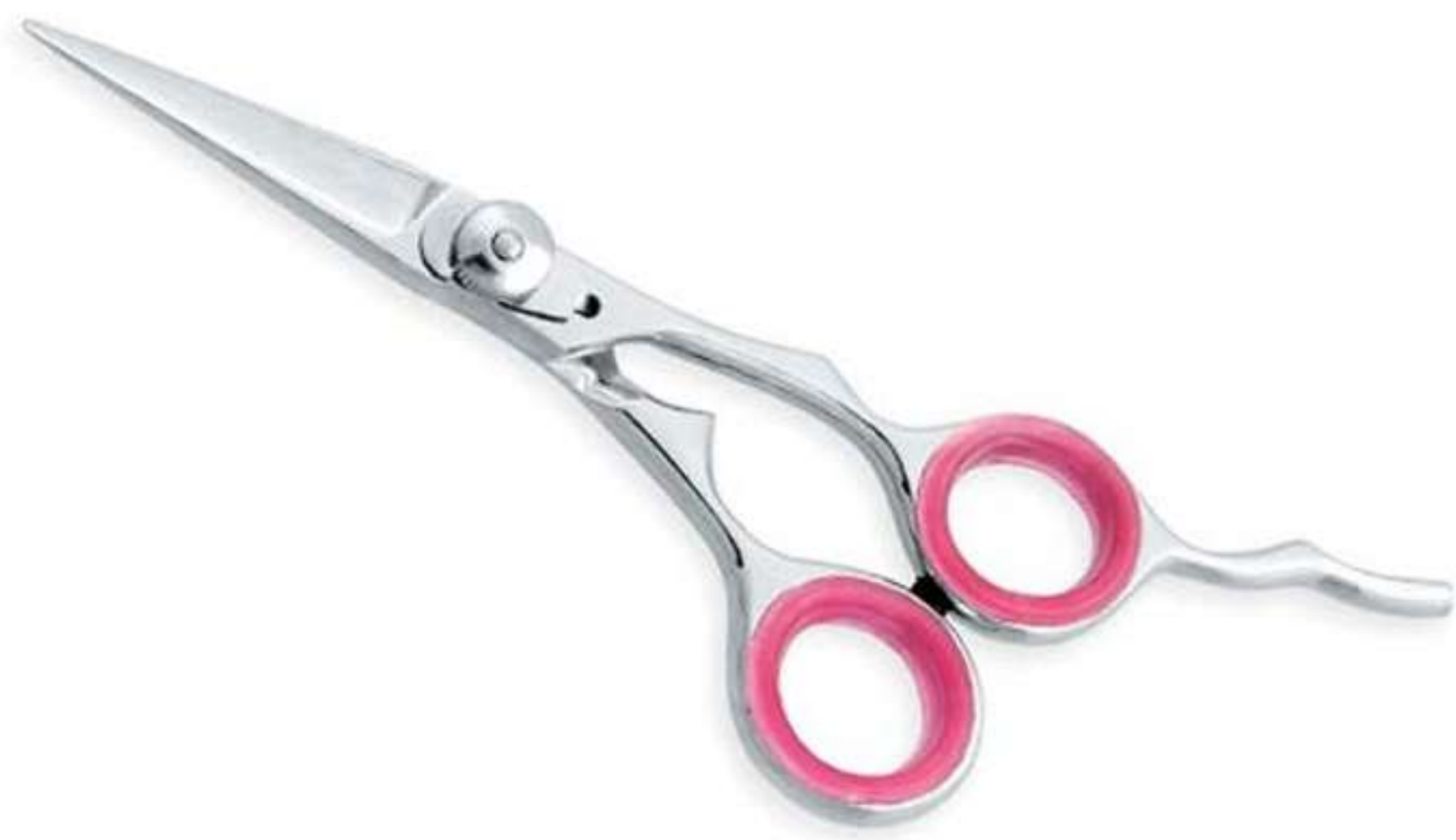
Art no: AS-3-1019

Available in Stainless steel AISI 420 or 440 with hollow ground inner blades and Convex edge, with double fixed finger rest for stylists who prefer longer finger rest and small cutting blades.