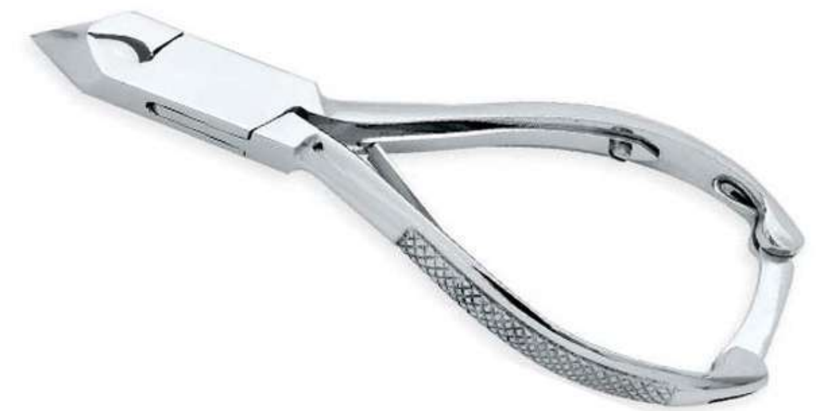
Art no: MS-3-2127

Forged from Surgical Grade Stainless Steel with Box Joint, Double Sheet Spring, Lock back handles for professional work.