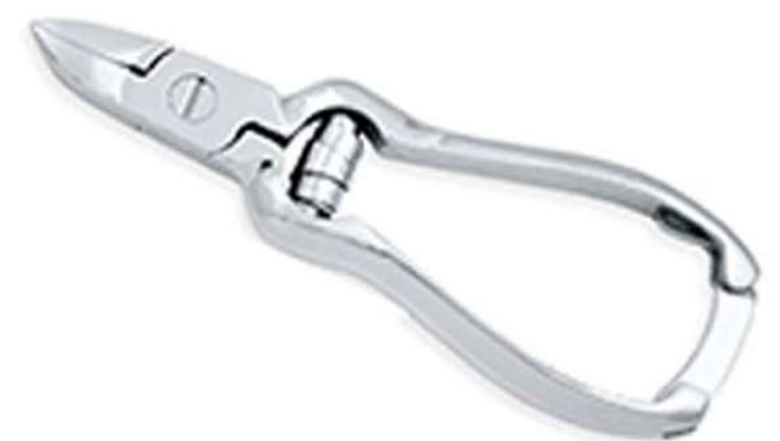
Art no: AS-3-2112

Forged from Surgical Grade Stainless Steel with Lap Joint, Barrel Sheet Spring.