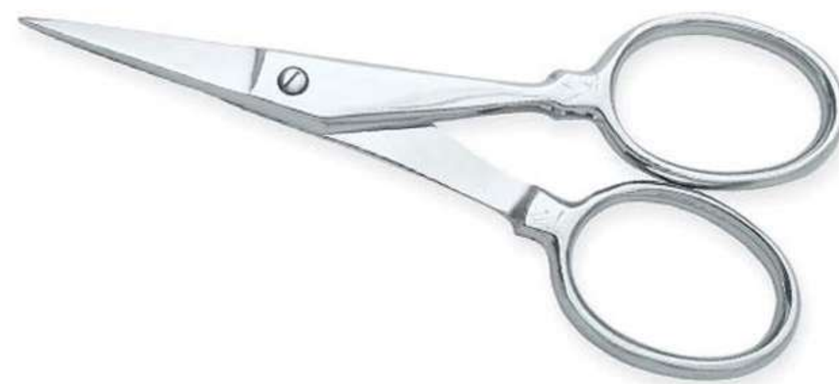
Art no: AS-3-1620

Beautiful design and excellent working ability is one of the features of our range of Fancy Scissors which are made out of Special Steel for long lasting cutting ability.