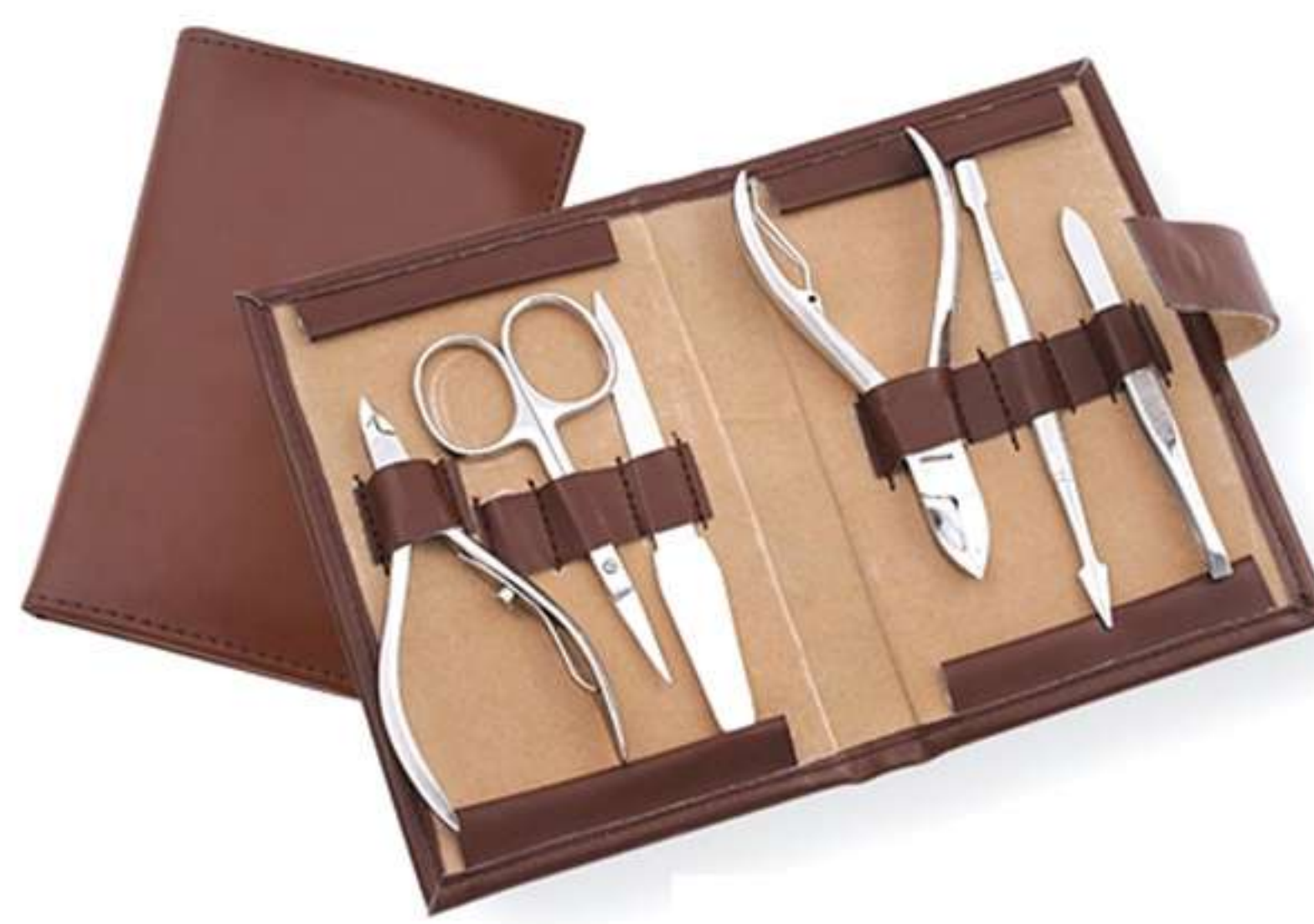
Art no: AS-3-2211

Professional Quality kit with fine quality manicure and pedicure instruments packed in combination of leather, available in different combinations of leather.