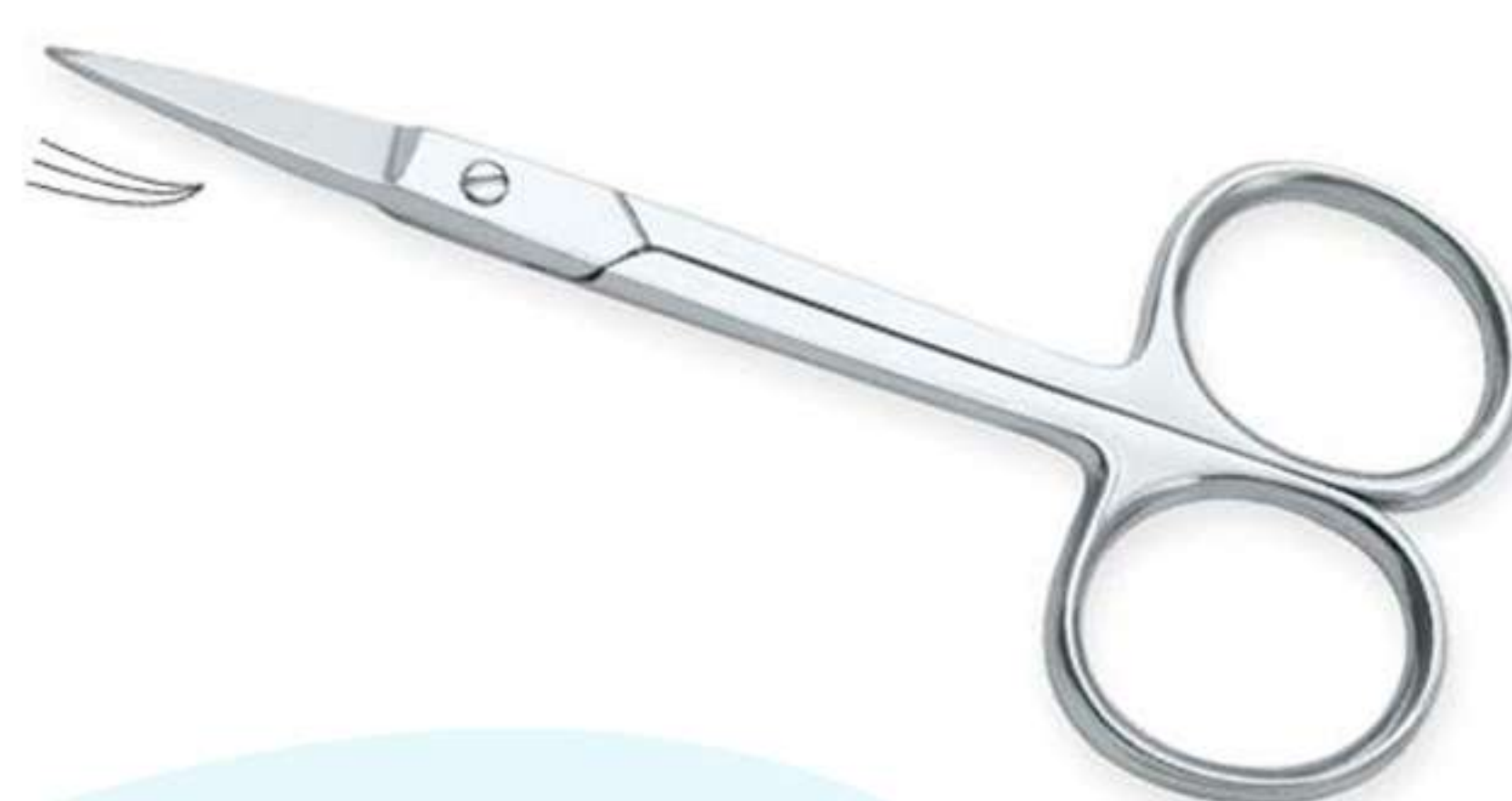
Art no: AS-3-1808

&nbsp;Crown Scissors Curved made out of heavy Sheet of Special alloys Steel gives it the strength needed to cut hard foot nails with great perfection and control Available Options Size 4½"