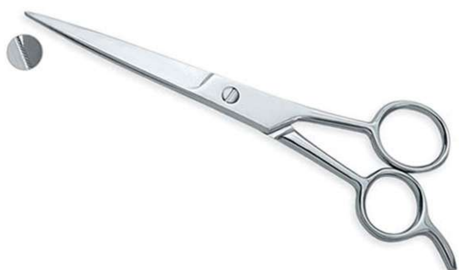
Art no: AS-3-1304

Made from Selected steel and machined to perfection for smooth thinning operation with 24 teeth single blade thinning Scissors: Available Options Size 6"