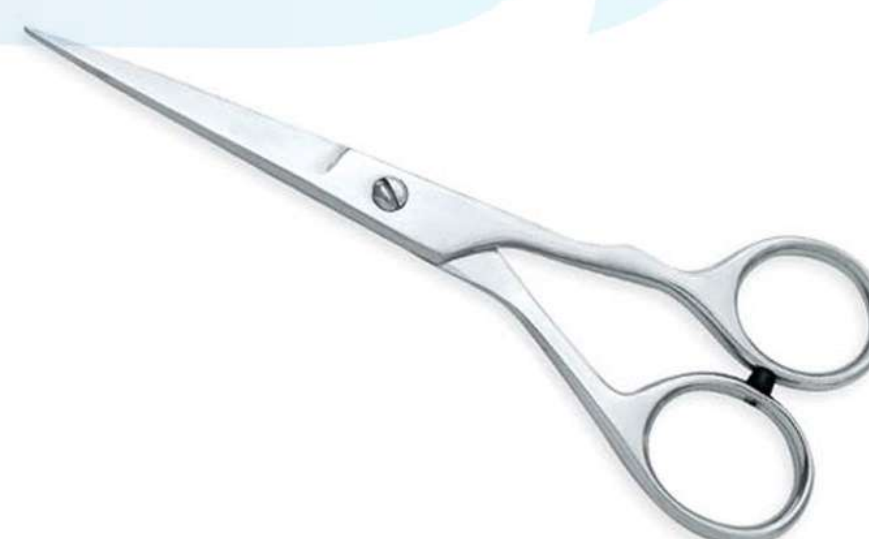
Art no: AS-3-1310

Made from Selected steel and machined to perfection for smooth thinning operation with 34 teeth double blade thinning Scissors with finger rest.