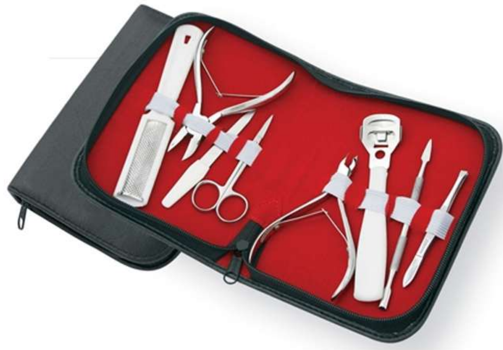
Art no: AS-3-2207

Essential for every manicure & pedicure professional, packing available in different colors of velvet and leather pouches