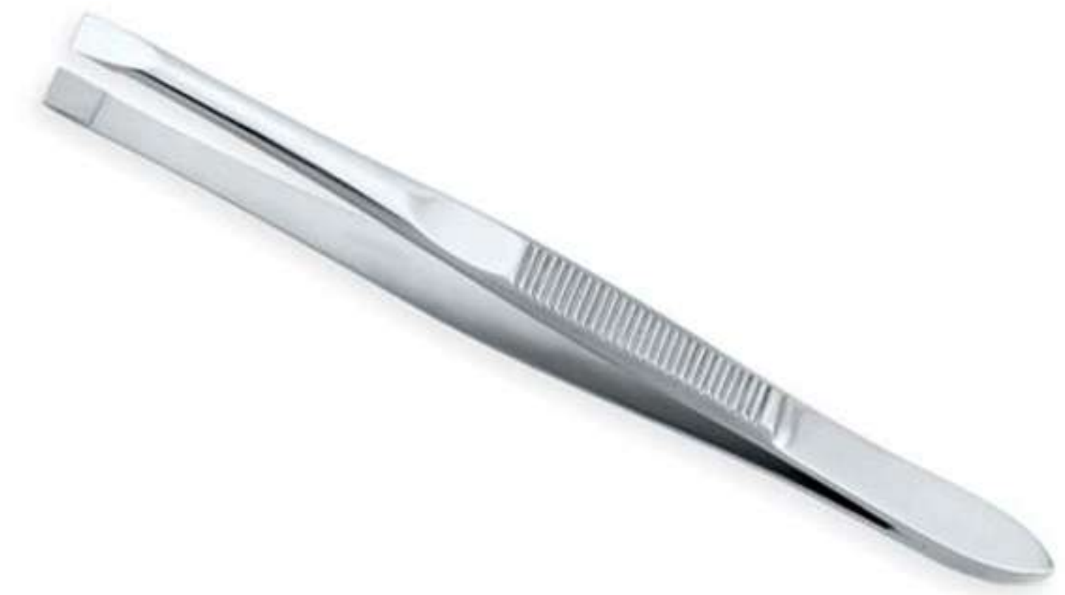
Art no: AS-3-1903

&nbsp;With texture on handles for grip Available Options Size 3" 3.5" 4"