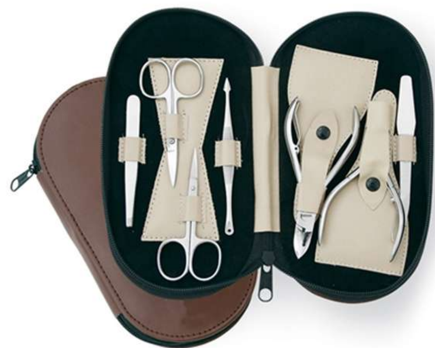
Art no: AS-3-2205

Professional Quality kit with fine quality manicure and pedicure instruments packed in combination of leather, available in different combinations of leather.<br />