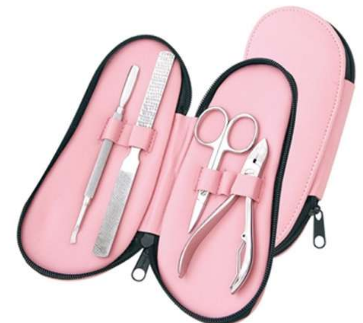
Art no: AS-3-2212

Manicure Set Contains: Tweezers # 920 Pushers # 129 Nail Nippers # 914 Nail File # 105 Cuticle Scissors # 852 Cuticle Nippers # 911