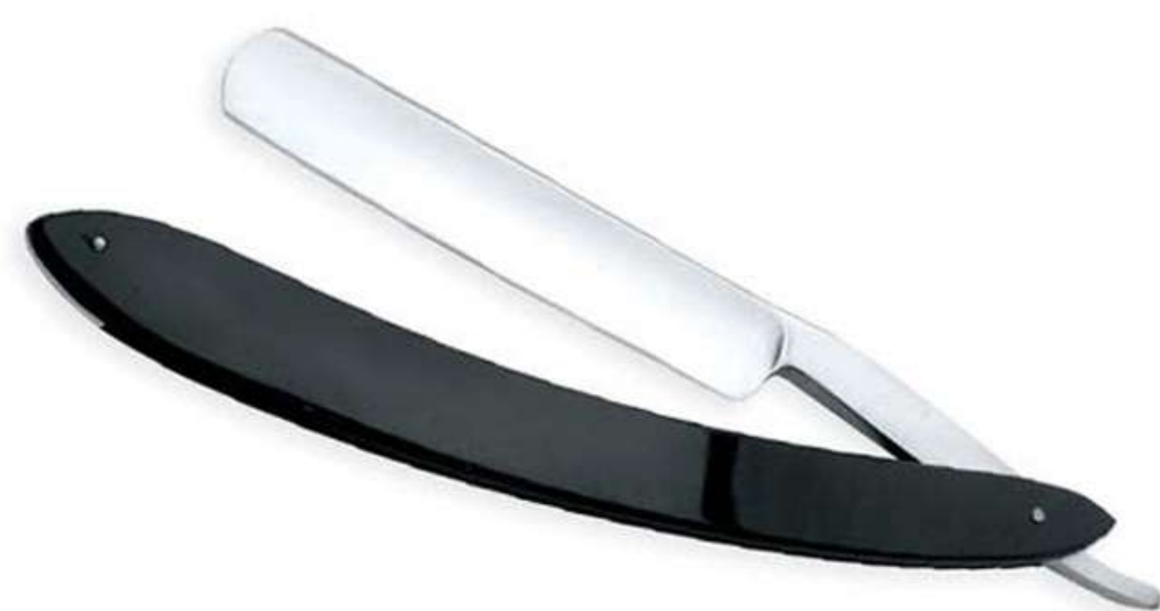
Art no: AS-3-1507

Fixed blade razors with narrow blade with plastic handles. Wooden handles can also be supplied on request.