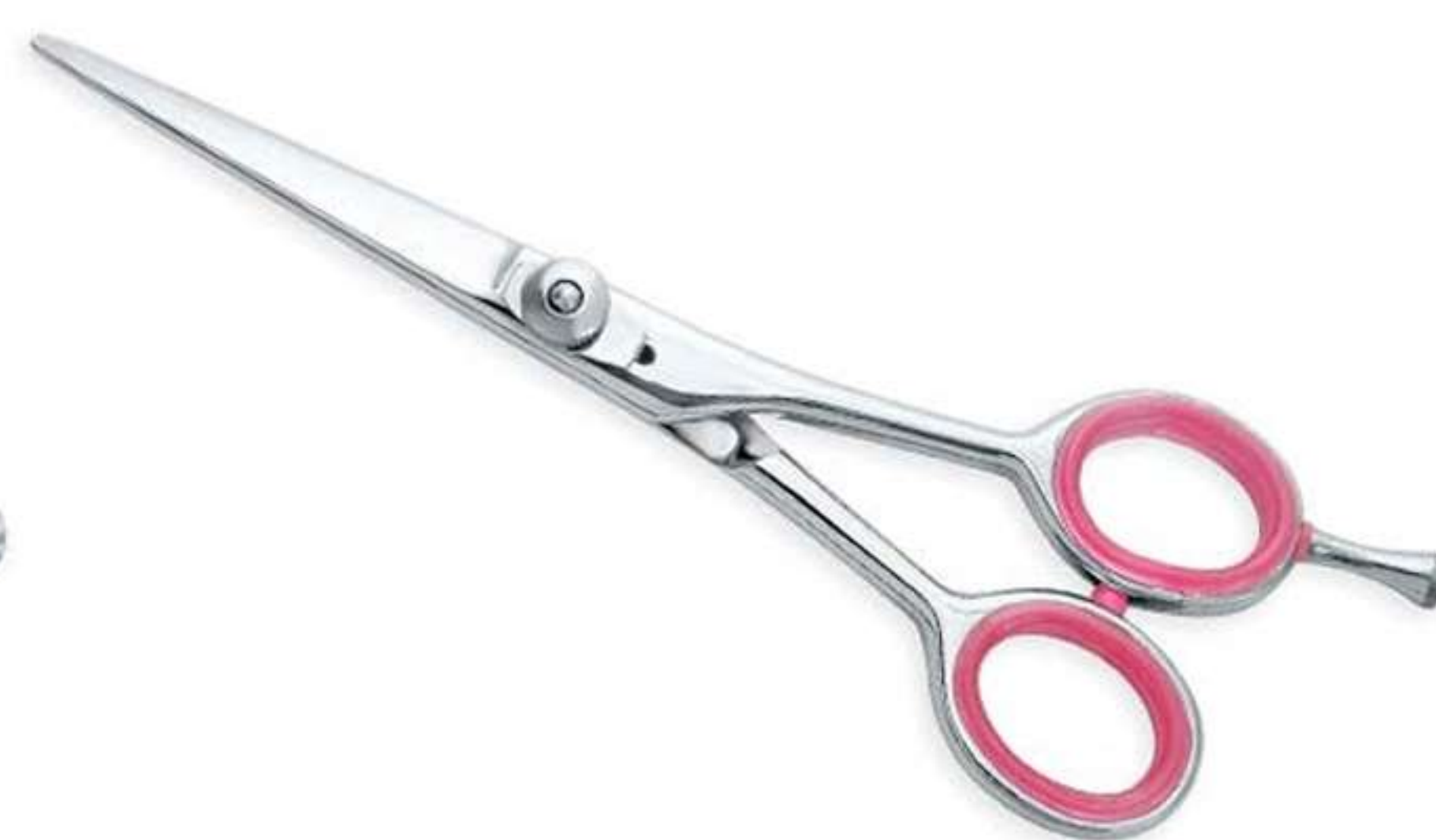
Art no: AS-3-1023

Available in Stainless steel AISI 420 or 440 with hollow ground inner blades and Convex edge, One of our best sellers of all times.