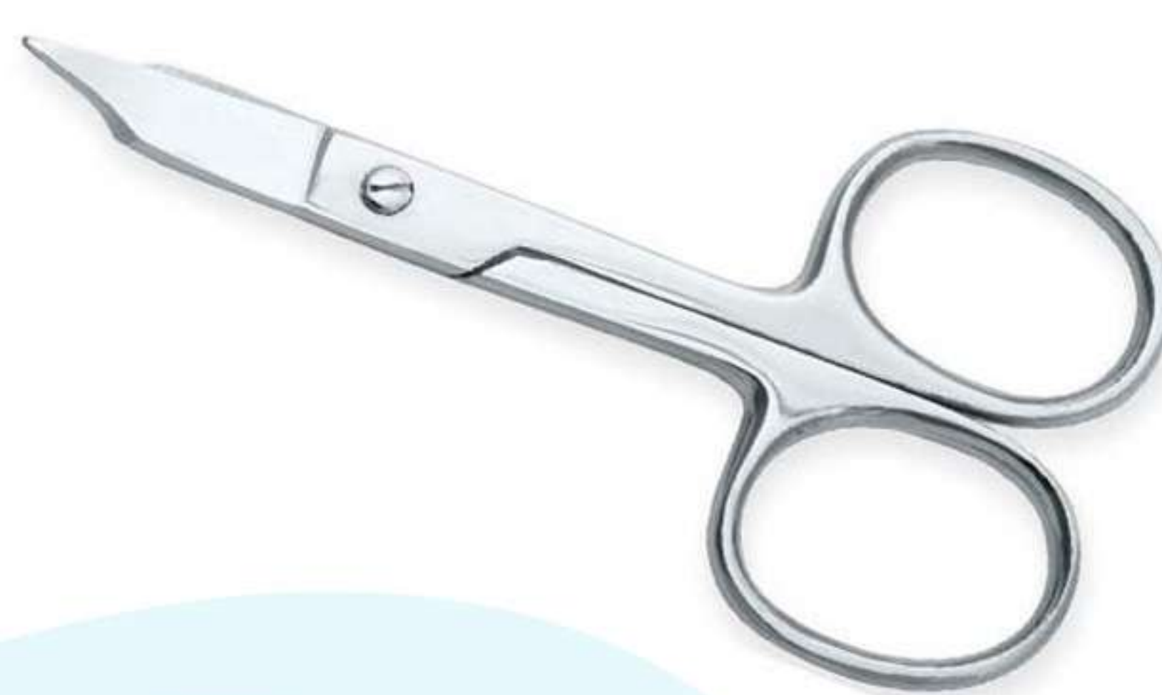
Art no: AS-3-1814

&nbsp;Nail Scissors Curved is also a classic model of Nail Scissors and one of our best sellers. Special grade of stainless steel and excellent craftsmanship makes these scissors last longer and keep them smooth. Available Options Size 3.5"