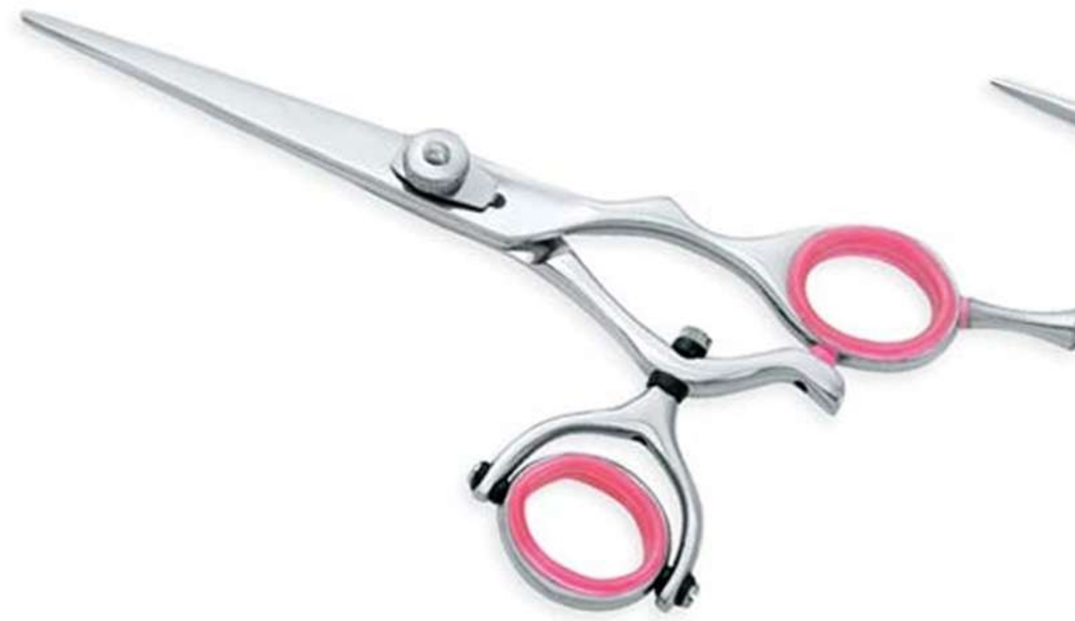
Art no: AS-3-1020

Available in Stainless steel AISI 420 or 440 with hollow ground inner blades and Convex edge, For the people who wants to have 360 degree movement for their stylish work.