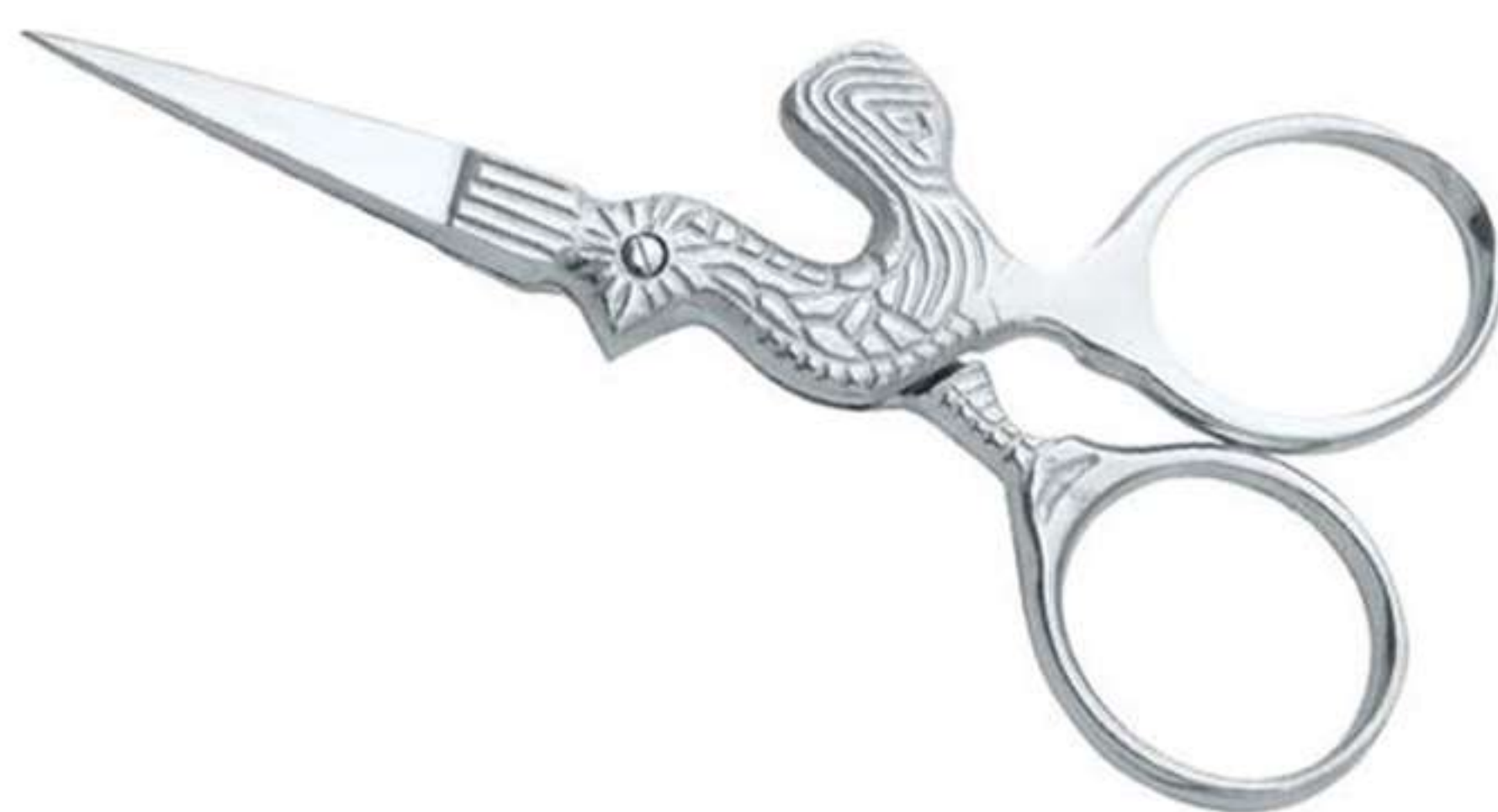
Art no: AS-3-1610

&nbsp;Beautiful design and excellent working ability is one of the features of our range of Fancy Scissors which are made out of Special Steel for long lasting cutting ability. Available Options Size 3½"