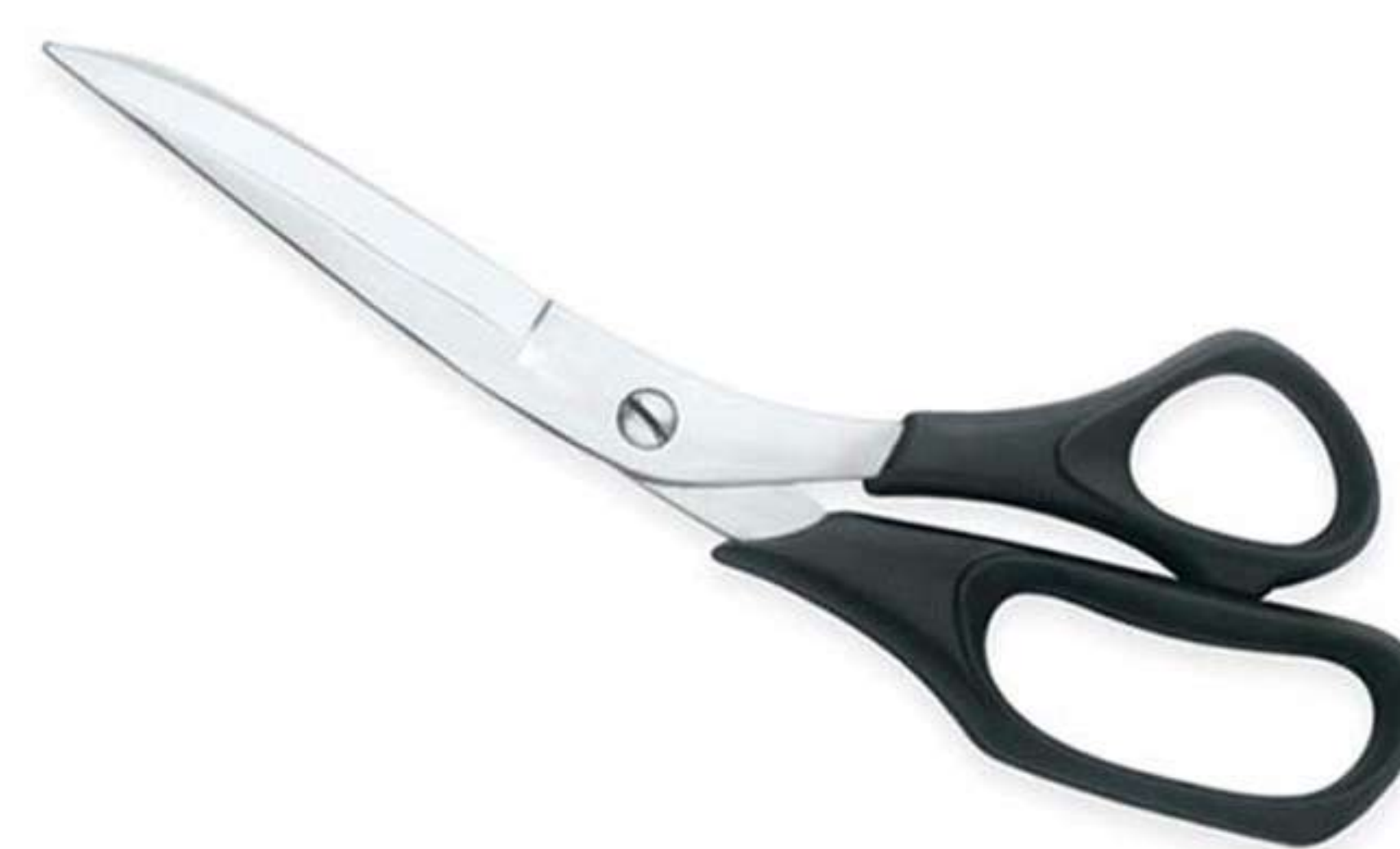
Art no: AS-3-1709

&nbsp;Household Scissors with plastic handle is rather lighter and cheaper option for the household scissors yet it provides excellent cutting ability and long lasting sharpness. Available Options Size 5" 6"