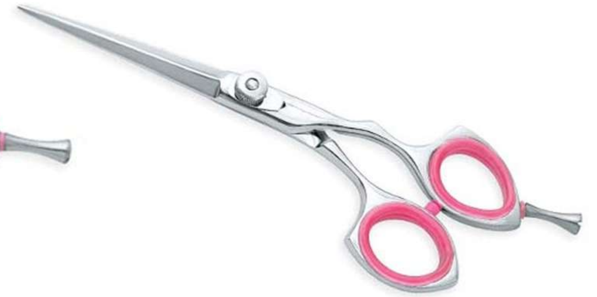
Art no: AS-3-1021

Available in Stainless steel AISI 420 or 440 with hollow ground inner blades and Convex edge, balanced and trendy model for a smooth cut.