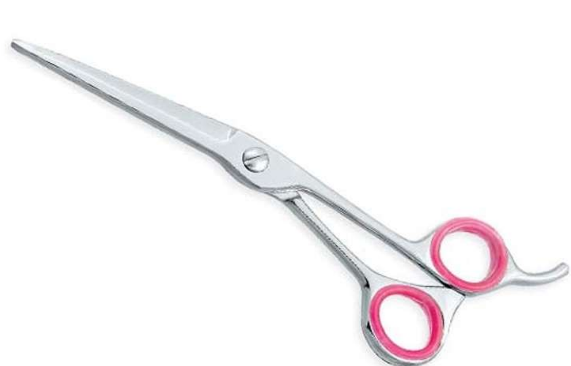
Art no: AS-3-1007

Available in Stainless steel AISI 420 or 440 with hollow ground inner blades and Convex edge, Samurai Sword Type blade shape for smooth creative cut. Available Options Size 6 1/2"