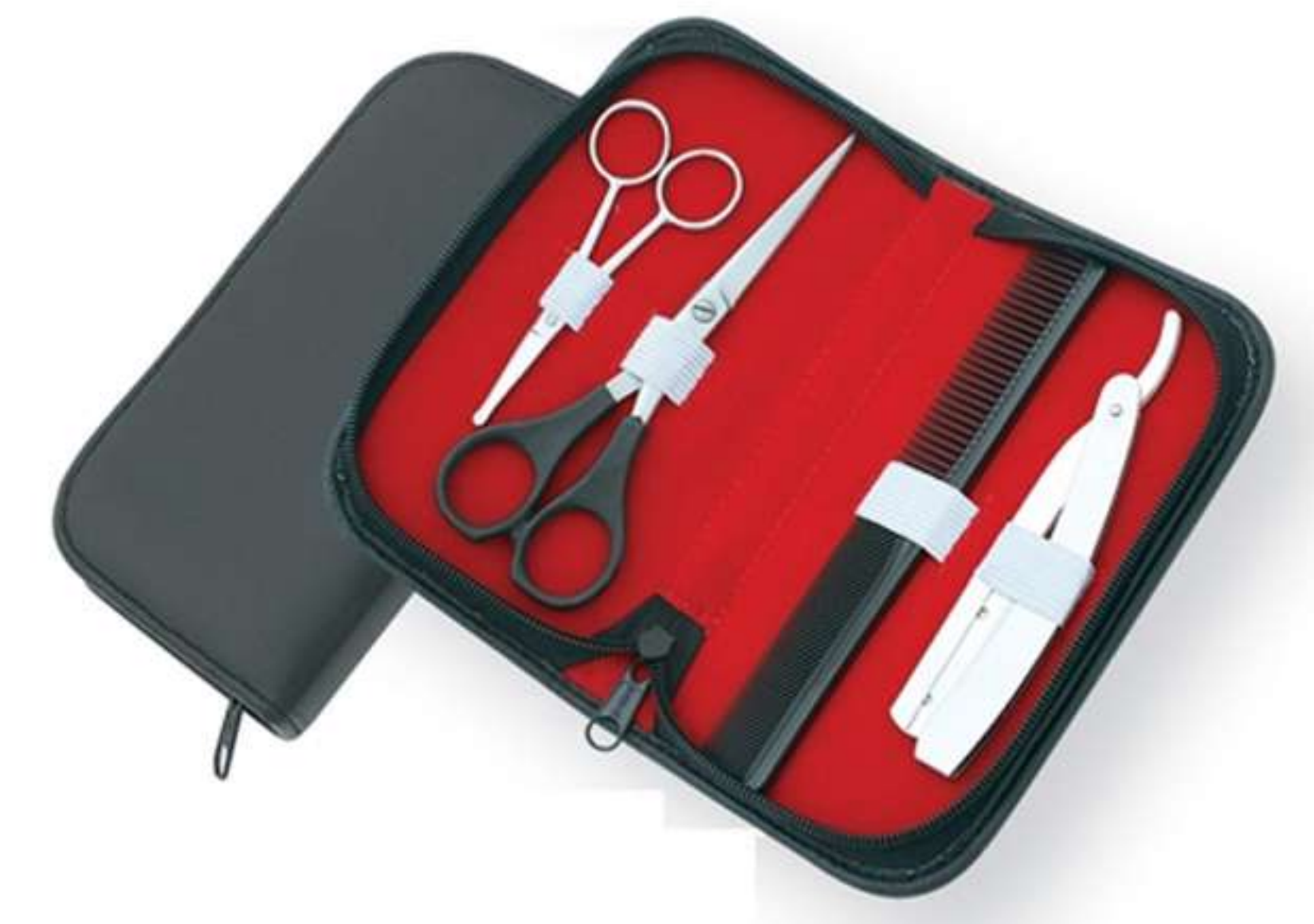
Art no: AS-3-2218

Professional Manicure Set Contains :<br /> Nail Nippers<br /> Cuticle Nippers # 911<br /> Nail File # 105<br />