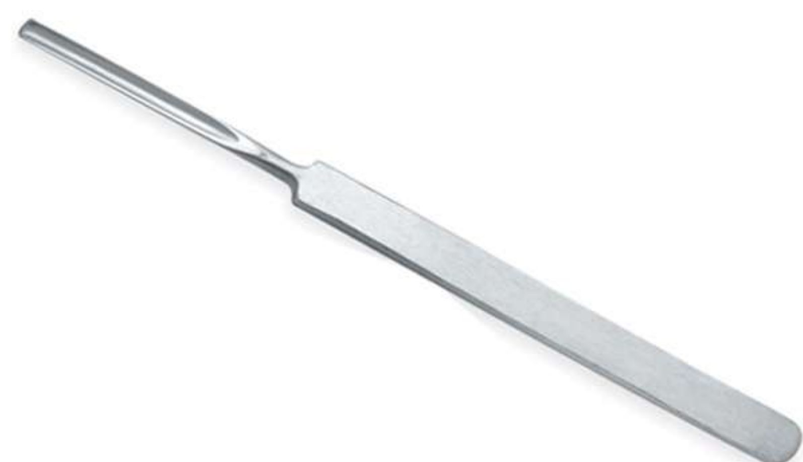
Art no: AS-3-2301

Cuticle Pushers Single Ended made of surgical grade stainless steel of Japanese origin makes these tools truly professional and surgical grade allows you to sterilize these after every use.