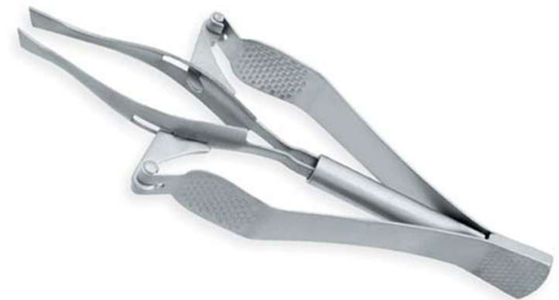
Art no: AS-3-1906

&nbsp;with texture on handles for grip Available Options Size 3" 3.5" 4"