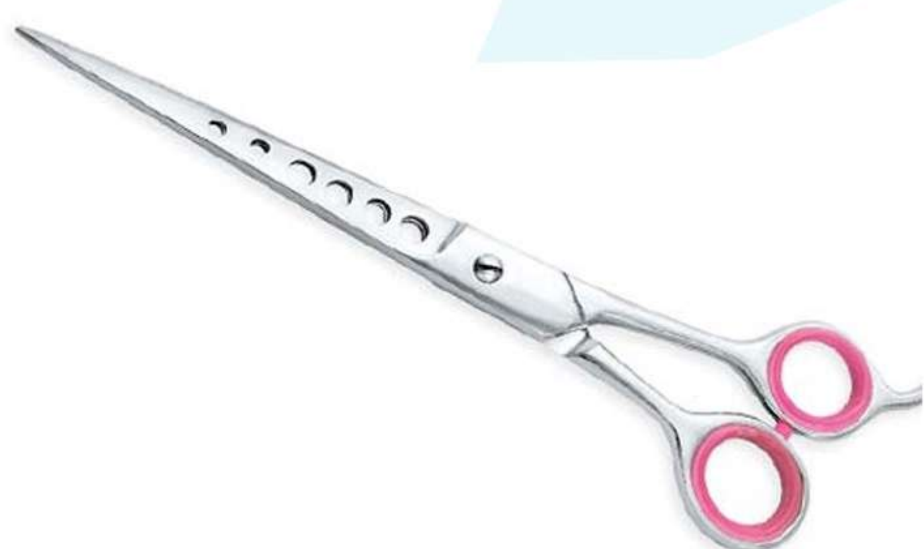
Art no: AS-3-1010

Available in Stainless steel AISI 420 or 440 with hollow ground inner blades and Convex edge, with Swirl thumb for free movement of scissors for very creative and stylish looking cut. Available Options Size 5 1/2" 6"